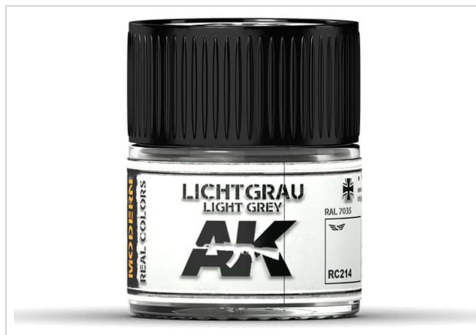
Image 1.1: A 10ml bottle of AK Interactive Real Color Air Paint in Light Grey (Lichtgrau), model RC214, with a black ribbed cap. The label clearly displays "LICHTGRAU LIGHT GREY" and the AK Interactive logo.

This manual provides essential instructions for the proper use and care of AK Interactive Real Color Air Paint, specifically the RC214 Light Grey (Lichtgrau) shade. This product is a high-quality acrylic lacquer paint designed for model building and hobby applications, formulated for smooth airbrush application and excellent adhesion.