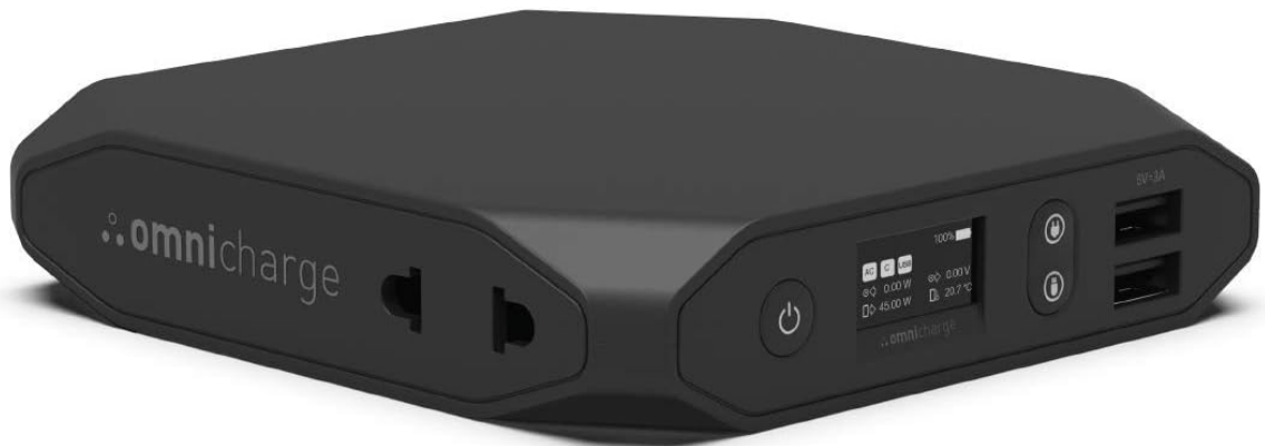
Figure 6: Free yourself from the wall with the 100W AC/HVDC outlet.