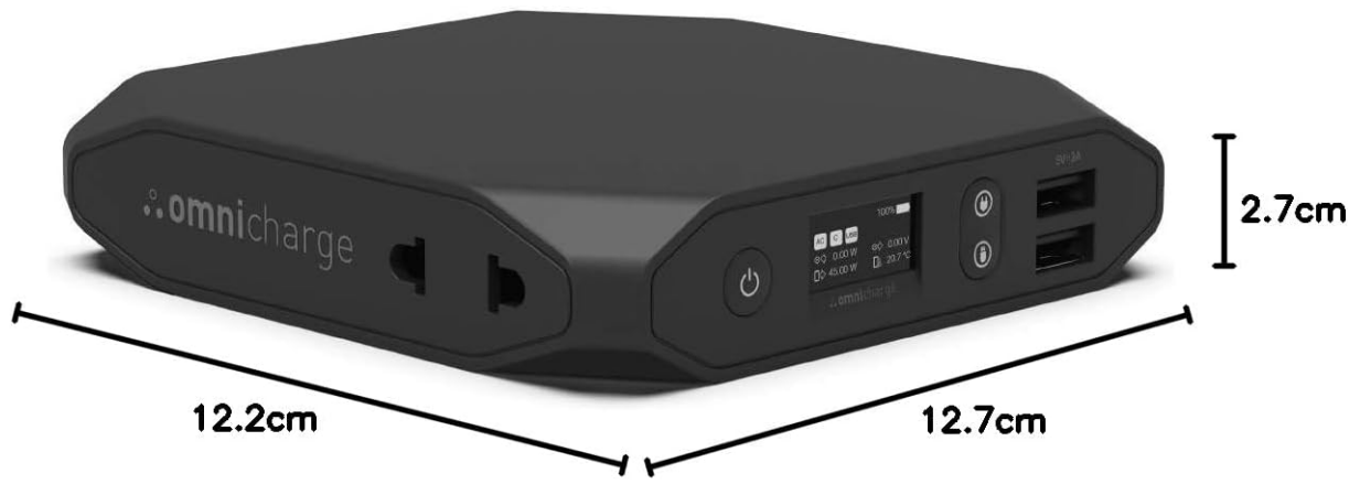
Figure 9: Physical dimensions of the Omni 20+ power bank.