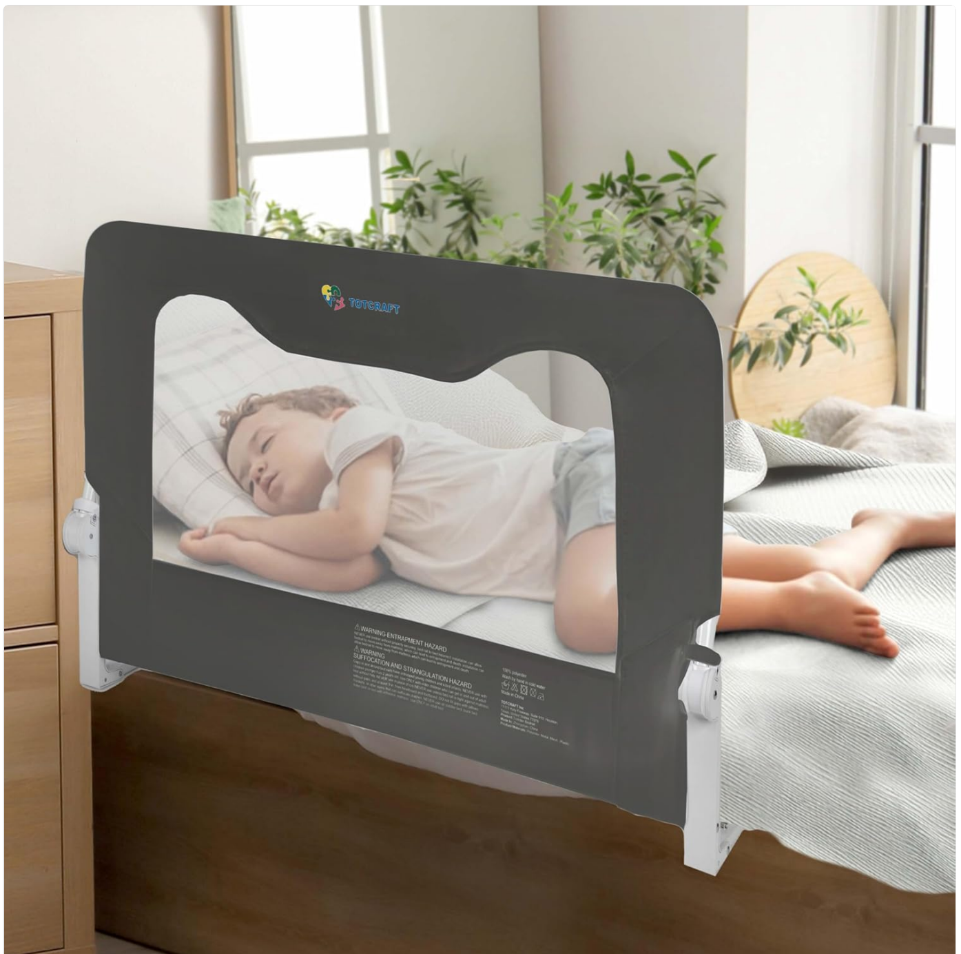
This image shows the TotCraft Bed Safety Rail in grey, securely installed on a bed, providing a protective barrier for a sleeping child. The rail is designed to prevent accidental falls while blending with bedroom decor.