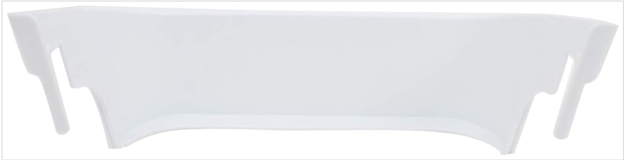
Figure 2: A side profile view of the 240351601 door bin, highlighting the attachment points designed to slide into the refrigerator door slots. This view helps in understanding the installation mechanism.