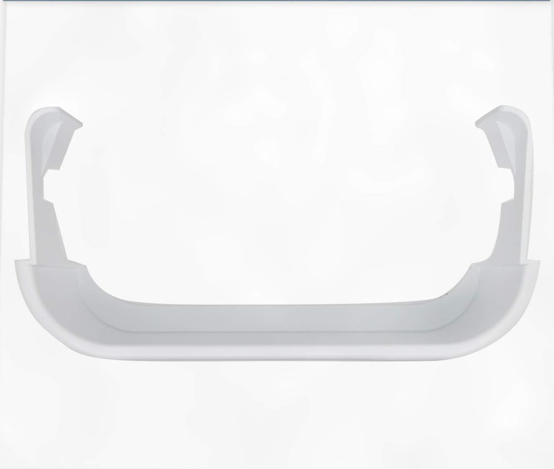
Figure 1: The UpStart Components 240351601 Refrigerator Freezer Door Bin, shown in its retail packaging. This image provides a view of the product as it would appear upon unboxing.