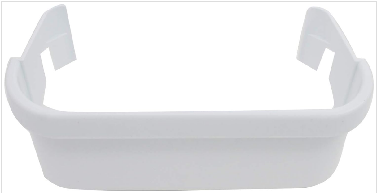
Figure 3: A front-facing view of the 240351601 door bin, showing its general shape and depth. This perspective is useful for confirming the correct part before installation.