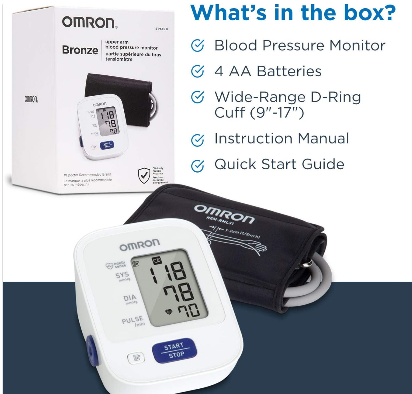
Image: A visual representation of the OMRON Bronze Blood Pressure Monitor package contents, including the monitor unit, 4 AA batteries, the wide-range D-ring cuff (9"-17"), the instruction manual, and a quick start guide.