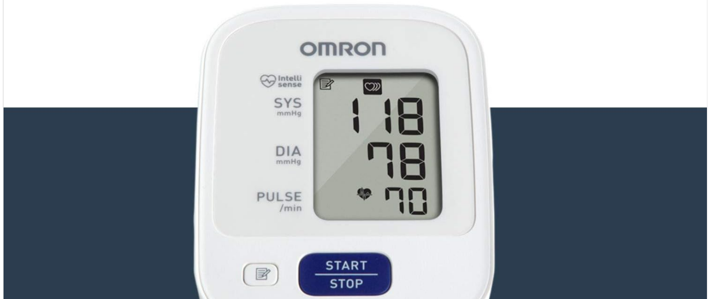
Image: A graphic highlighting the features of the OMRON Bronze monitor, including Memory Storage (stores up to 14 readings), Easy-to-Read Display (large digital screen), and One-Touch Design (simply press to start).