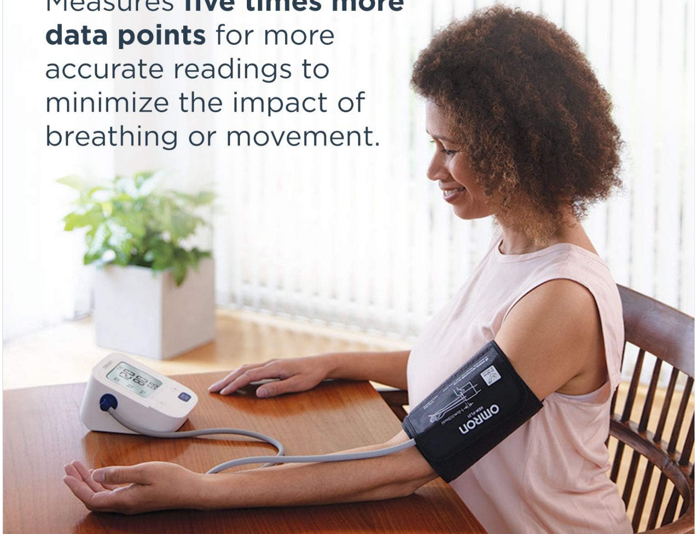
Image: A woman seated at a table, demonstrating the proper use of the OMRON Bronze Blood Pressure Monitor with the cuff correctly placed on her upper arm, illustrating the "Advanced Accuracy Technology" in action.

Measures five times more data points for more accurate readings to minimize the impact of breathing or movement.