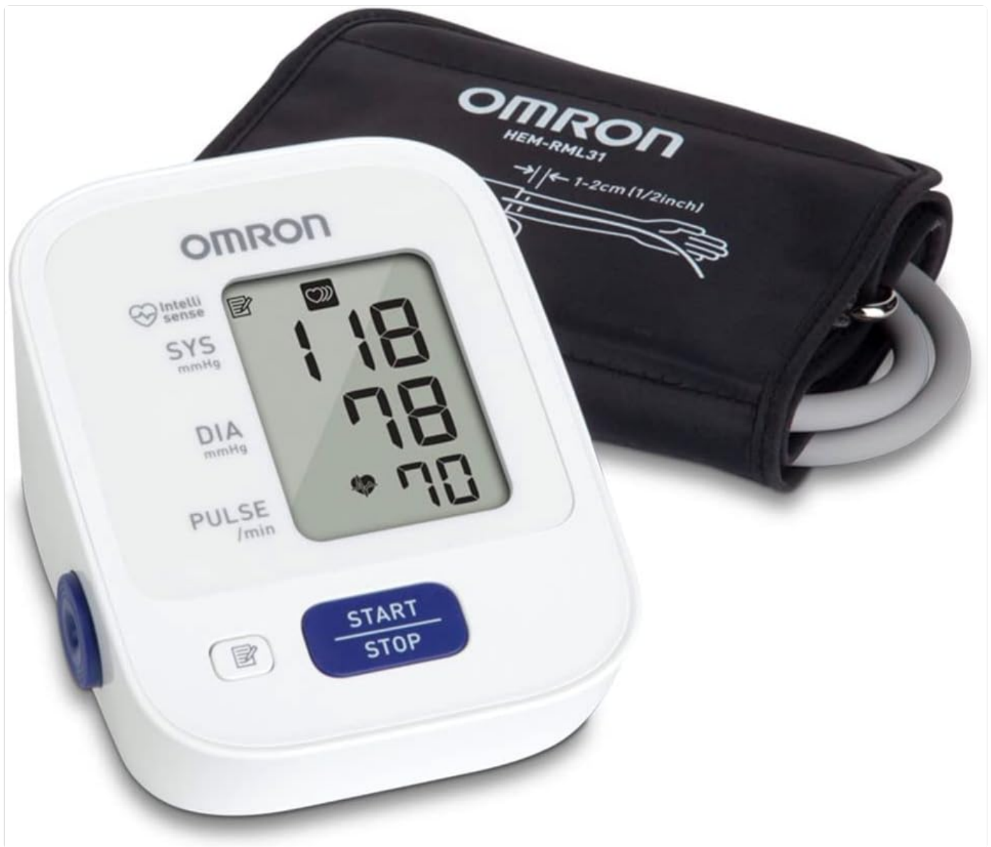
Image: The OMRON Bronze Blood Pressure Monitor, a compact white device with a digital display showing blood pressure readings, accompanied by its black upper arm cuff.

The OMRON Bronze monitor is designed for easy home use, capturing blood pressure readings, detecting irregular heartbeats, and identifying body movement during measurement. It stores up to 14 readings, allowing for easy tracking and sharing of vital information.