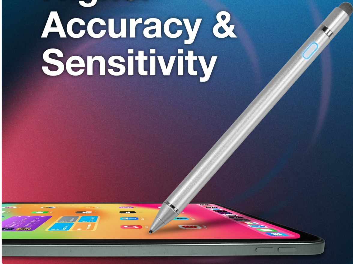
Image: The BoxWave AccuPoint Active Stylus in use on a tablet, illustrating its precision and responsiveness for tasks like drawing or selecting icons.