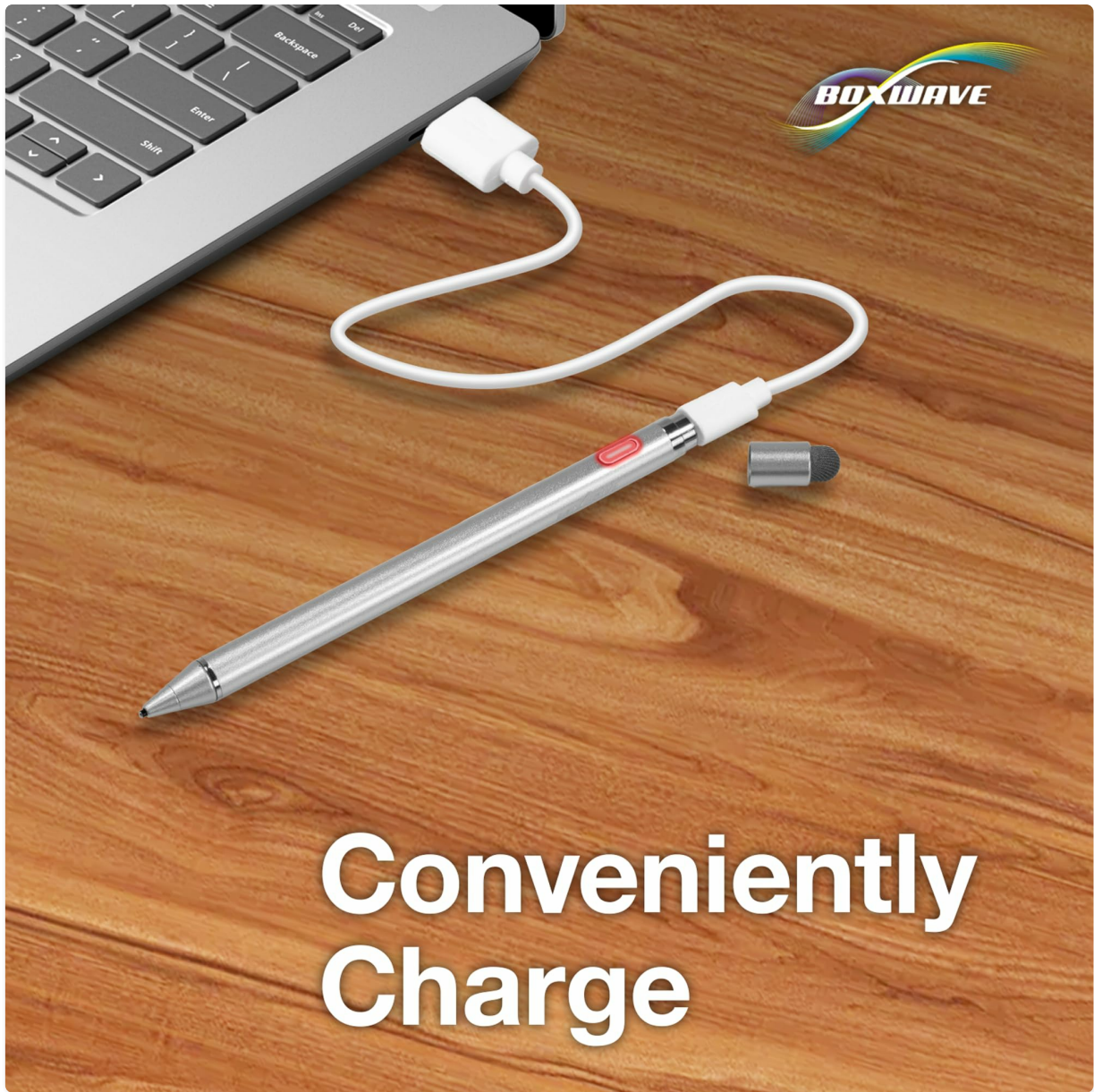
Image: The stylus being charged by connecting its MicroUSB cable to a laptop's USB port, illustrating convenient charging.