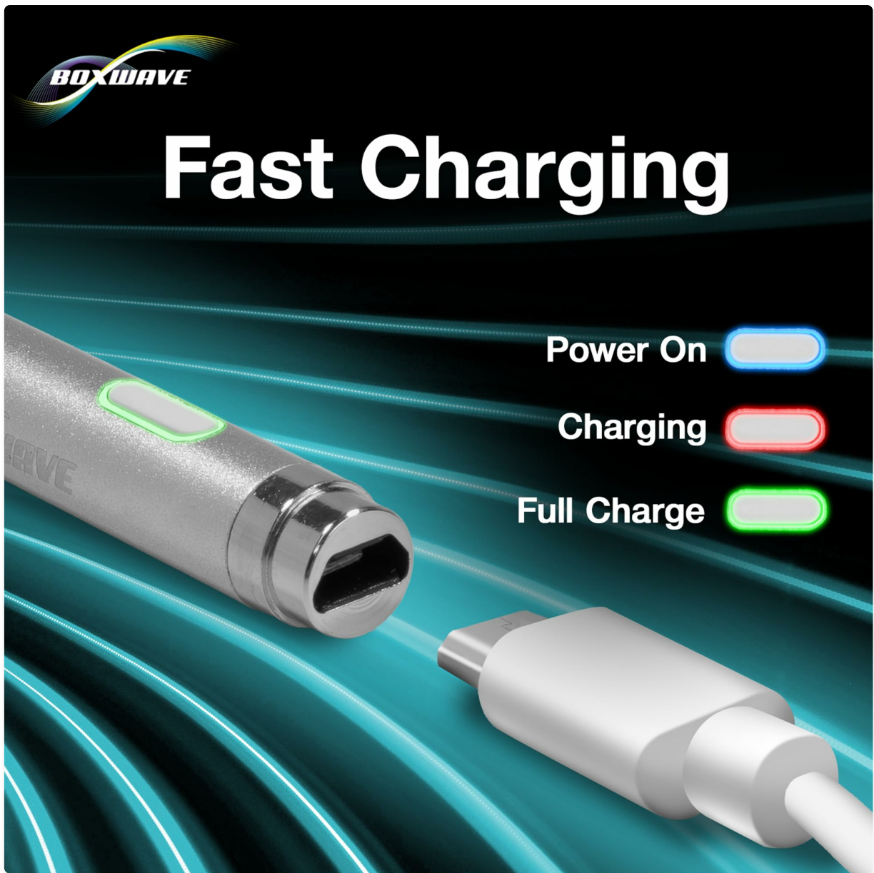
Image: Close-up of the stylus charging port with a MicroUSB cable connected, showing indicator lights for power on (blue), charging (red), and full charge (green).