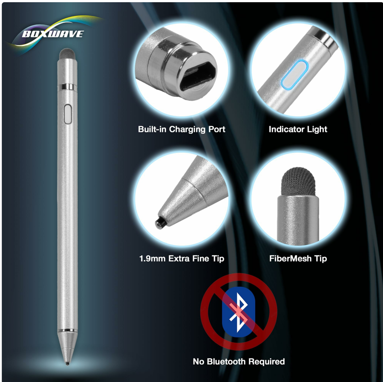
Image: A diagram highlighting the built-in charging port, indicator light, 1.9mm extra fine tip, and the absence of Bluetooth requirement for the stylus.