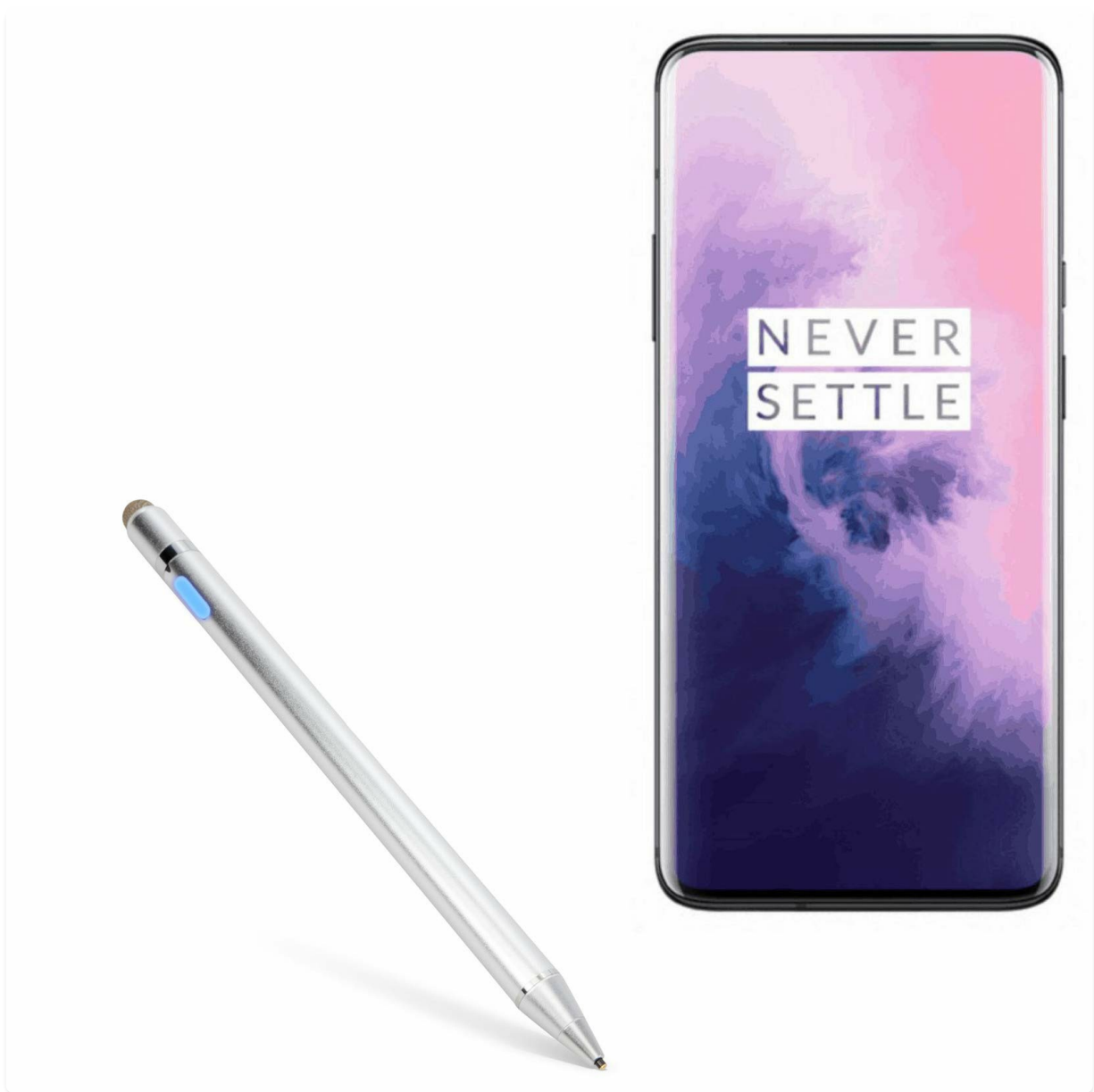
Image: The BoxWave AccuPoint Active Stylus, a sleek metallic silver pen-like device.