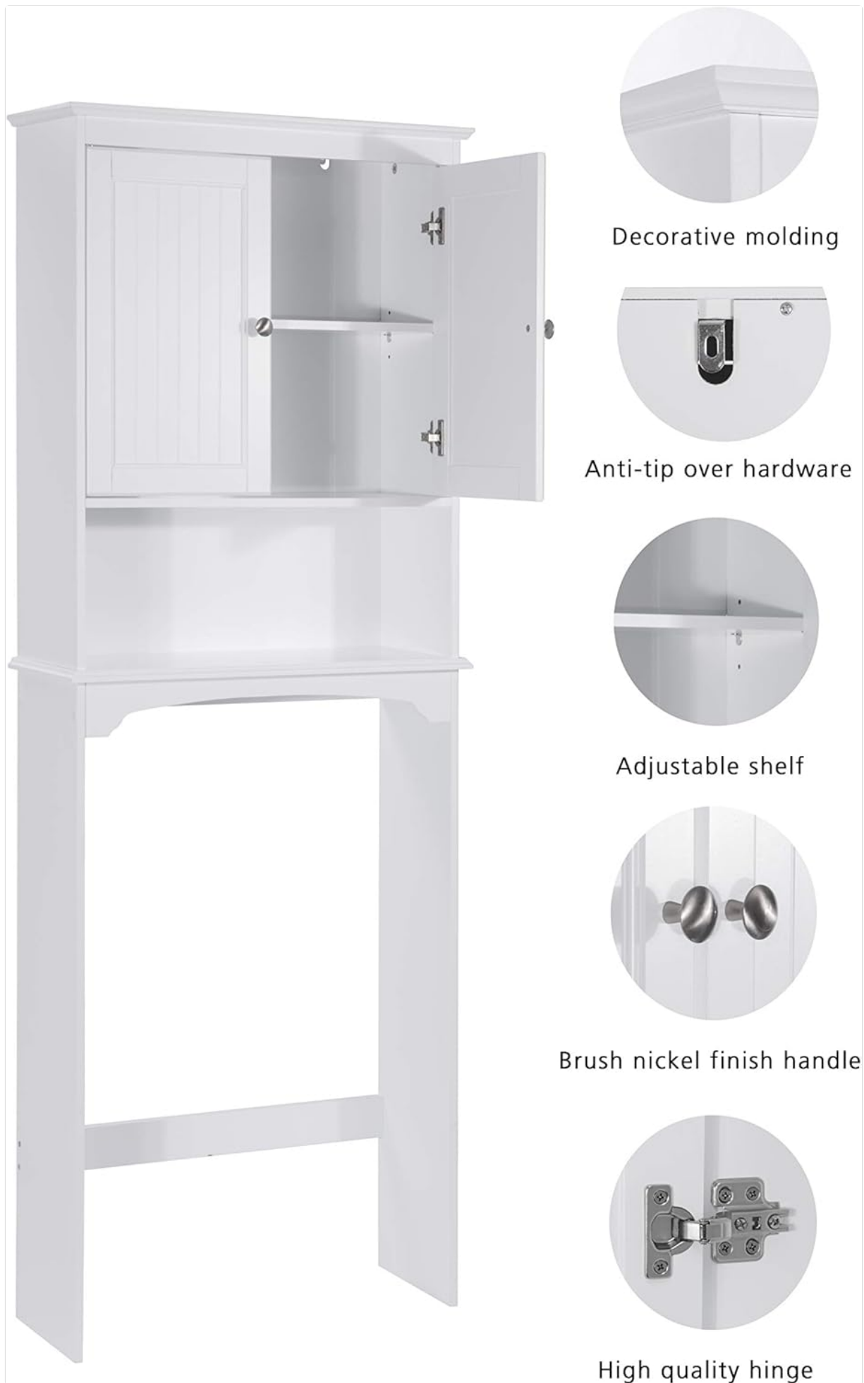
Figure 1: Detailed view of cabinet features, including adjustable shelving and anti-tip hardware.