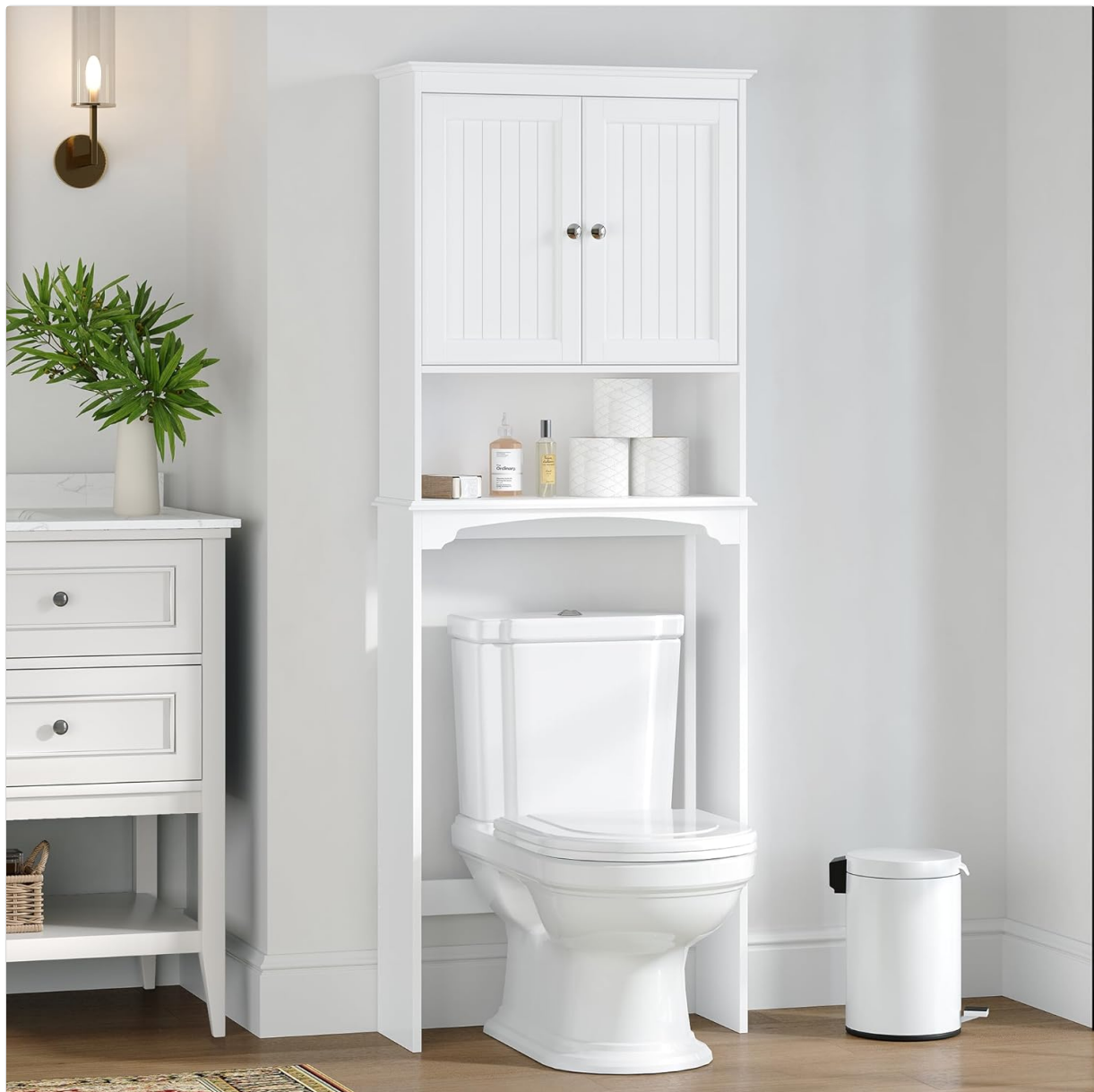
Figure 2: Fully assembled Spirich Over-the-Toilet Storage Cabinet.