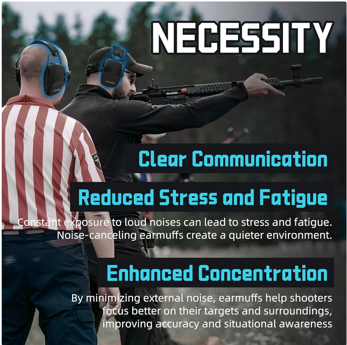
Figure 4: Benefits of using ZOHAN EM054 Hearing Protection