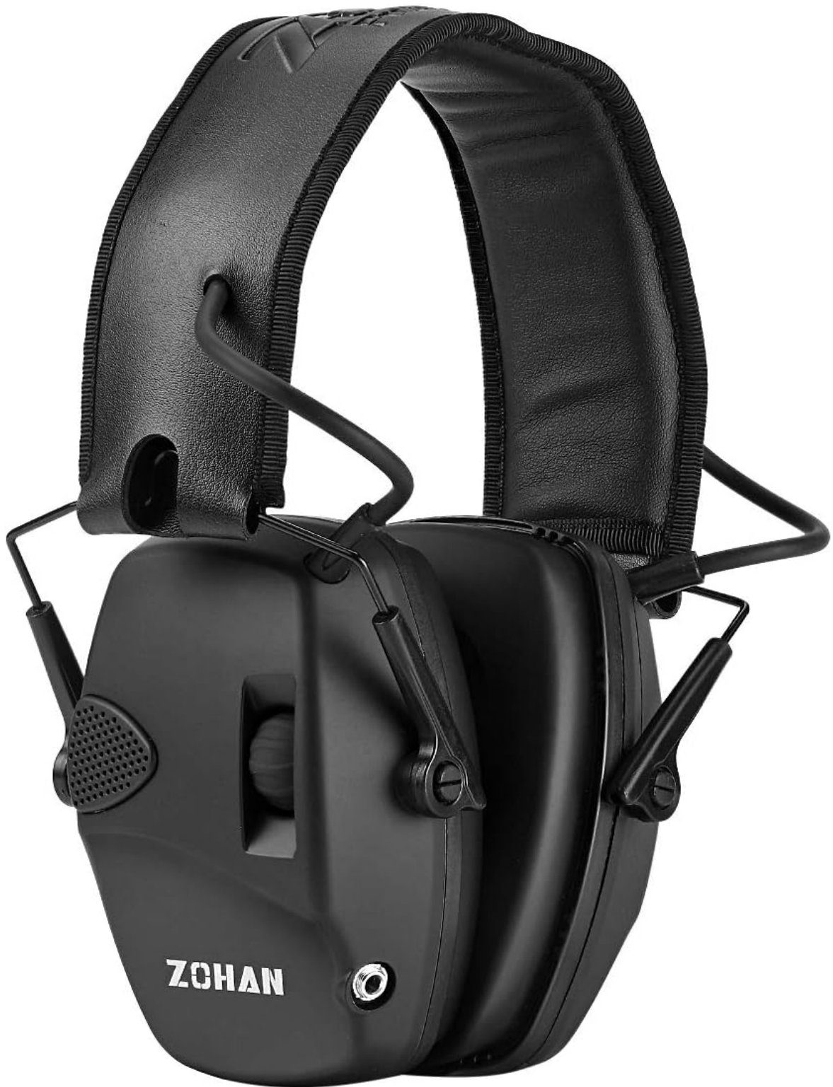
Figure 1: ZOHAN EM054 Electronic Hearing Protection Earmuffs