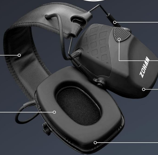
Figure 5: Battery Installation and Adjustable Features