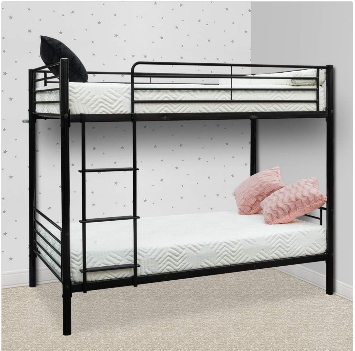
Image: The FCH Twin Over Twin Metal Bunk Bed fully assembled with mattresses and pillows, demonstrating its functional use in a bedroom setting.