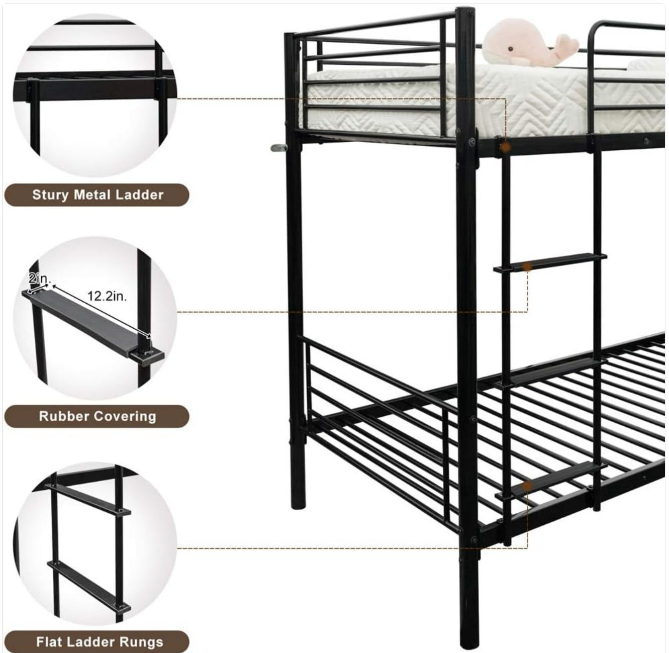
Image: Close-up view of the ladder details, highlighting the sturdy metal construction, rubber covering on the rungs, and flat design for comfort and safety.