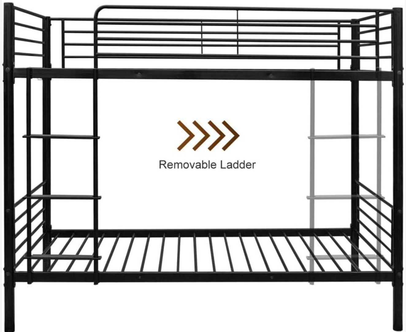
Image: Diagram illustrating the removable ladder feature, which can be attached to either side of the bunk bed.