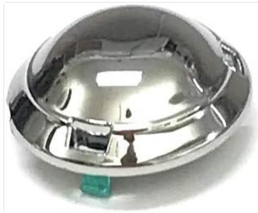
Image 1: Top view of the Samsung Pulsator Washplate Cap, showing its smooth, chrome-like finish. This is the visible part when installed in the washer.