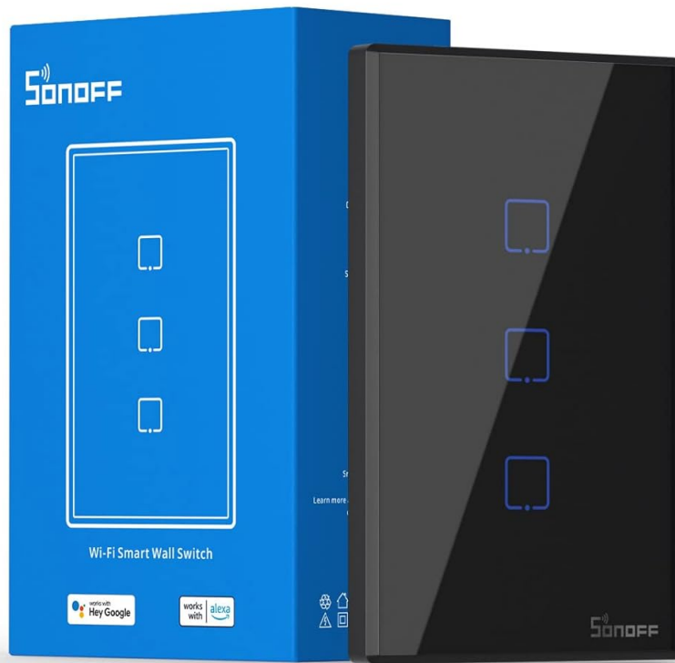
Image: SONOFF TX T3 Black 3-Gang Smart Light Switch and its retail packaging.