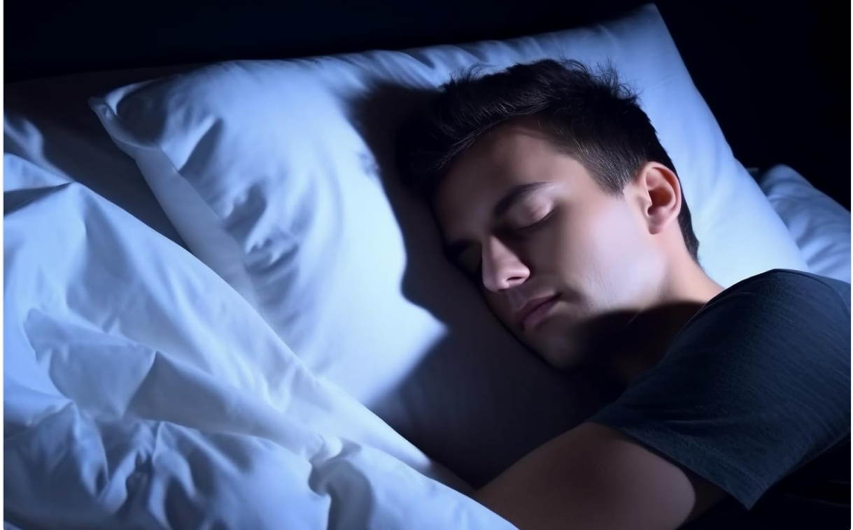
Image: Set timers and schedules to automate your lighting.