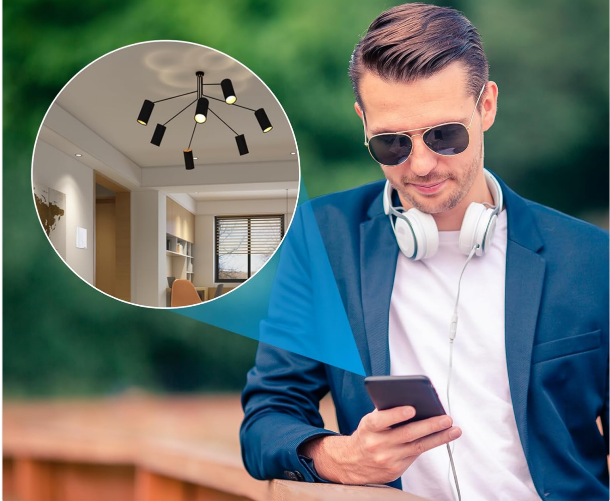
Image: Control your home devices from anywhere using the eWeLink App.