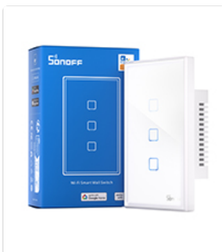
Image: The toughened glass panel is easy to clean.

The glass panel of the SONOFF TX T3 switch is designed for easy cleaning. Simply wipe the surface with a soft, damp cloth. Avoid using abrasive cleaners or harsh chemicals that could damage the finish.