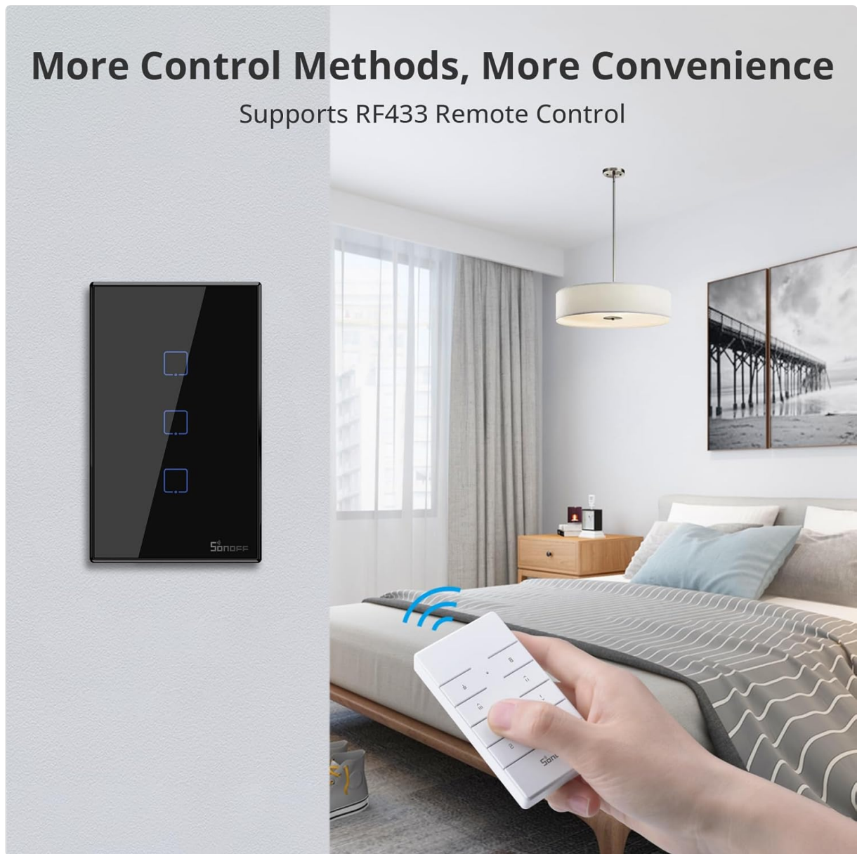
Image: The smart switch supports RF433 remote control for flexible operation.