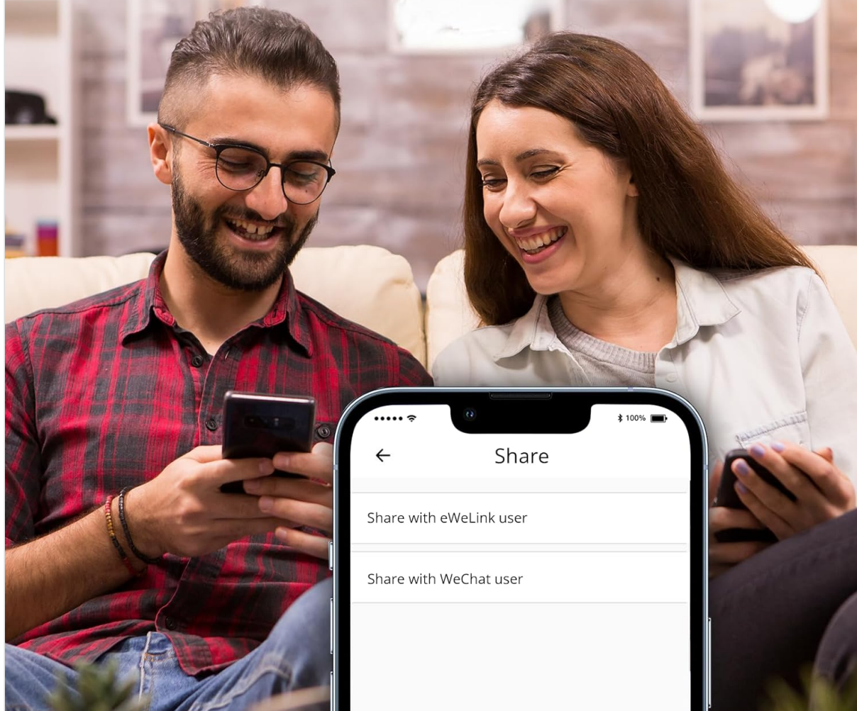
Image: Share device control with your family for shared convenience.