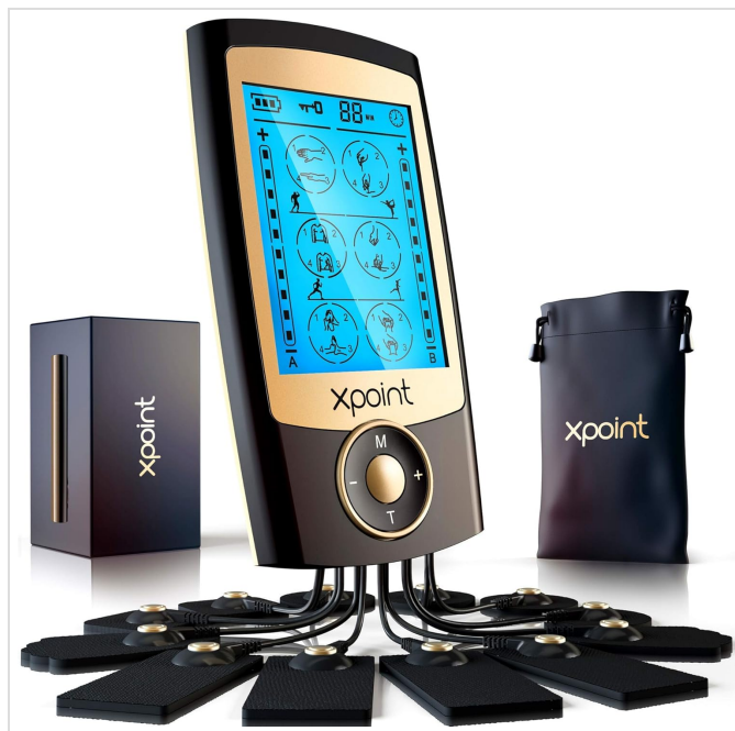
The Xpoint TENS EMS unit, showcasing its sleek black and gold design, along with the included electrode pads and storage bag, emphasizing portability and easy storage.