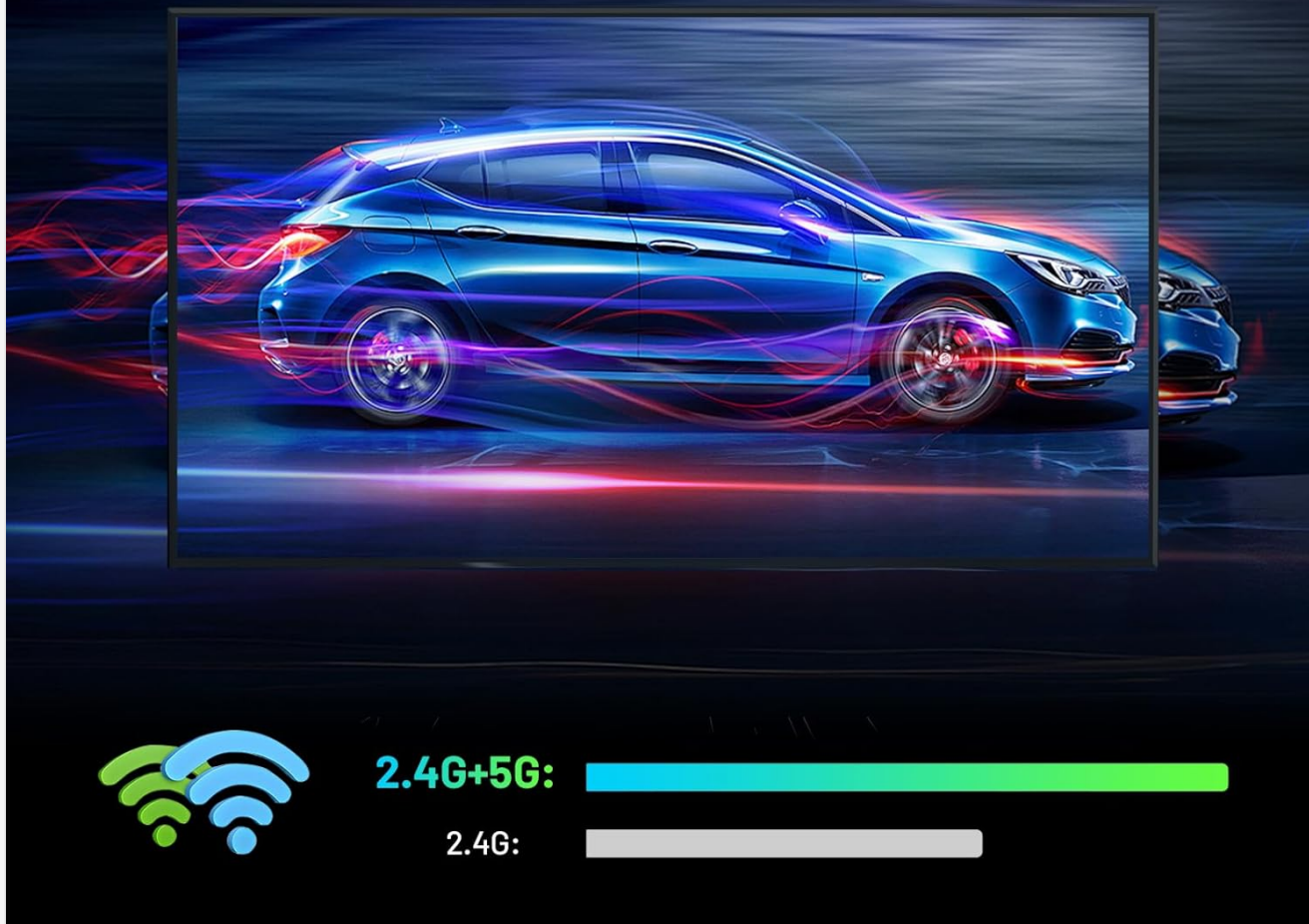
Image 8.2: Dual-band Wi-Fi 6 for faster and more stable connectivity.

Faster speed, lower latency, larger capacity, more secure network