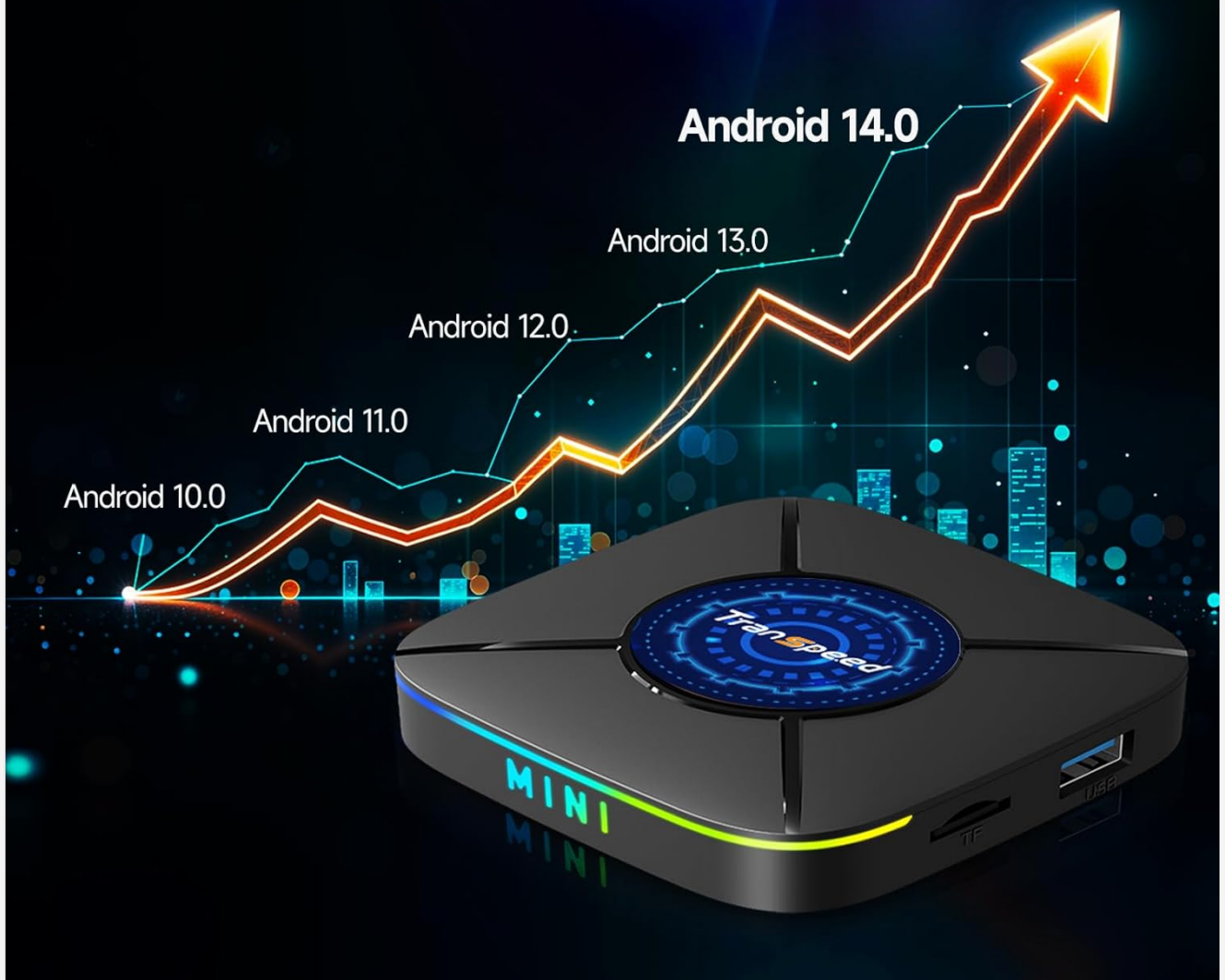
Image 5.1: The Android 14 operating system provides an enhanced user experience.

Higher quality output, powerful graphics processor, stable