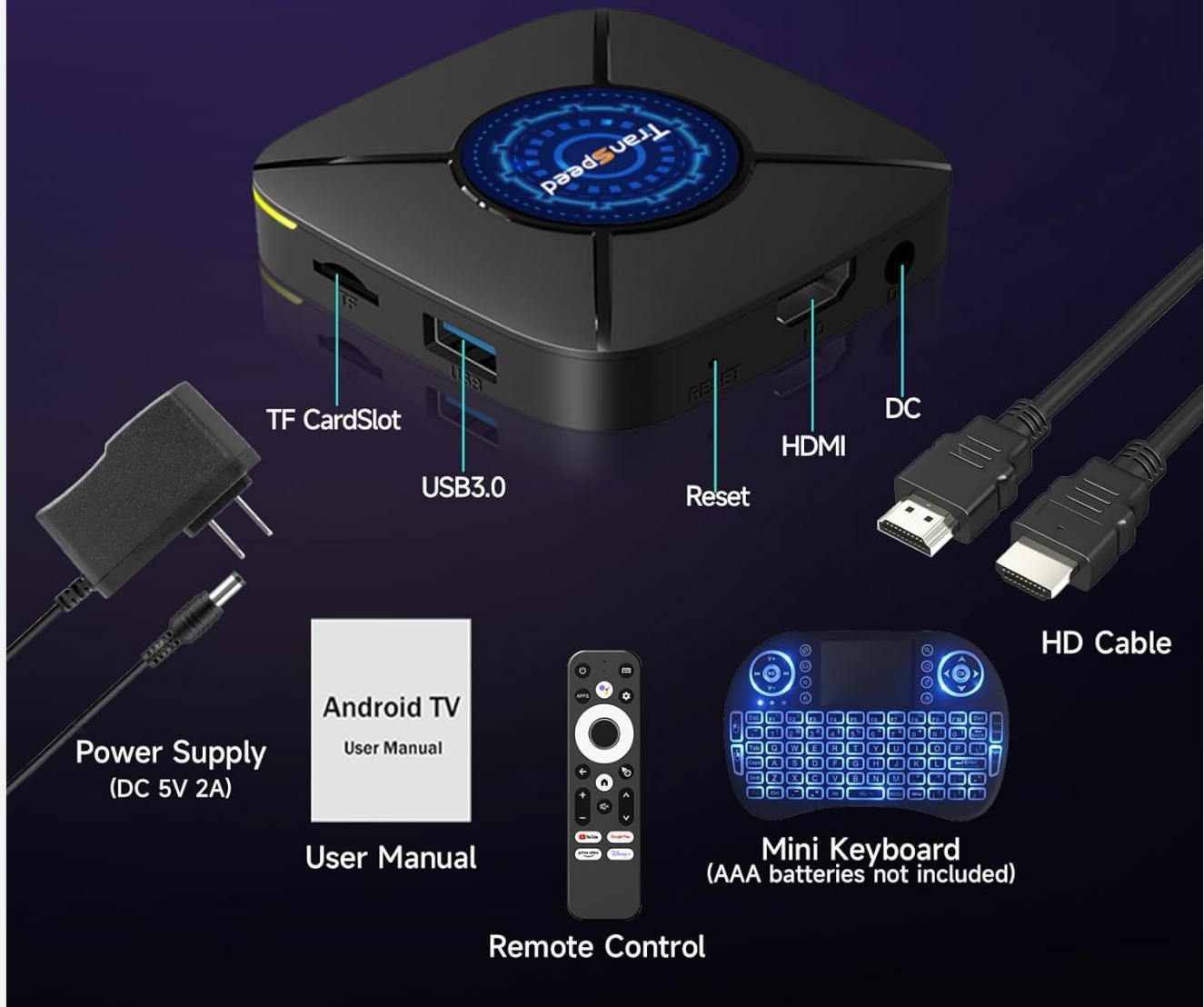
Image 2.1: Contents of the Transpeed Android TV Box X3 PLUS package.