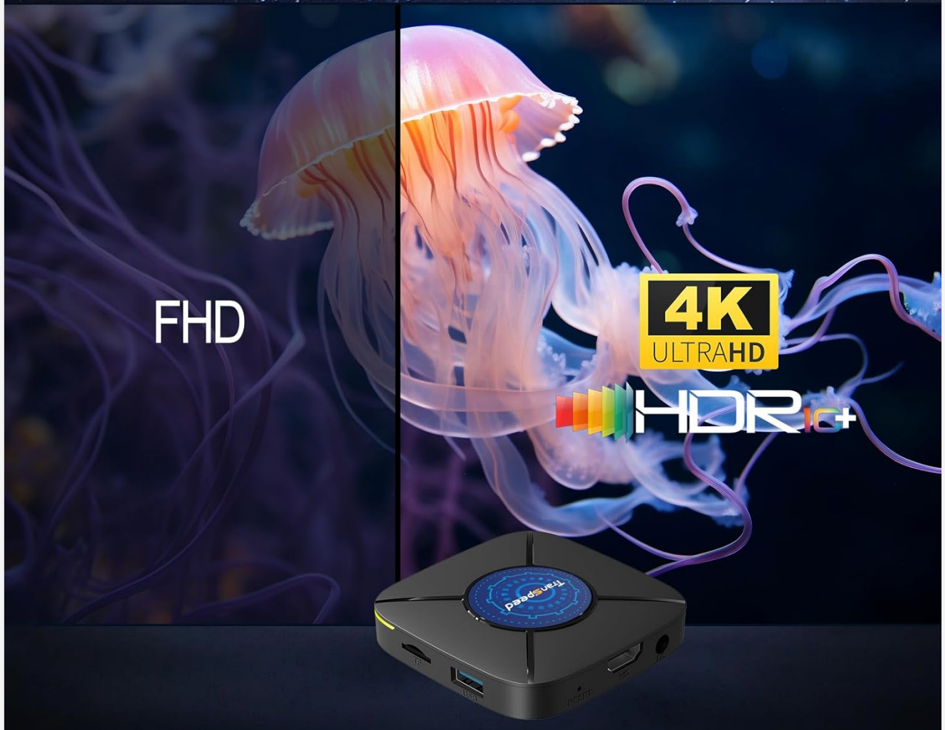
Image 5.2: Experience crystal-clear 4K resolution with HDR10 support.

Dive into a world of crystal-clear 4K resolution, where every pixel is rendered with stunning clarity and realism.