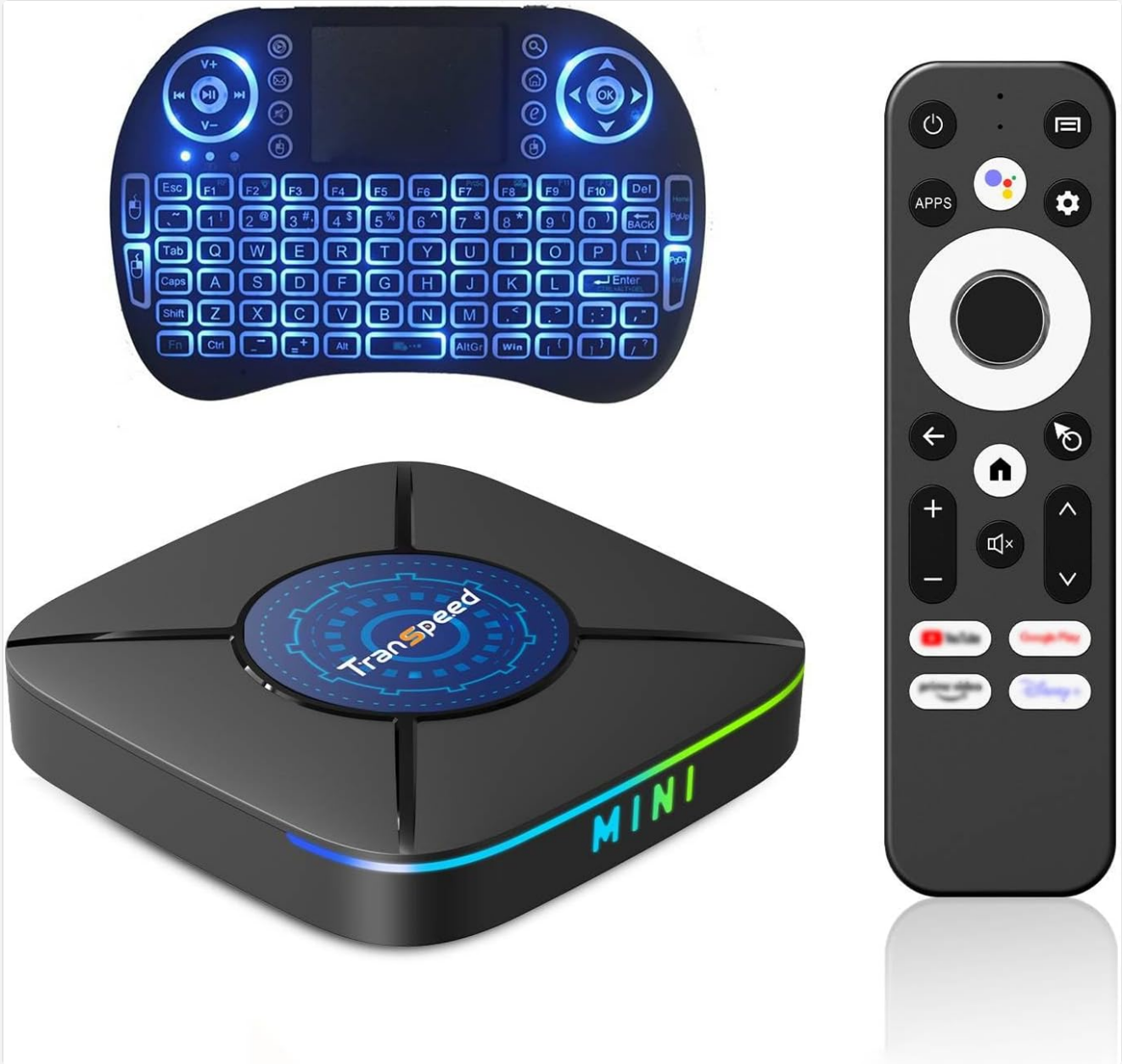
Image 1.1: Transpeed Android TV Box X3 PLUS with included remote and mini keyboard.