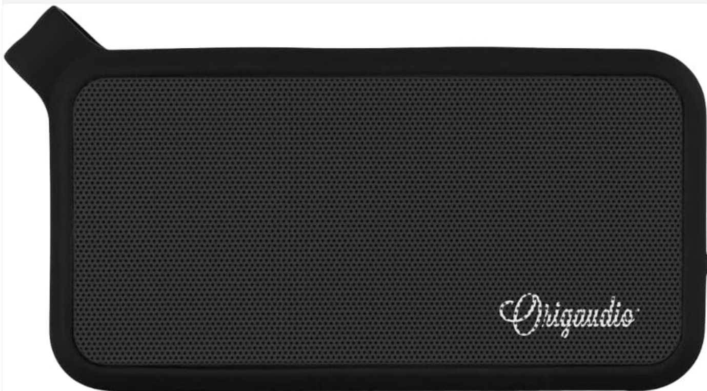
Image: The Origaudio Aquathump speaker, showcasing its sleek, rectangular design with a black grille and the Origaudio logo. This image provides a clear view of the speaker's main body.

This manual provides essential information for the safe and effective operation of your Origaudio Aquathump Waterproof Wireless Bluetooth Speaker. Please read this manual thoroughly before using the device and retain it for future reference.