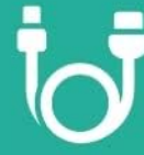
Micro-USB Charging Cable