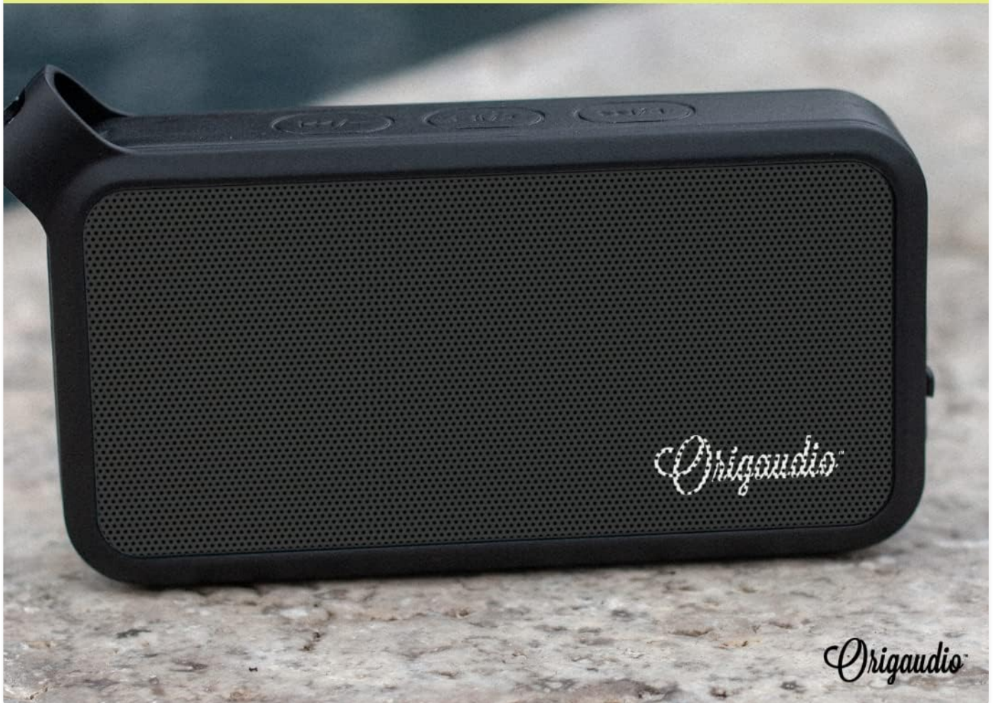
Image: The Aquathump speaker positioned outdoors, with text overlay indicating "4+ hours of Playtime," illustrating its extended battery life for on-the-go use.