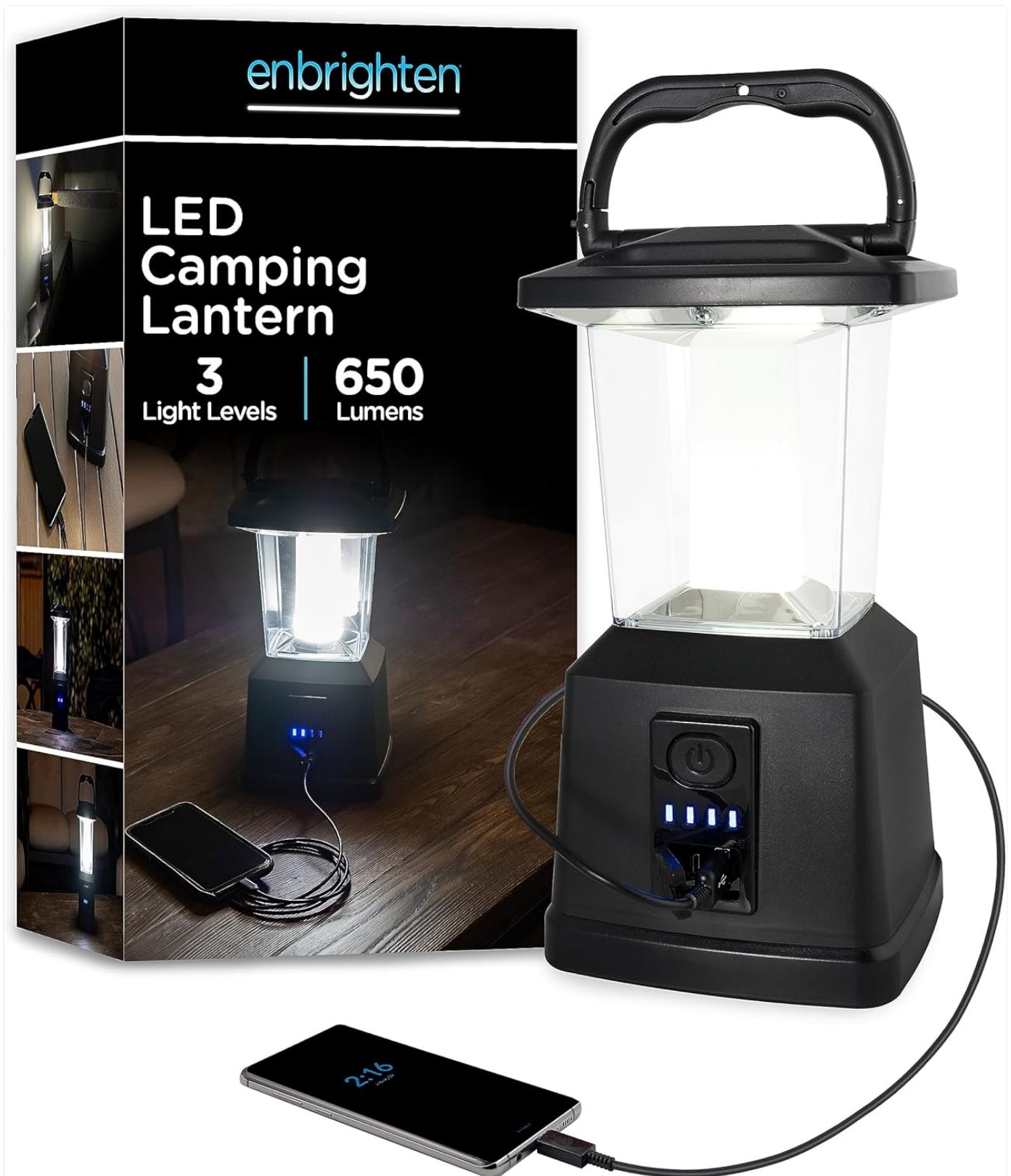
Image: The Enbrighten LED Camping Lantern, showcasing its design and key features like 3 light levels and 650 lumens.