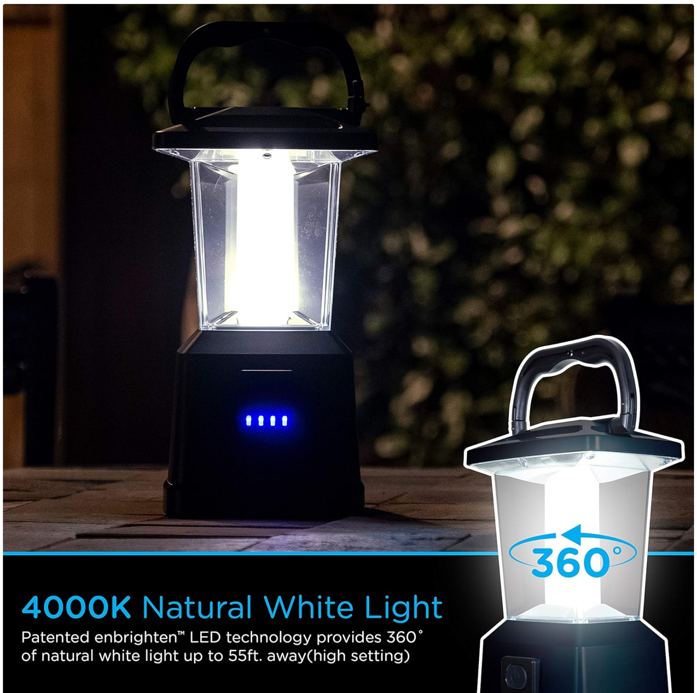
Image: The lantern illuminating an outdoor area, highlighting its 360-degree 4000K natural white light output.