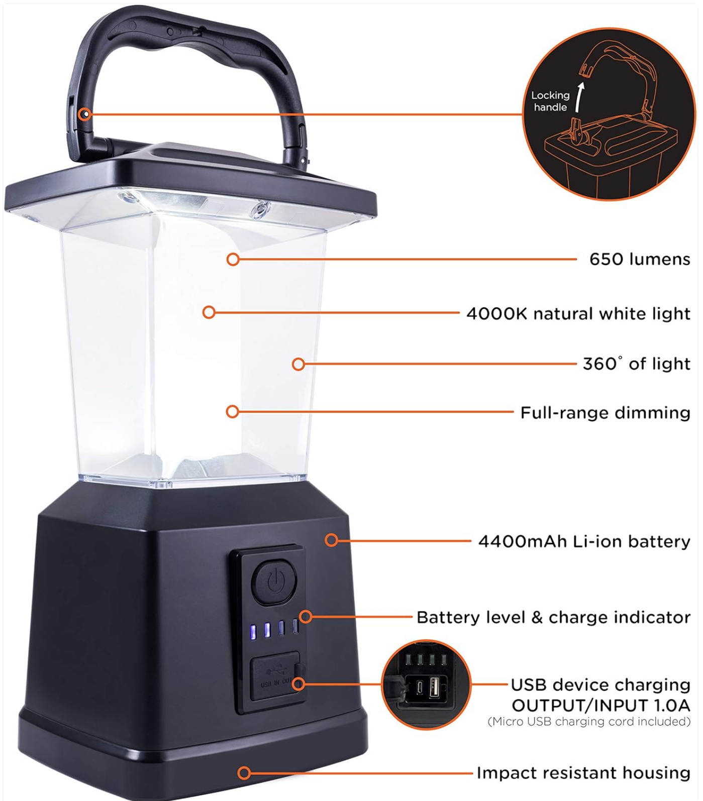
Image: A detailed diagram of the lantern, pointing out its key components including the 4400mAh Li-ion battery, USB charging port, battery level indicator, and the power/dimming button.