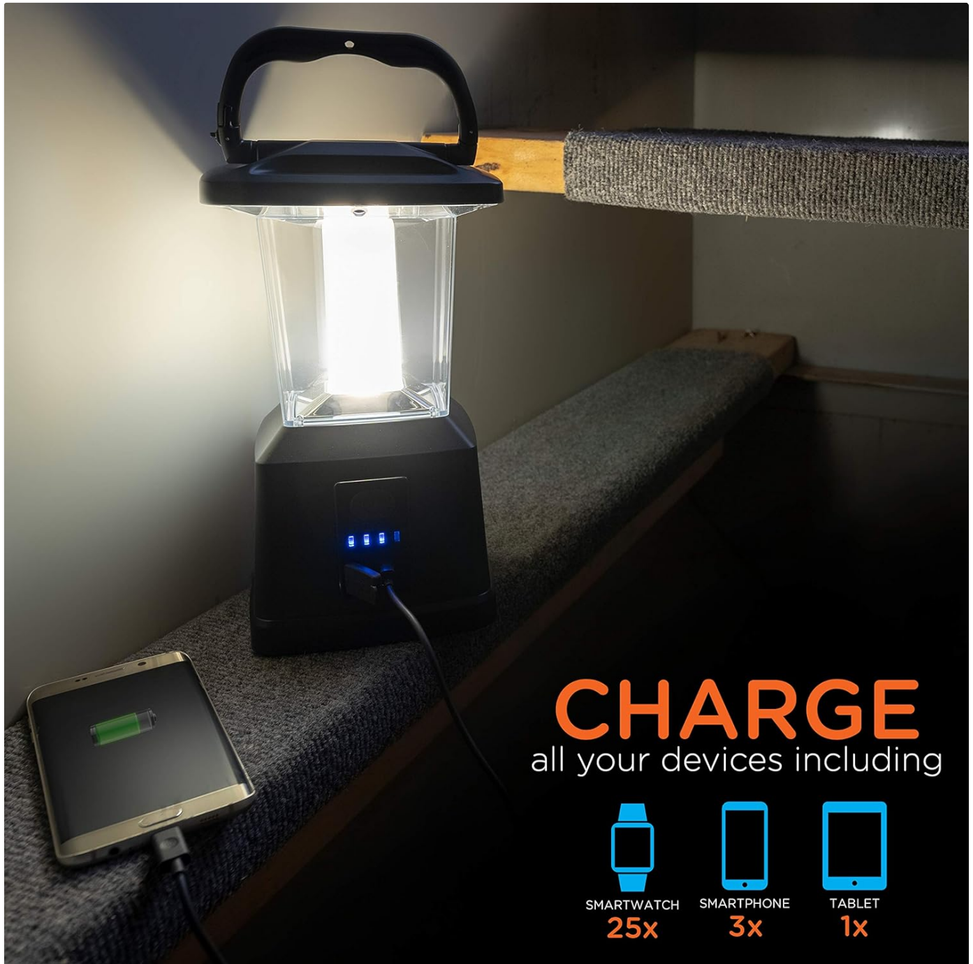
Image: The lantern actively charging a smartphone, demonstrating its power bank functionality.