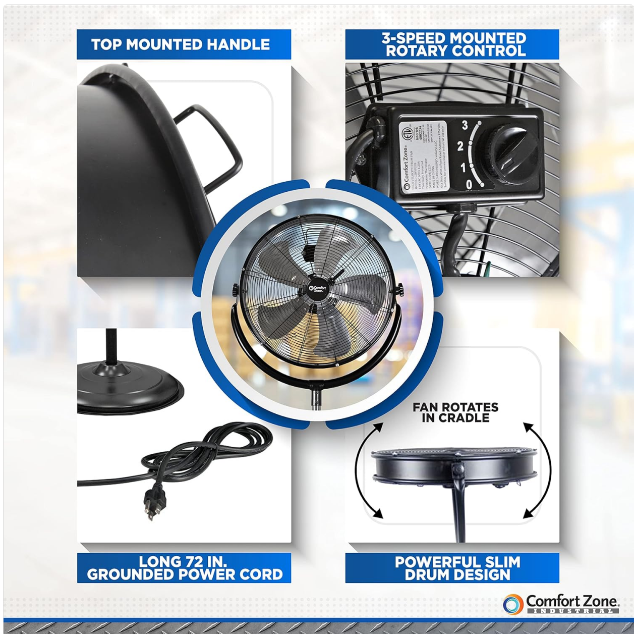
Image: Detailed view of the Comfort Zone 20-Inch Industrial Pedestal Fan highlighting its key features.