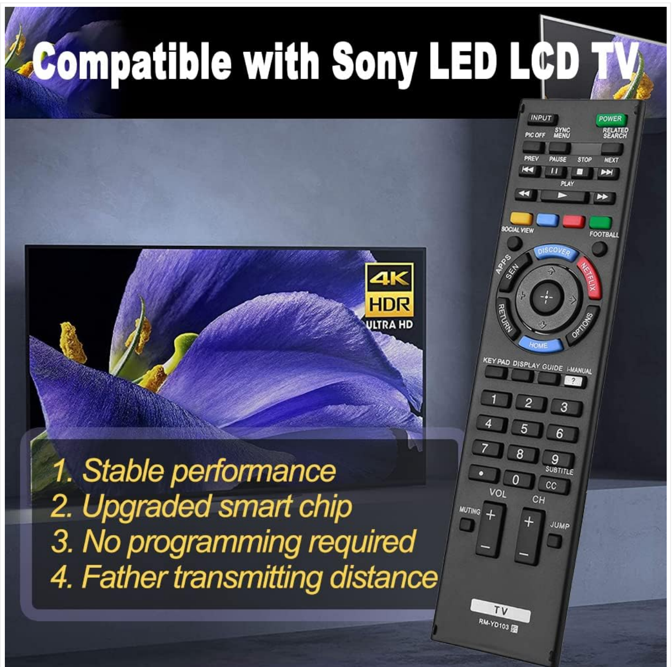
Image: The AZMKIMI Universal TV Remote Control, highlighting its compatibility with Sony LED LCD TVs. Key features include stable performance, an upgraded smart chip, no programming required, and an extended transmitting distance.