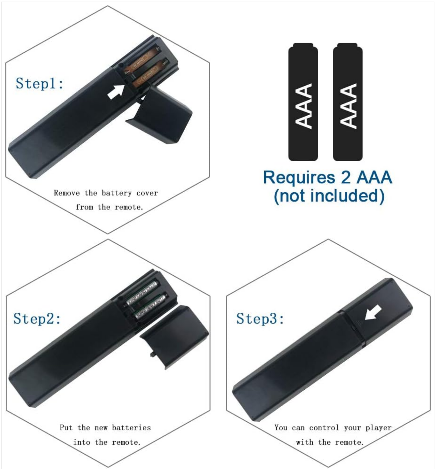
Image: A visual guide demonstrating the three steps for installing AAA batteries into the remote control.

3. Step 3: Replace the battery cover until it clicks securely into place.