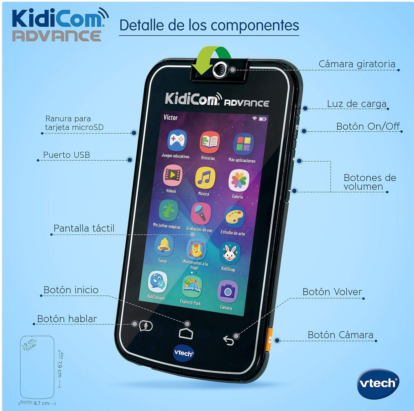
Image: Detailed view of the VTech KidiCom Advance, highlighting its components such as the rotating camera, On/Off button, volume buttons, USB port, microSD card slot, touchscreen, home button, talk button, back button, and camera button.