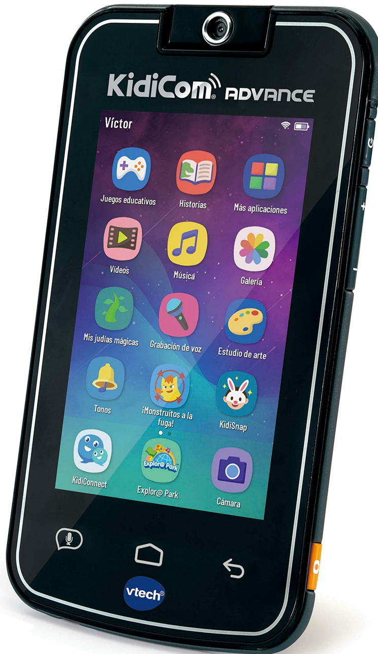
Image: The main screen of the Kidicom Advance displaying icons for educational games, stories, videos, music, gallery, KidiConnect, Explora Park, and camera.

The Kidicom Advance features a 5-inch HD touchscreen. Swipe left or right to navigate between screens, and tap icons to open applications. The Home button returns you to the main screen, and the Back button navigates to the previous screen.