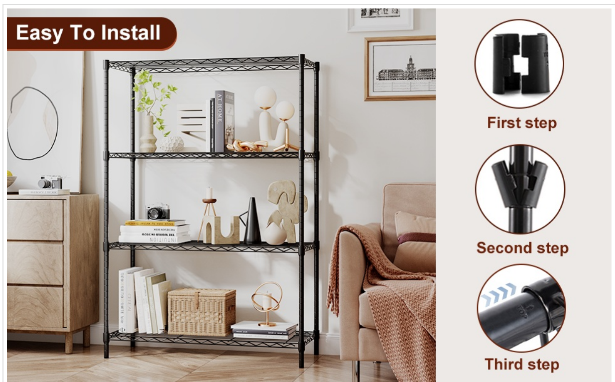
Image: Visual guide for the tool-free assembly process, illustrating how to attach plastic clips and position shelves.

Your browser does not support the video tag.