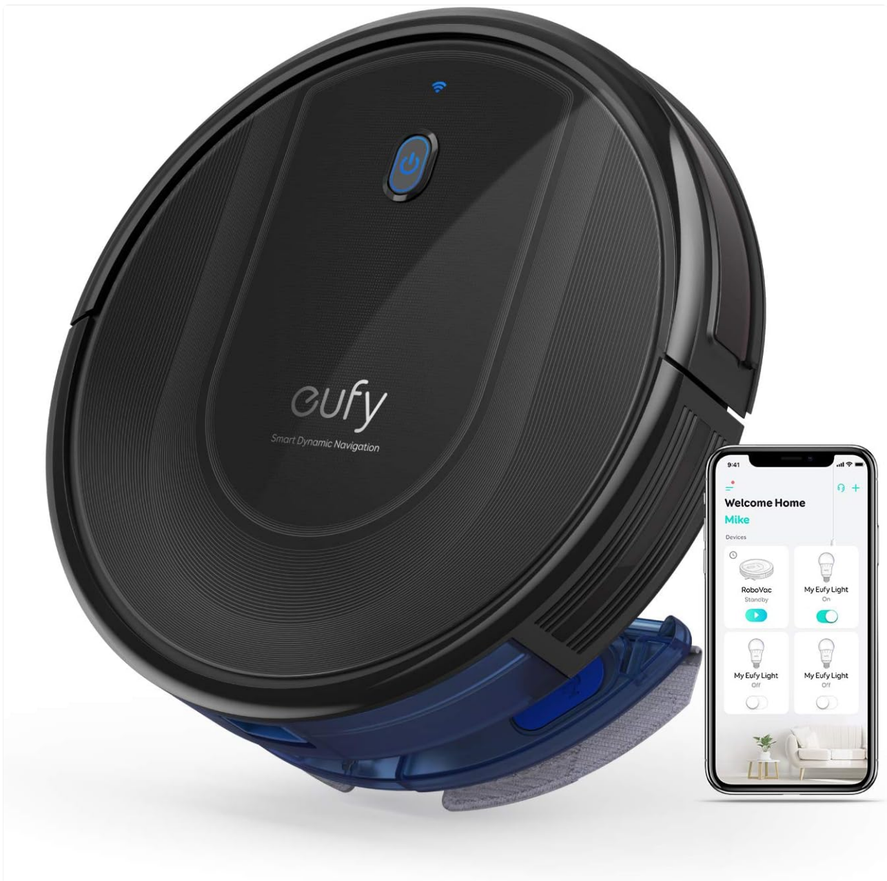
The eufy RoboVac G10 Hybrid, showcasing its sleek design, charging base, and the accompanying smartphone application for control.