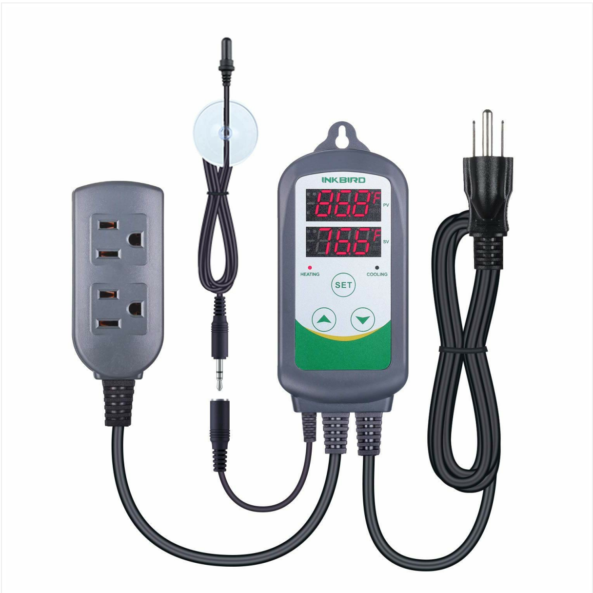
Figure 4.1: Overview of the Inkbird ITC308S controller, showing the display, control buttons, power cord, and probe connection.