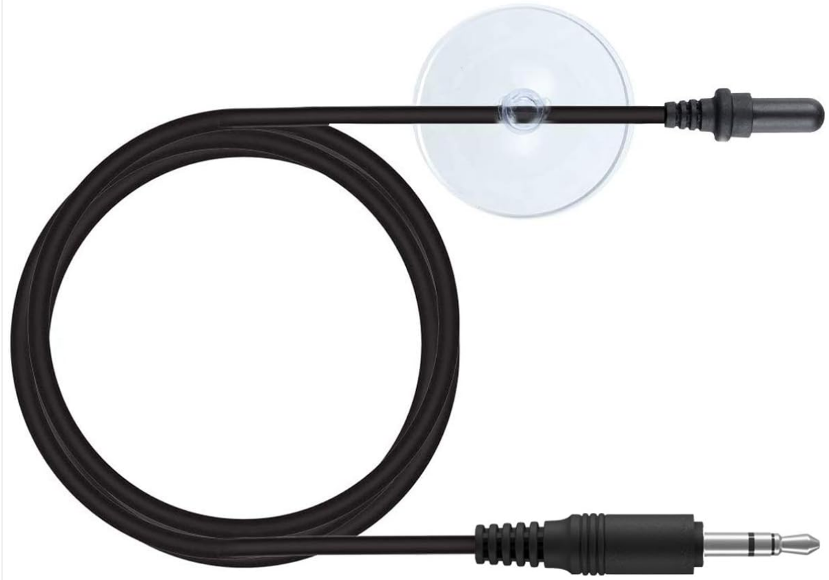
Figure 4.3: The submersible temperature probe, designed for accurate readings in water, shown with its suction cup.