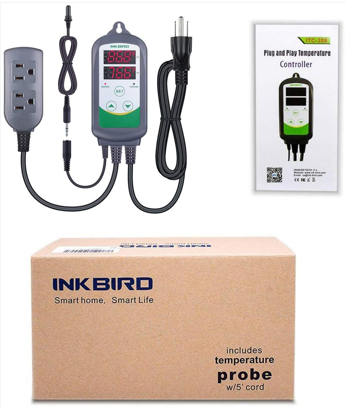
Figure 3.1: The Inkbird ITC308S Temperature Controller and its included accessories, packaged in a brown box.