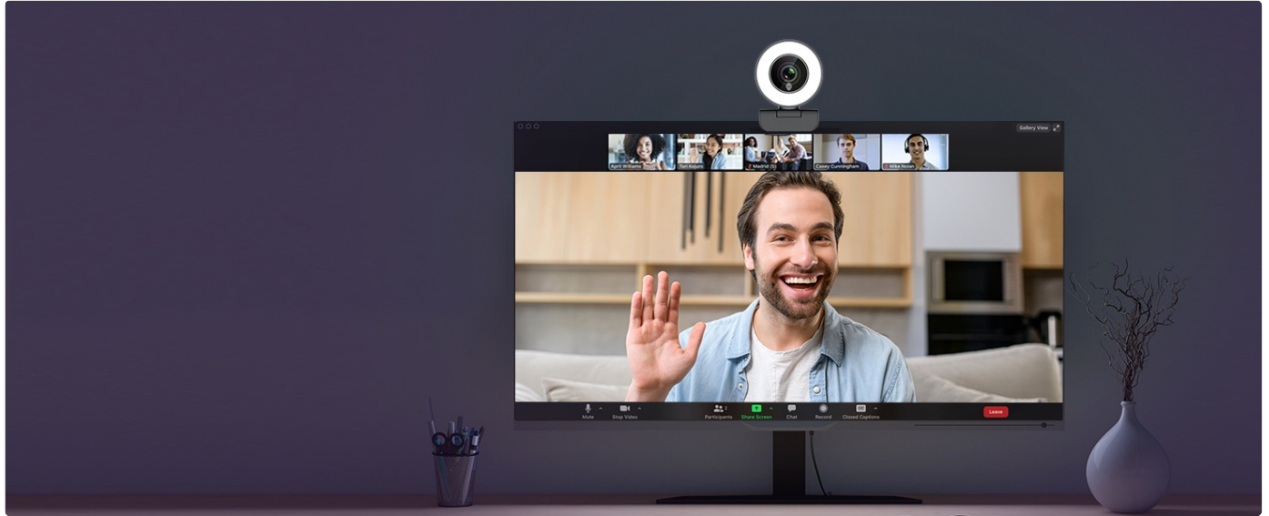
Image: A graphic detailing the broad compatibility of the Angetube 967 Webcam with different operating systems and popular streaming/video conferencing applications.