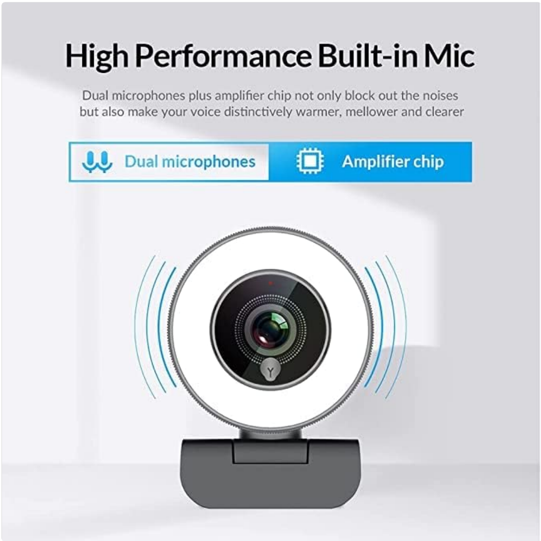
Image: A diagram illustrating the webcam's dual noise-canceling microphones and amplifier chip for enhanced audio quality.

The integrated dual noise-canceling microphones are designed to capture clear audio while minimizing background distractions. Ensure the webcam is positioned appropriately to optimize sound pickup, ideally within 3 meters for best results.