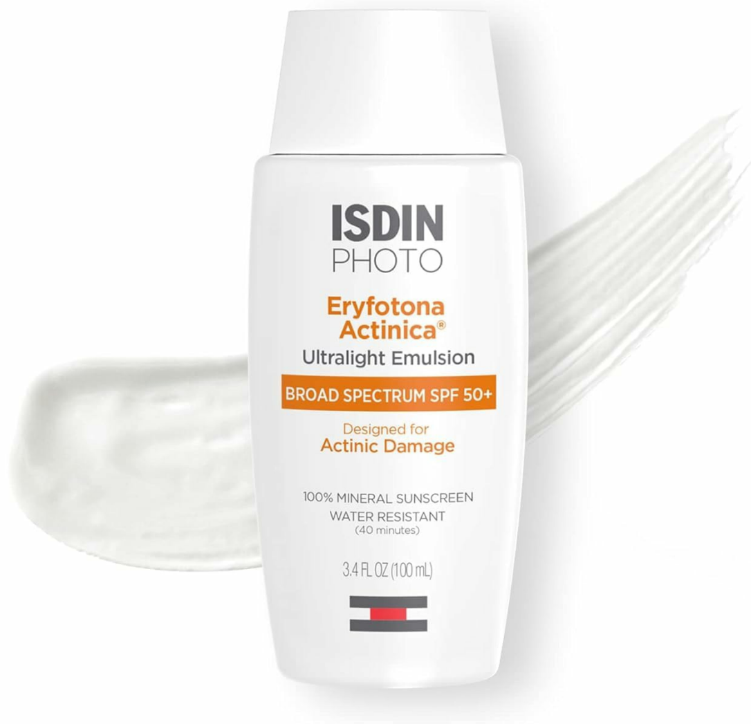
Image: Front view of the ISDIN Eryfotona Actinica Ultralight Emulsion bottle.