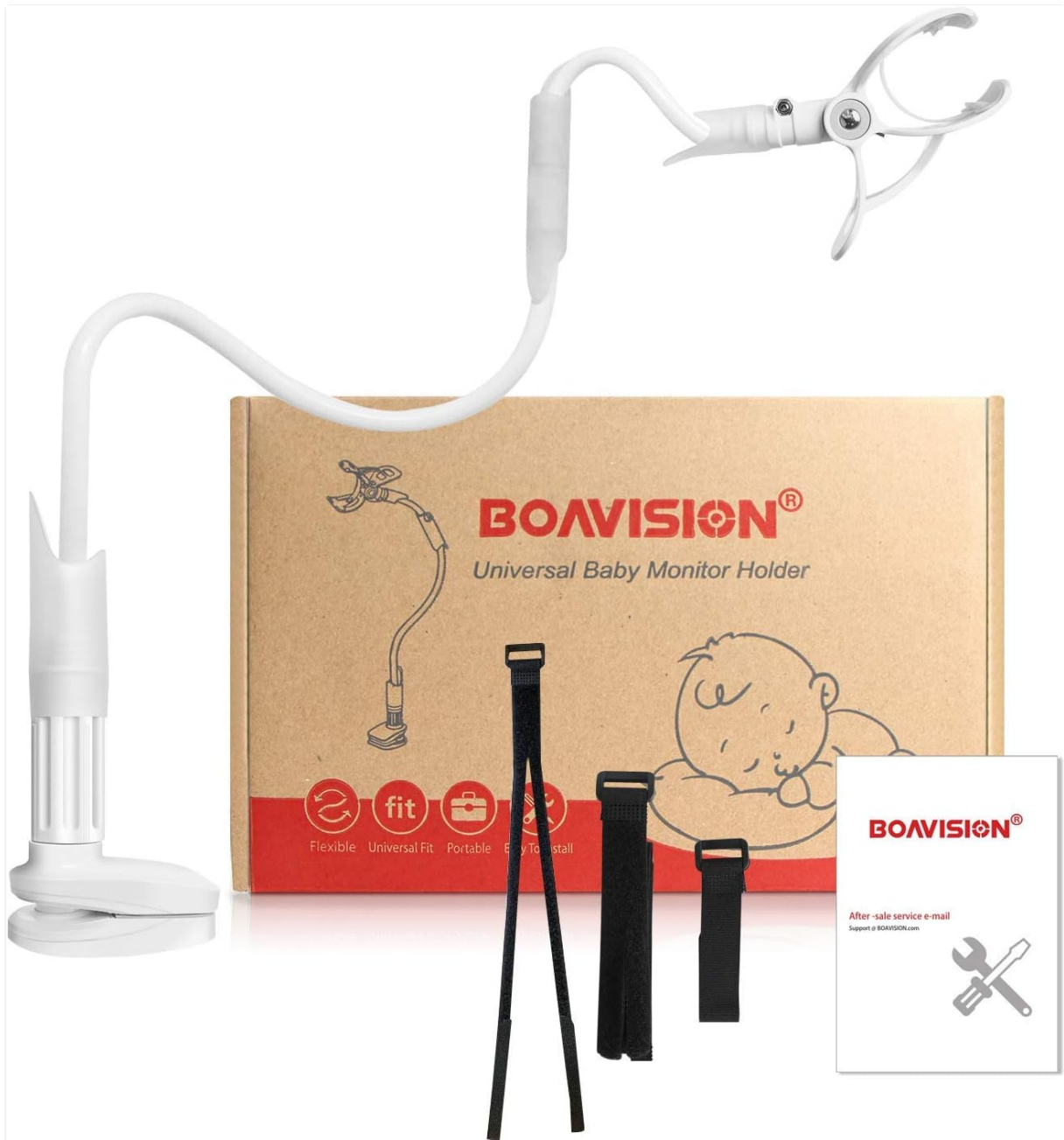
Image: The product packaging for the BOAVISION X5 Universal Baby Monitor Holder, showing the mount, straps, and a welcome guide manual.