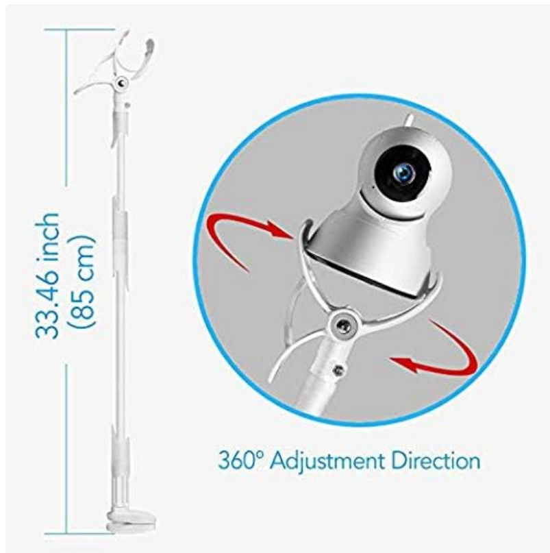
Image: A diagram illustrating the 33.46-inch length of the flexible arm and the 360-degree adjustment capability of the camera clip.