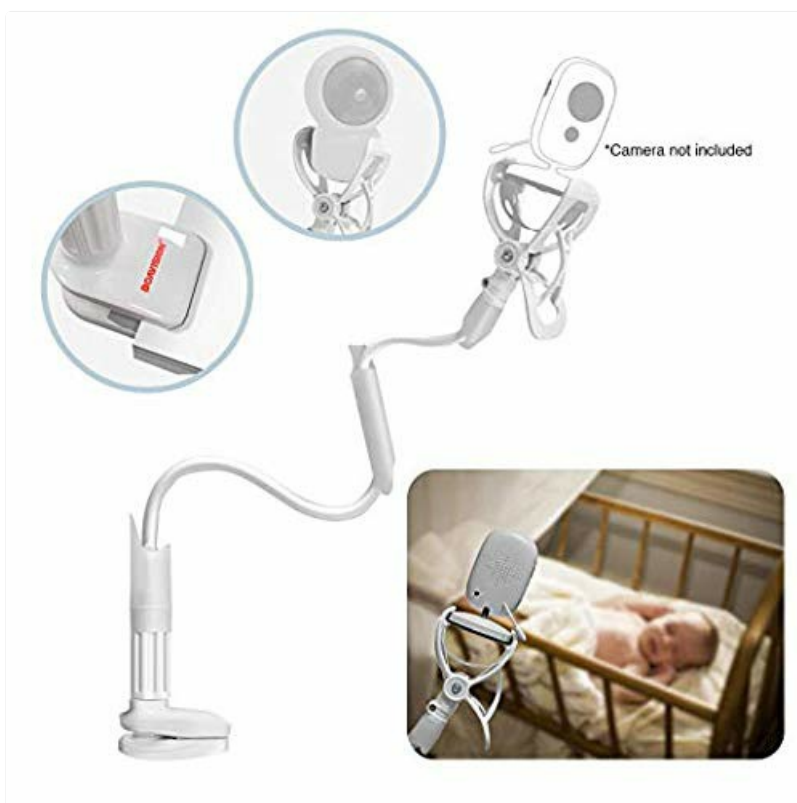
Image: The BOAVISION X5 Universal Baby Monitor Mount positioned near a baby, demonstrating its use for monitoring.

The BOAVISION X5 Universal Baby Monitor Mount provides a flexible and adjustable solution for positioning your baby monitor or infant camera. This mount is designed for compatibility with most nanny cameras, infant cameras, and WiFi IP cameras, offering a 360-degree adjustable stand to achieve optimal viewing angles. Its versatile design allows for easy installation on various surfaces without the need for drilling or wall adhesives.