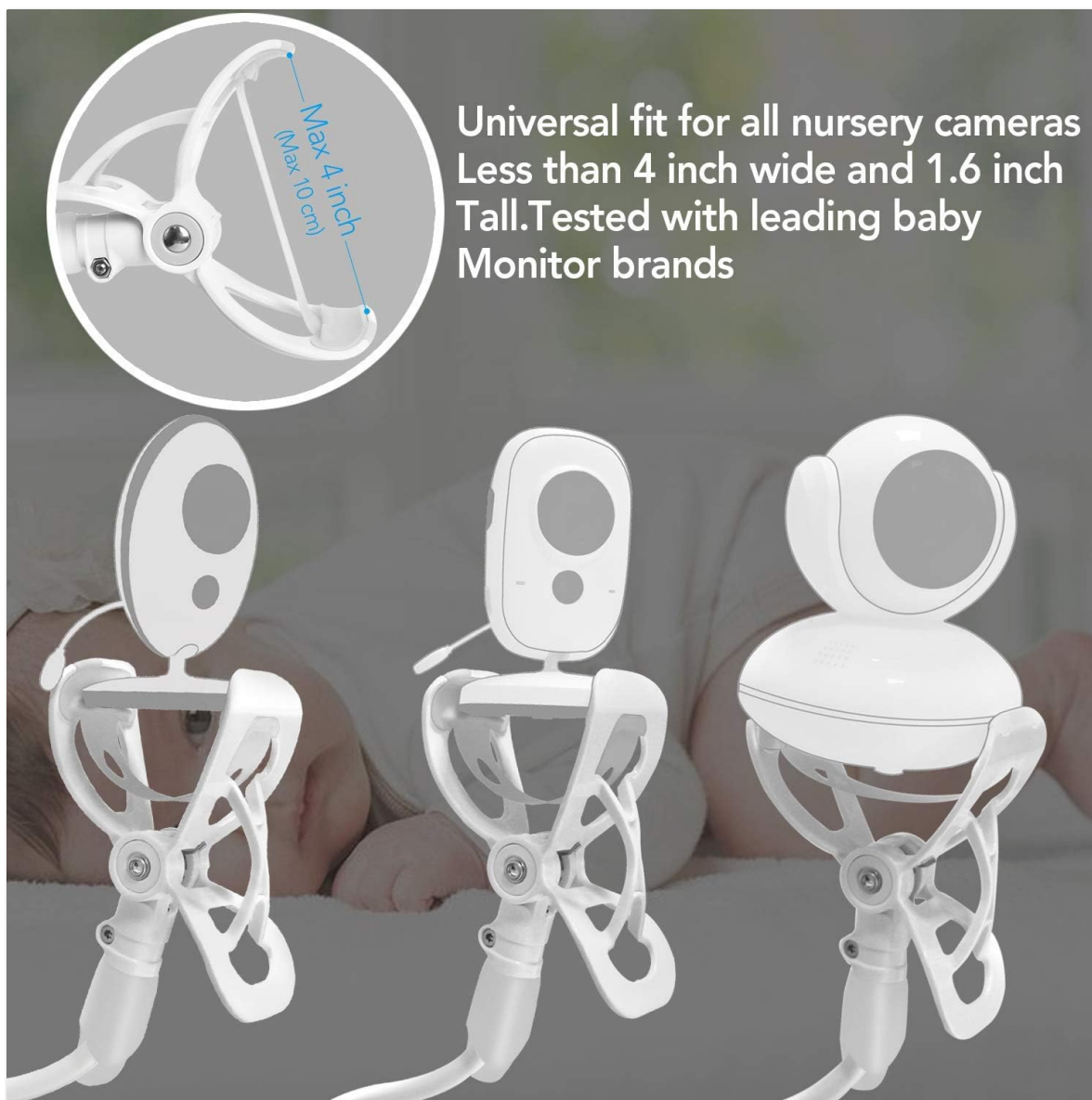
Image: Multiple mounts displaying their universal fit for various baby monitor models, highlighting the maximum 4-inch width capacity.

into the clip, ensuring it is centered and held securely. The clip is designed to accommodate cameras up to 4 inches (10 cm) wide and 1.6 inches tall.