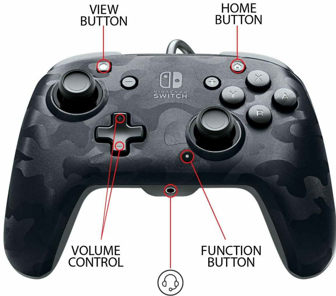
Image: Detailed view of the controller with key buttons labeled for easy identification.