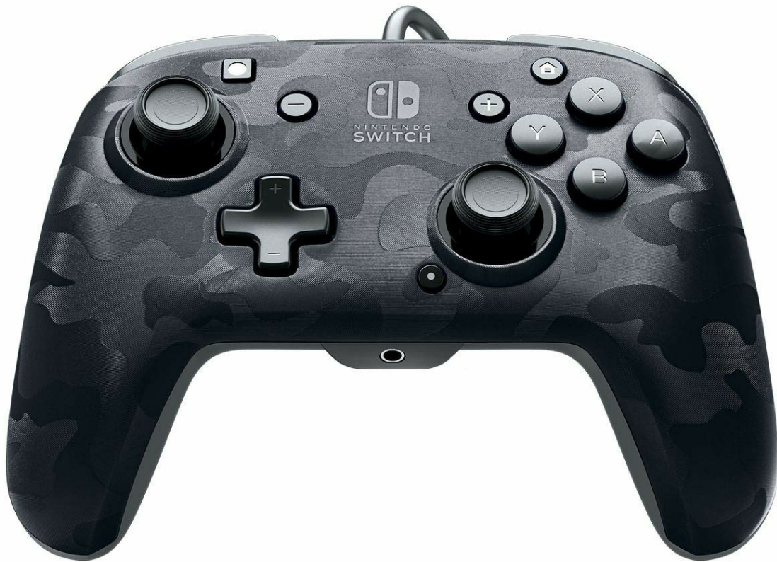
Image: Front view of the PDP Gaming Faceoff Deluxe+ Audio Wired Controller in Black Camo.