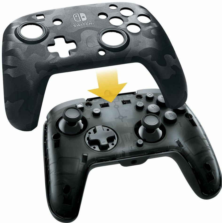
Interchangeable faceplate design

Image: Illustration demonstrating the interchangeable faceplate design of the controller.