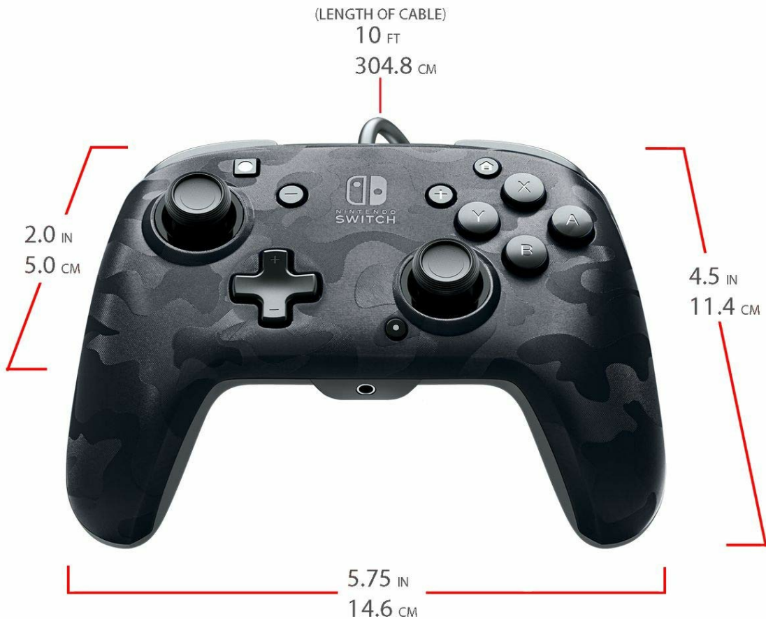
Image: Controller dimensions for reference.

Your browser does not support the video tag.