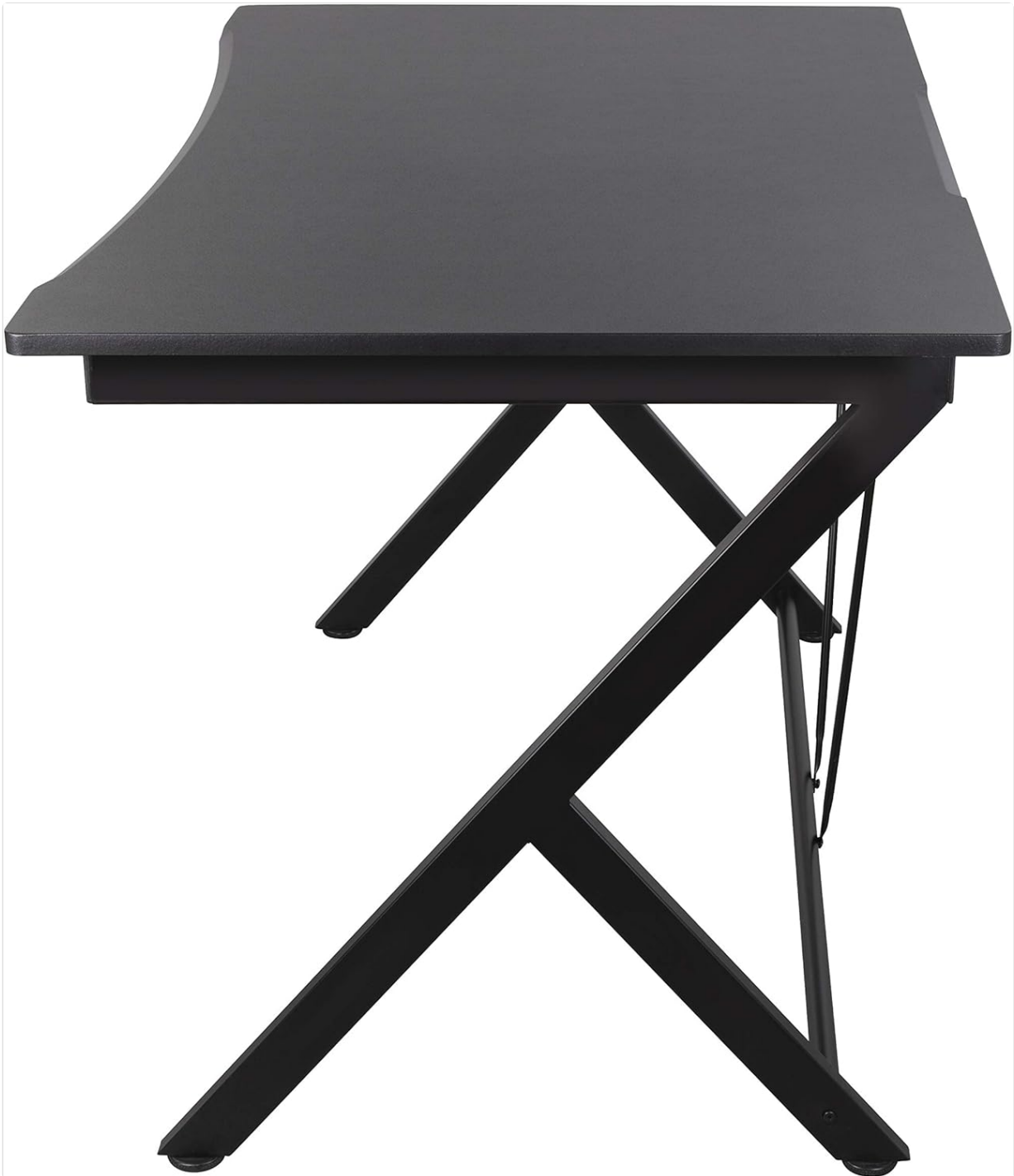
Figure 3: Back view of the DELTACO GAMING Desk GAM-055, showing the rear support bars for enhanced stability.