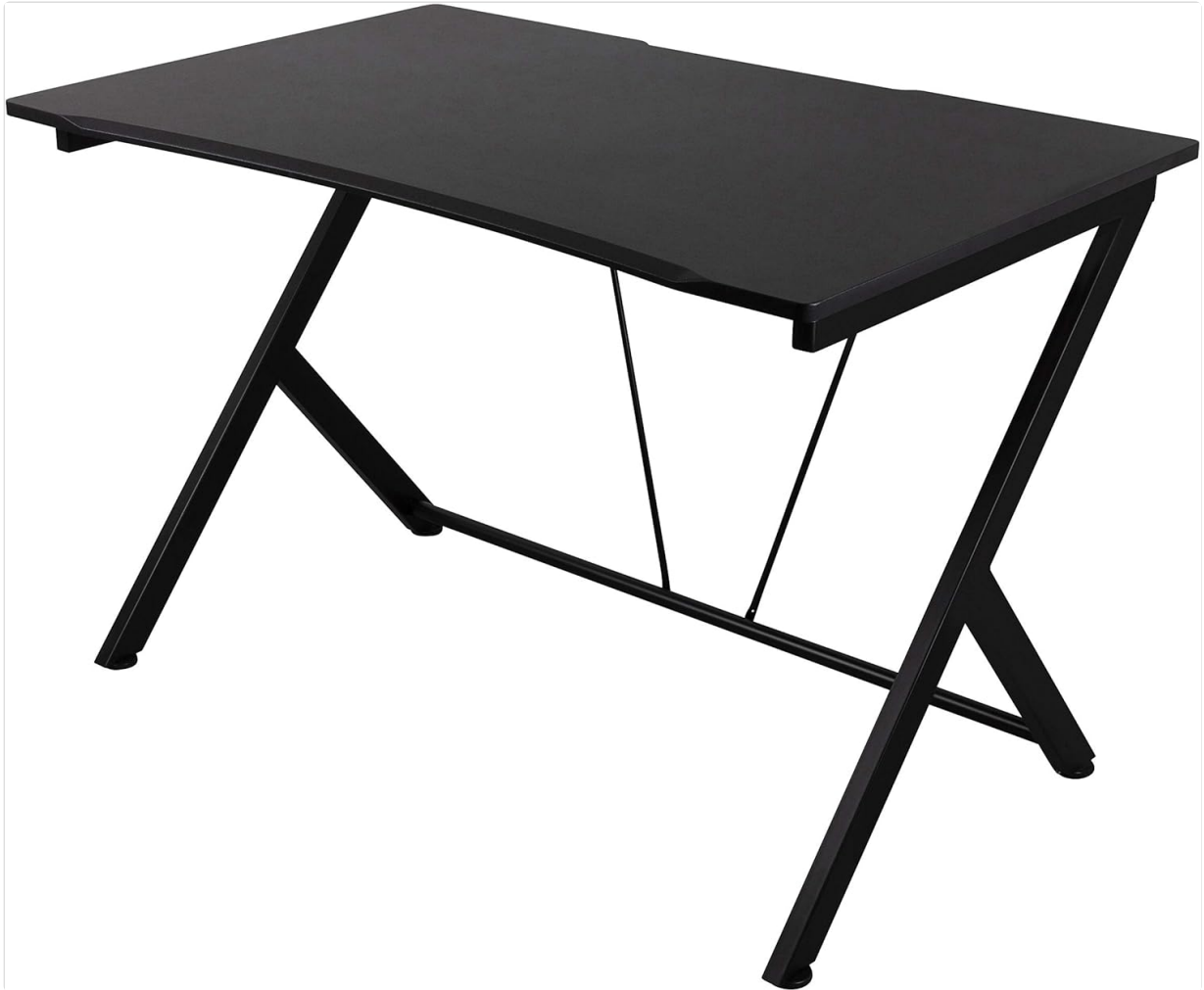
Figure 1: Front view of the assembled DELTACO GAMING Desk GAM-055. This image shows the overall structure and design of the desk from the front.