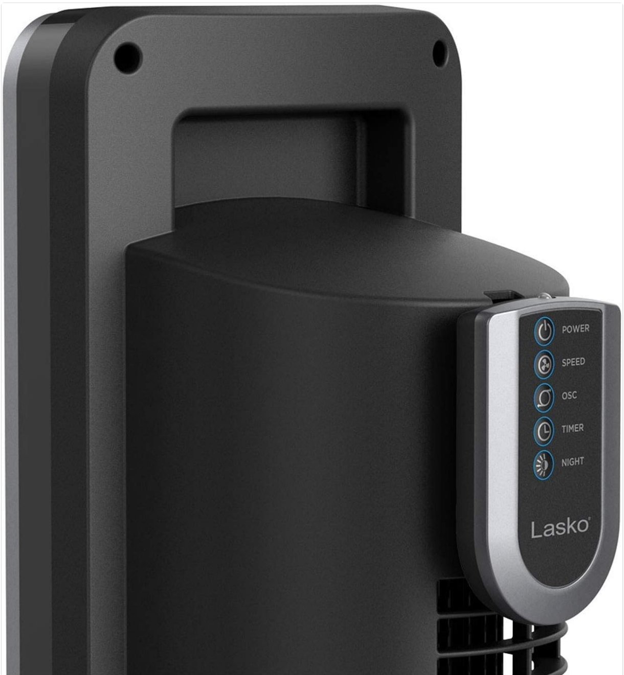
Image: Back view of the Lasko T48322 Tower Fan, highlighting the integrated handle and the remote control storage slot.