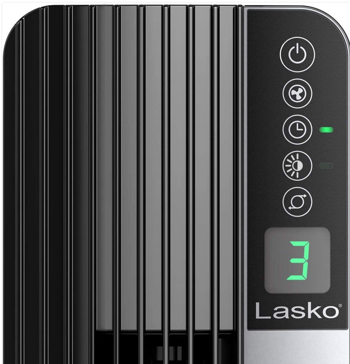
Image: Close-up of the Lasko T48322 Tower Fan's control panel, showing the power, speed, timer, oscillation, and nighttime mode buttons, along with the digital speed display.