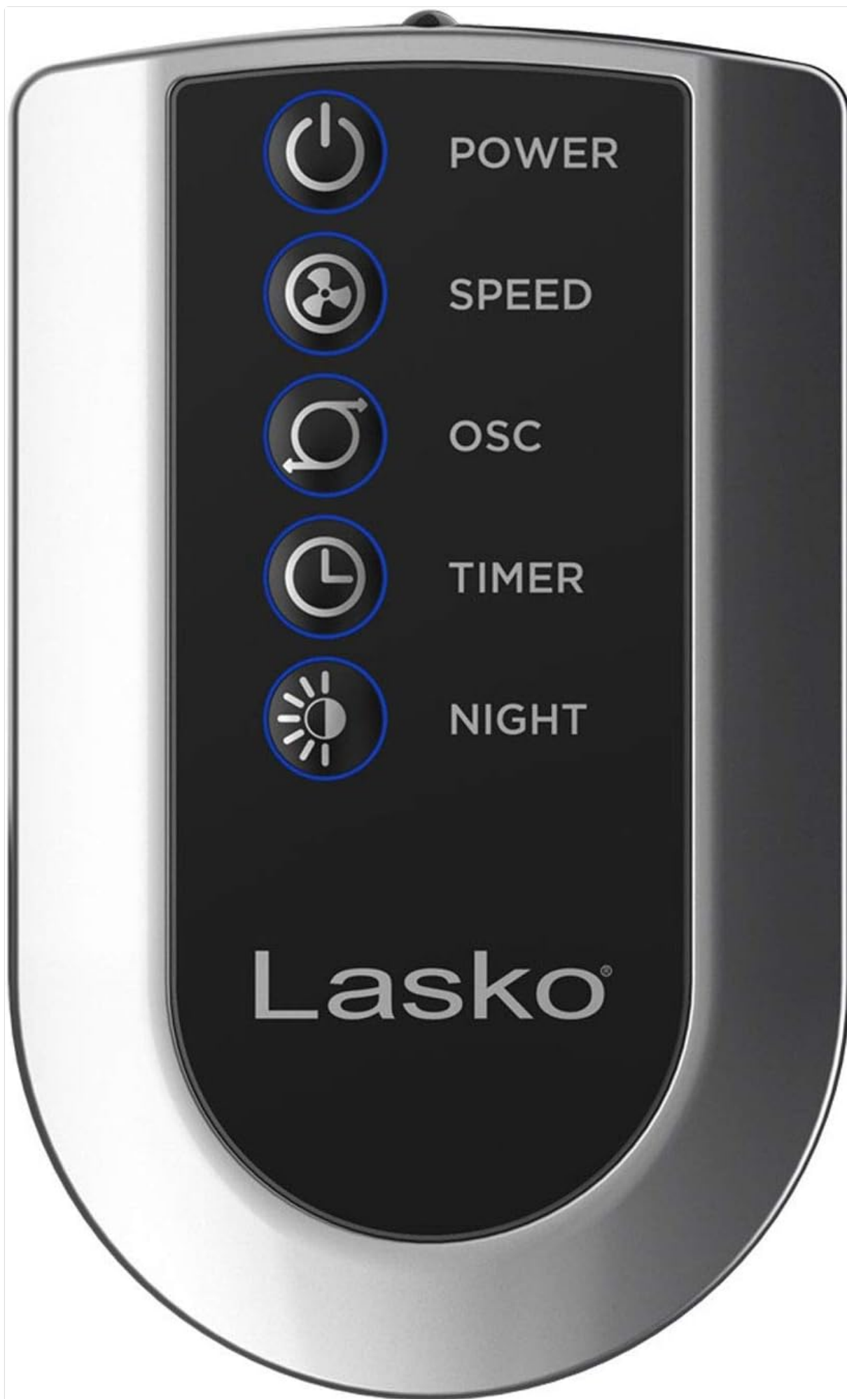
Image: The remote control for the Lasko T48322 Tower Fan, showing buttons for power, speed, oscillation, timer, and nighttime mode.