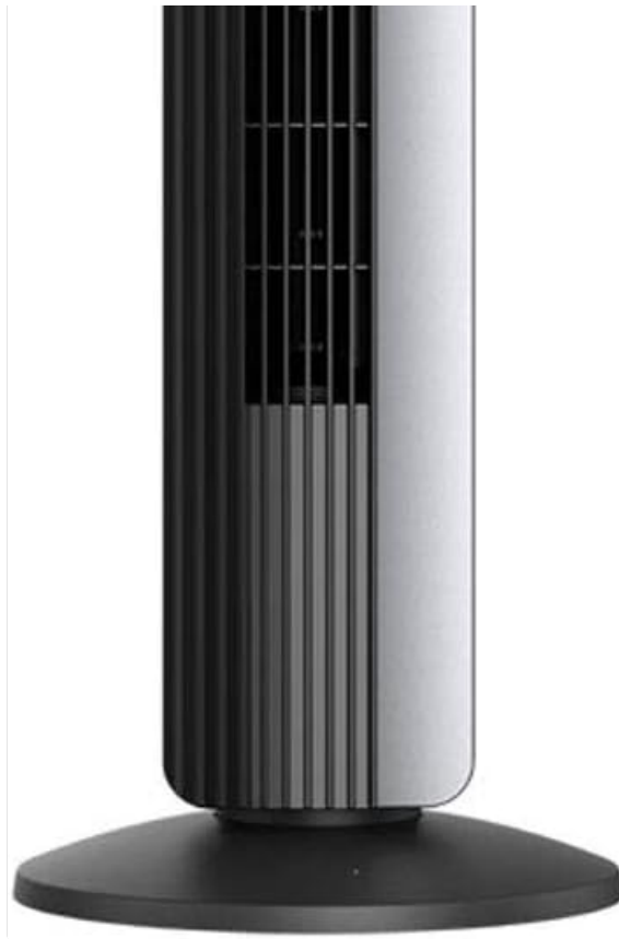
Image: Front view of the Lasko T48322 Tower Fan. This image shows the fan's slim, upright design with its black and silver finish, and the digital display panel at the top.