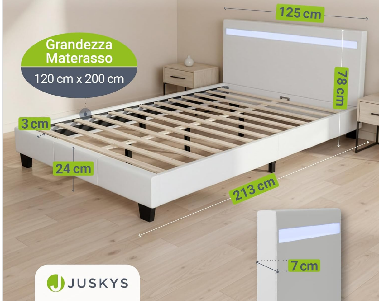
Figure 1: Optimal Dimensions. This image illustrates the overall dimensions of the Juskys Paris upholstered bed, including its length, width, headboard height, and bed frame height, along with the recommended mattress size of 120x200 cm.