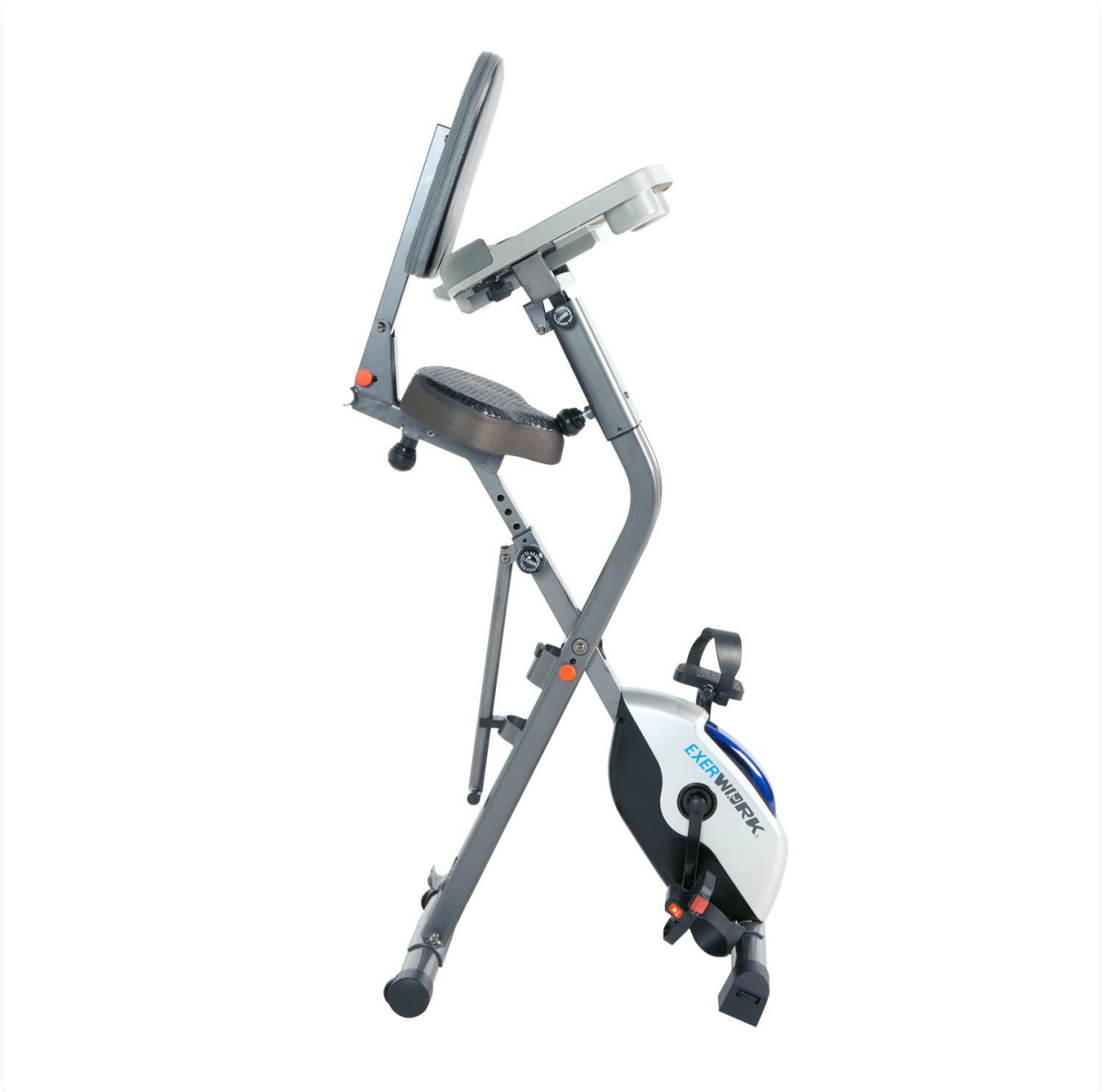
Figure 4: The desk bike in its folded configuration for convenient storage.

The bike is designed for easy folding and can be relocated using the built-in transportation wheels. To fold, follow the instructions in the owner's manual to collapse the frame. Folded dimensions are approximately 30"L x 25"W x 61.5"H.