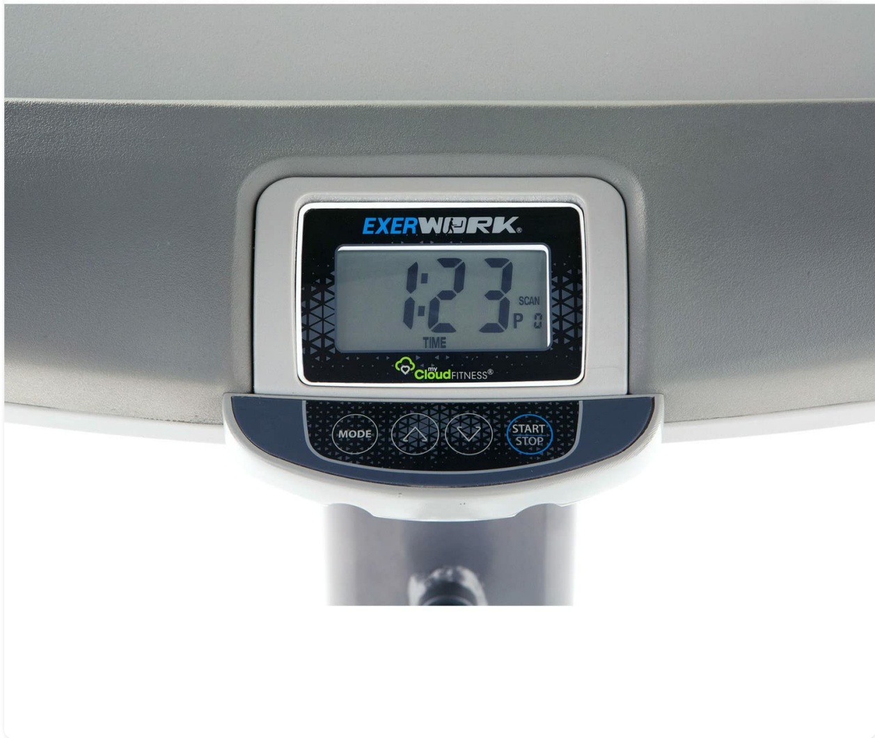
Figure 5: The LCD display provides real-time workout data.