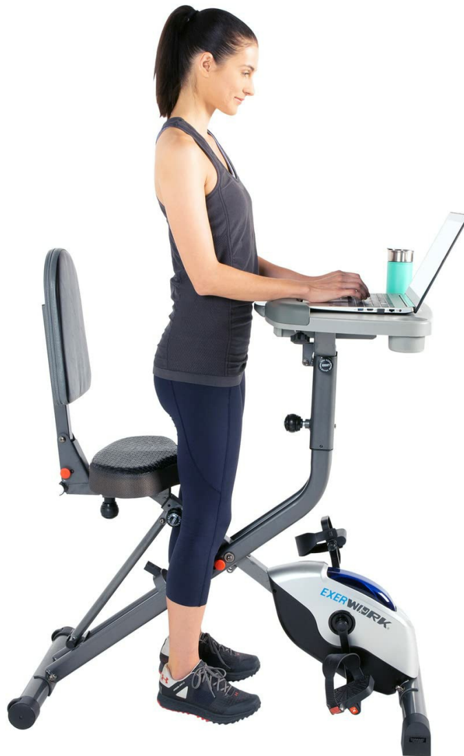
Figure 3: The desk bike can be used in both sitting and standing positions.