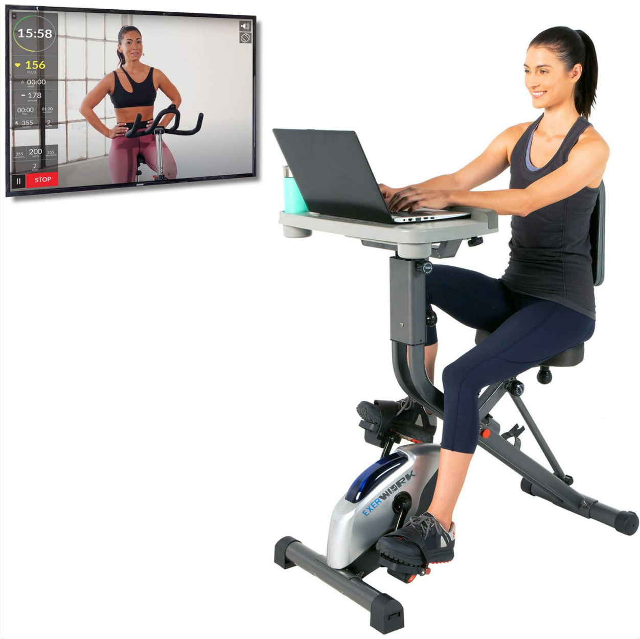
Figure 1: Overview of the EXERPEUTIC EXERWORK 2000i in use, highlighting key features.