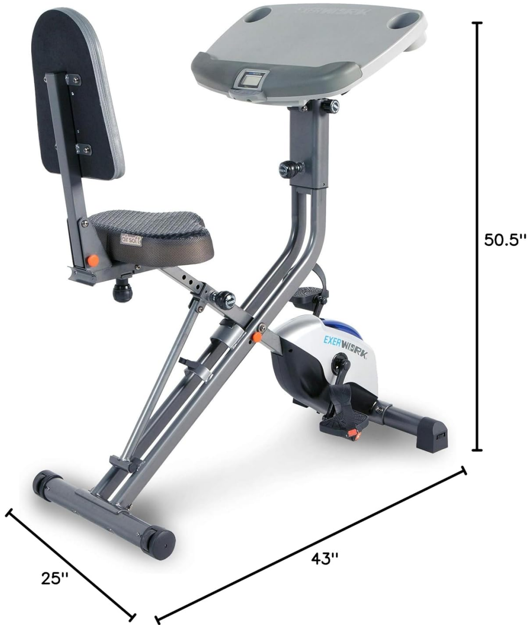
Figure 7: Product dimensions for planning space and usage.