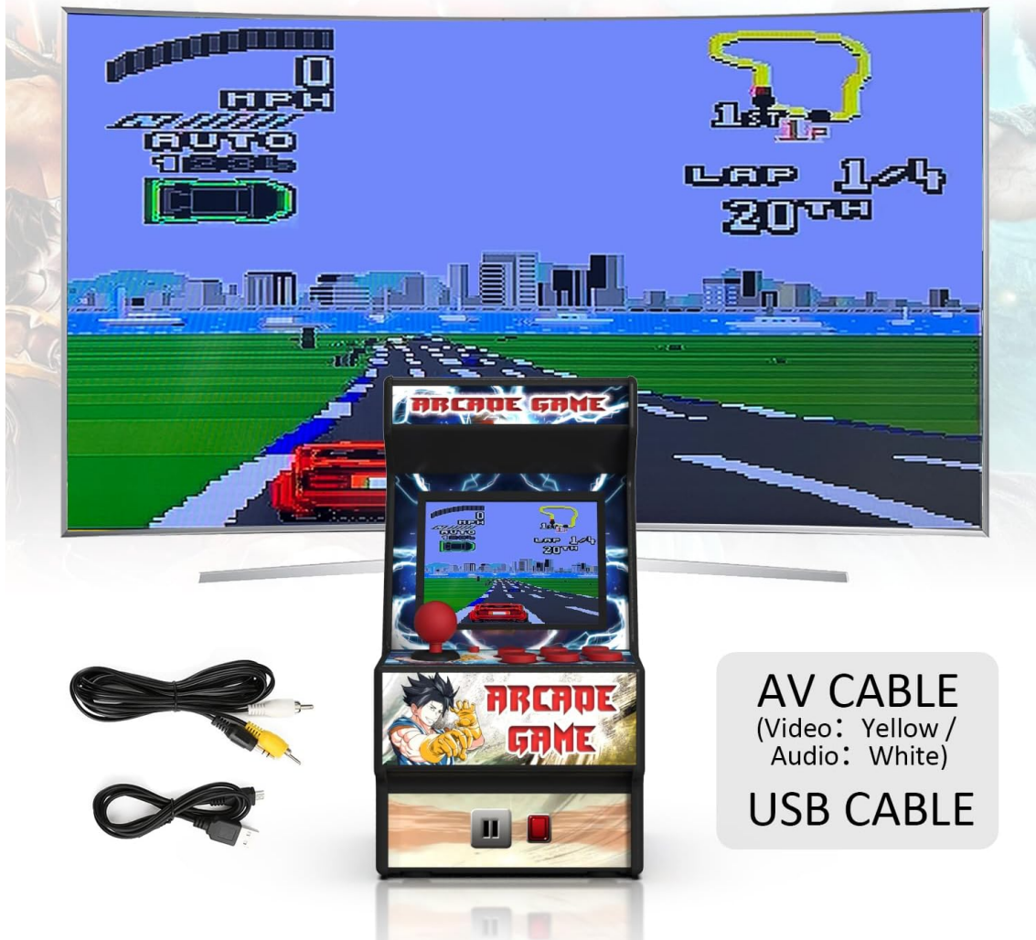
Figure 3: The Mini Arcade Machine connected to a TV for full-screen gaming.

TV Connection Available. Enjoy FULL-SCREEN Gaming