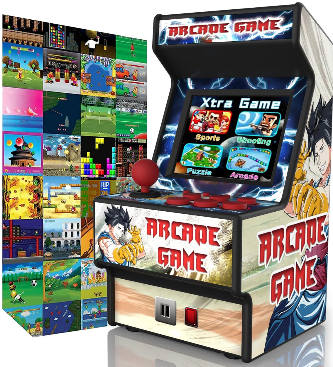
Figure 5: The game selection interface with a preview of available games.