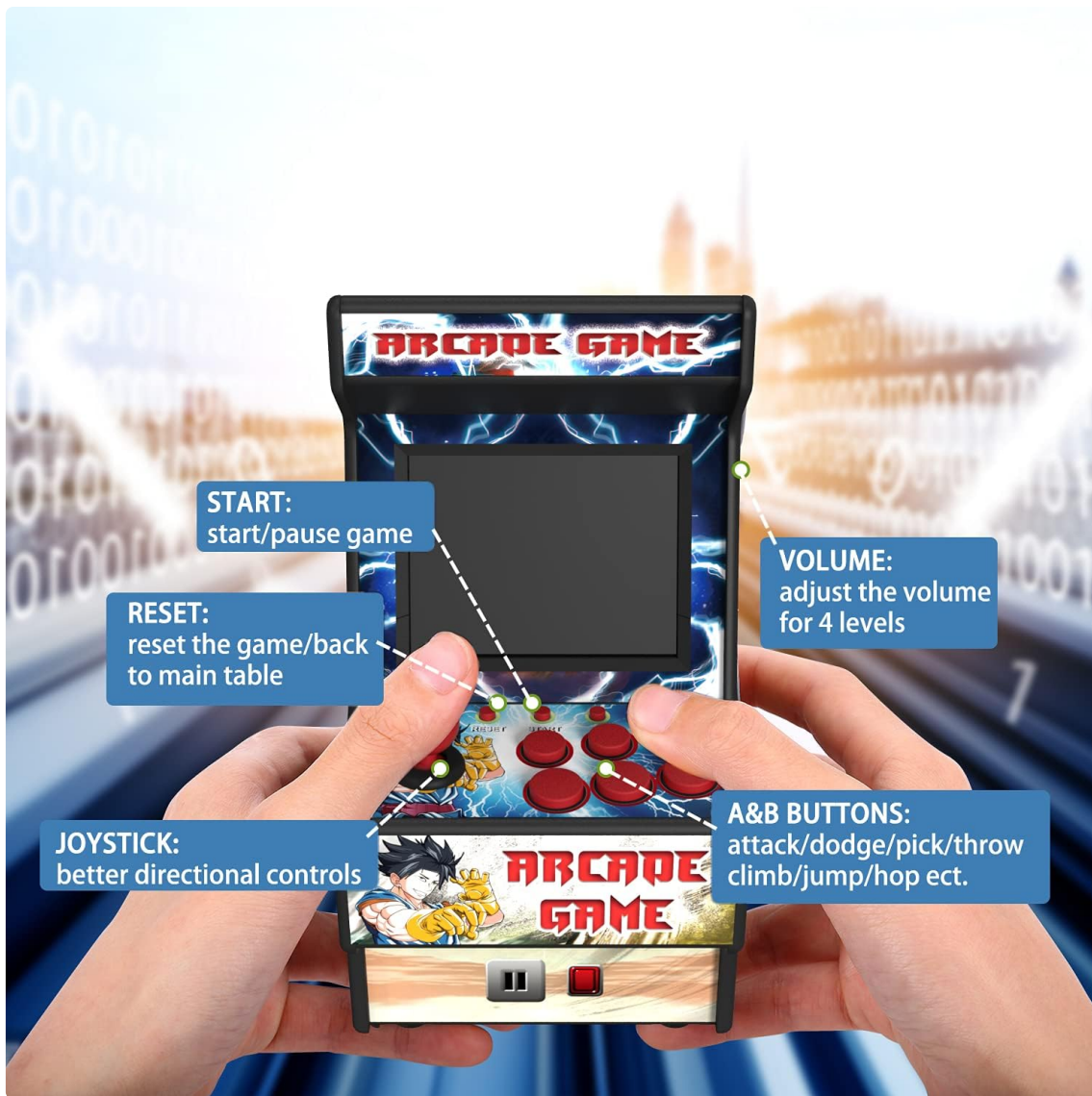
Figure 4: Detailed view of the console's control layout.