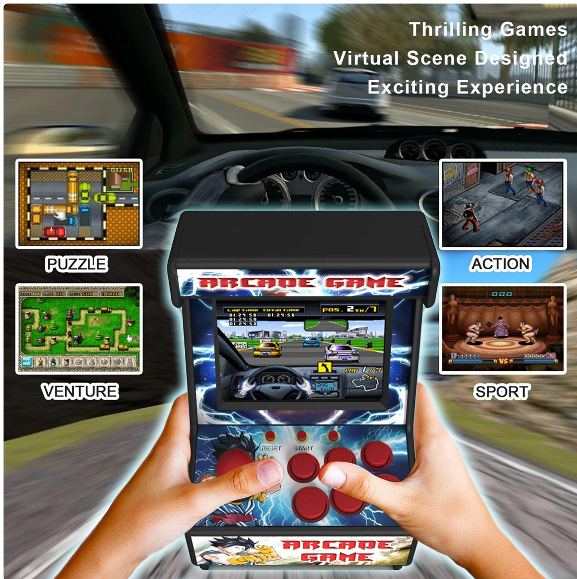
Figure 1: The Mini Arcade Machine showcasing different game categories.