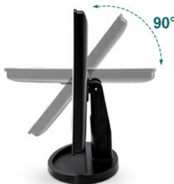
Image: A side view of the mirror demonstrating its 90-degree vertical rotation capability.

The mirror panel can be rotated 180 degrees vertically. Gently tilt the mirror to find the most comfortable and effective viewing angle for your needs.