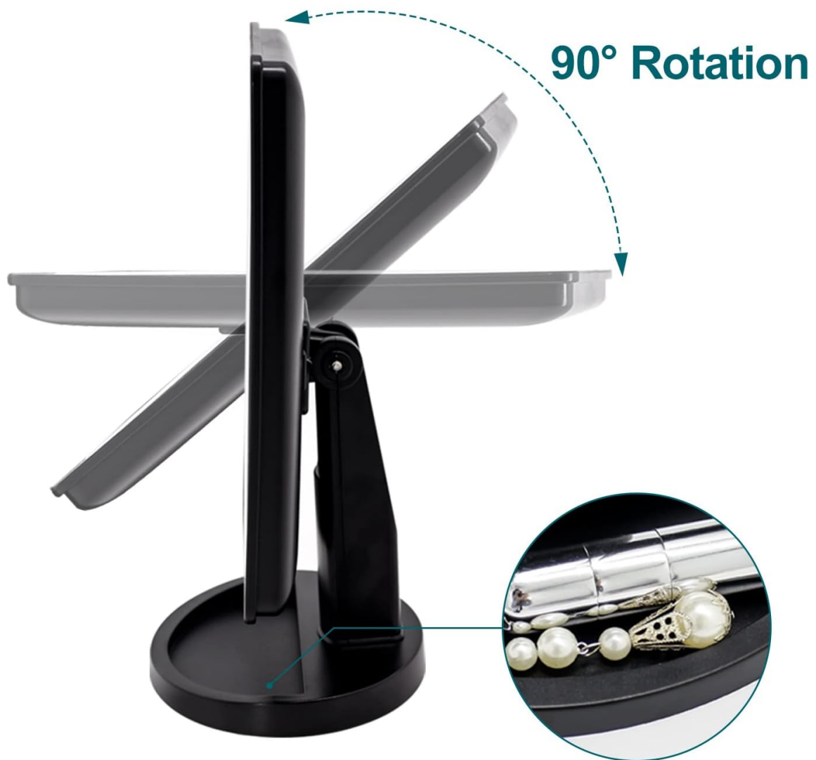
Image: The mirror rotating 90 degrees, highlighting its adjustable angle and the integrated storage tray at the base.