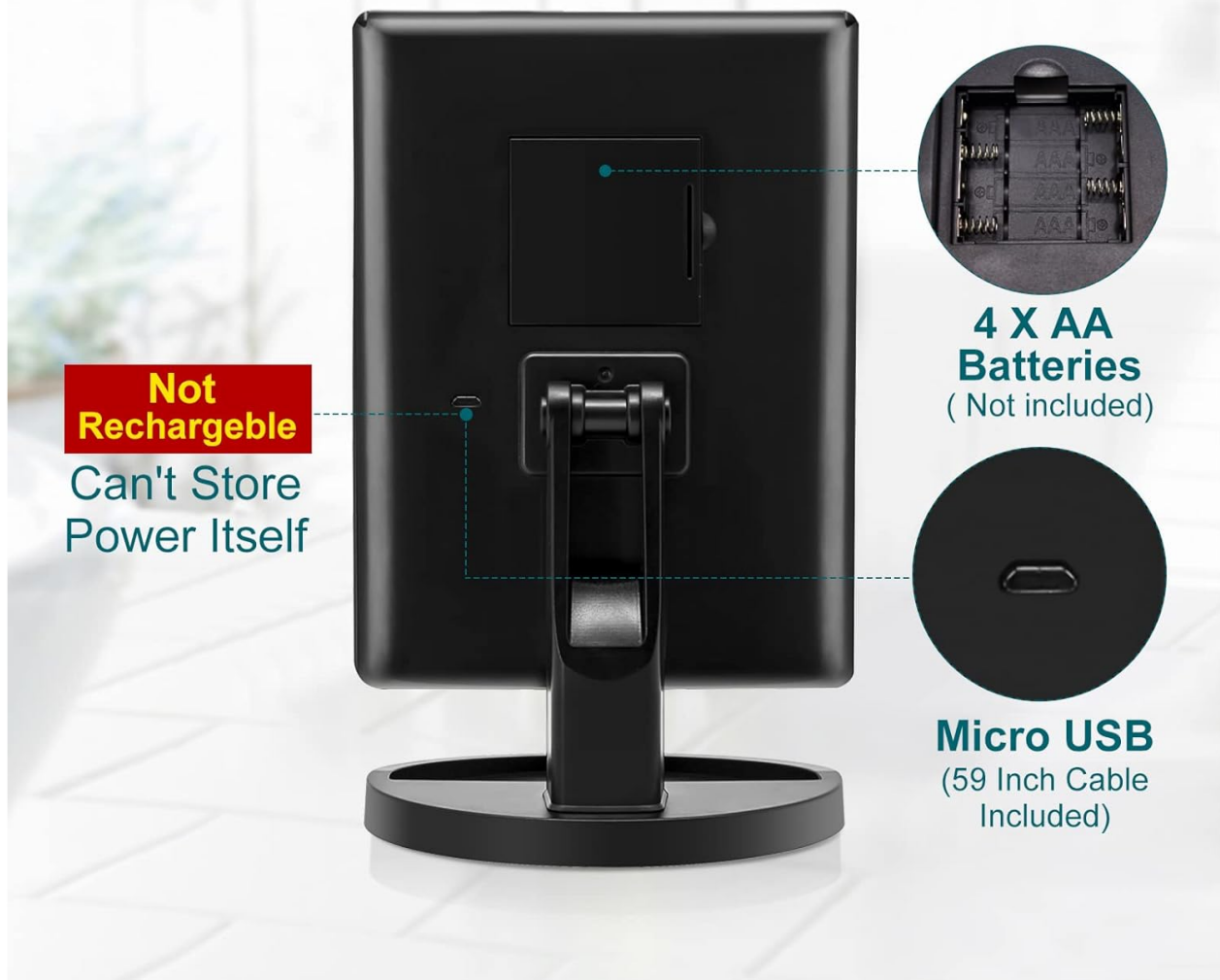
Image: A diagram illustrating the dual power supply options for the mirror, showing the battery compartment and the micro USB port.