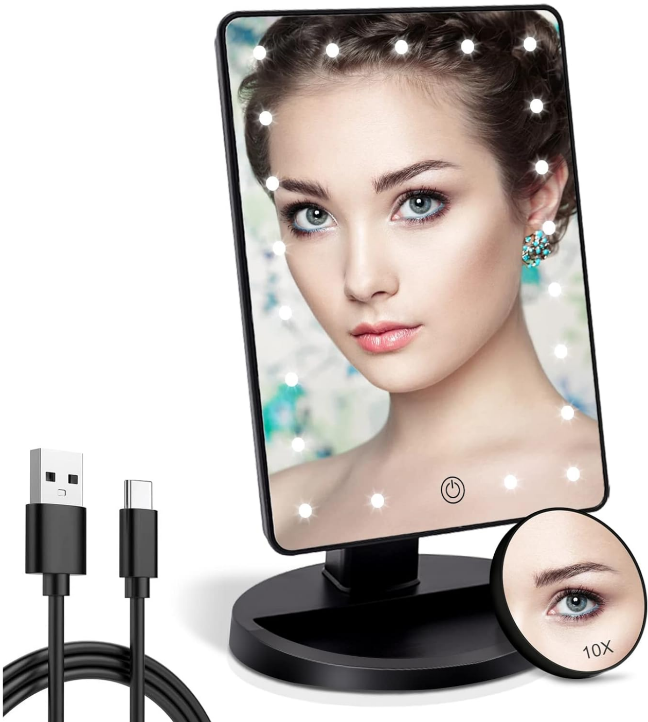
Image: The COSMIRROR Lighted Makeup Vanity Mirror, showcasing its sleek design, integrated LED lights, and included USB cable and detachable 10X magnifying mirror.