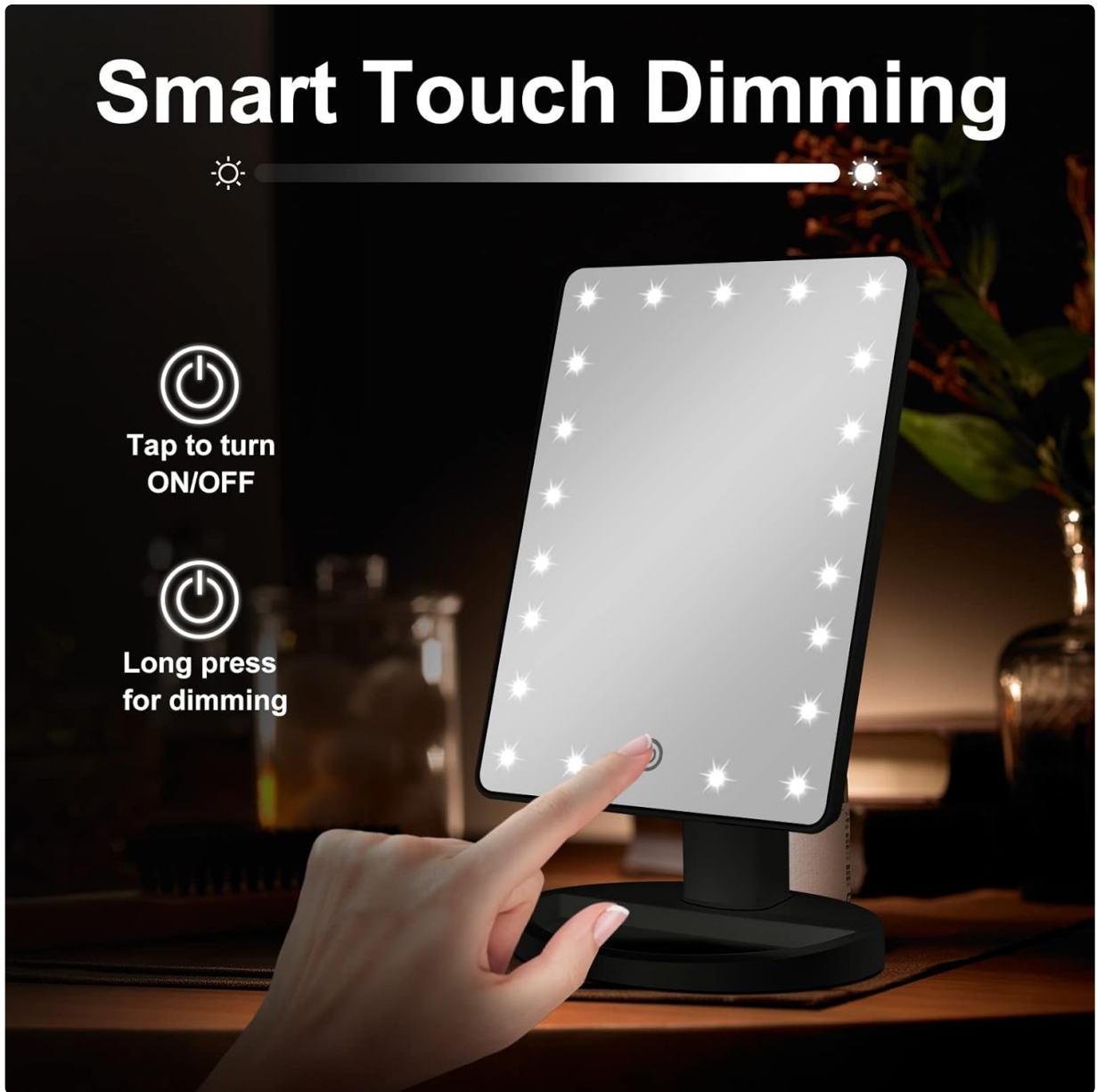
Image: A hand touching the smart sensor button on the mirror to demonstrate the dimming function.