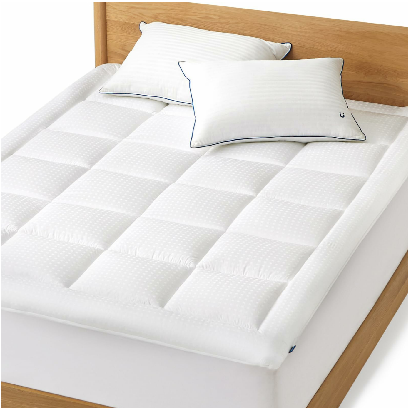
Image: Bedsure Queen Size Mattress Pad, showcasing its quilted design and fitted style on a bed.