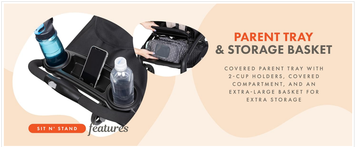
Image: A close-up view of the parent tray, showing its two cup holders and covered compartment, alongside a depiction of the spacious under-seat storage basket, designed for convenience and extra capacity.