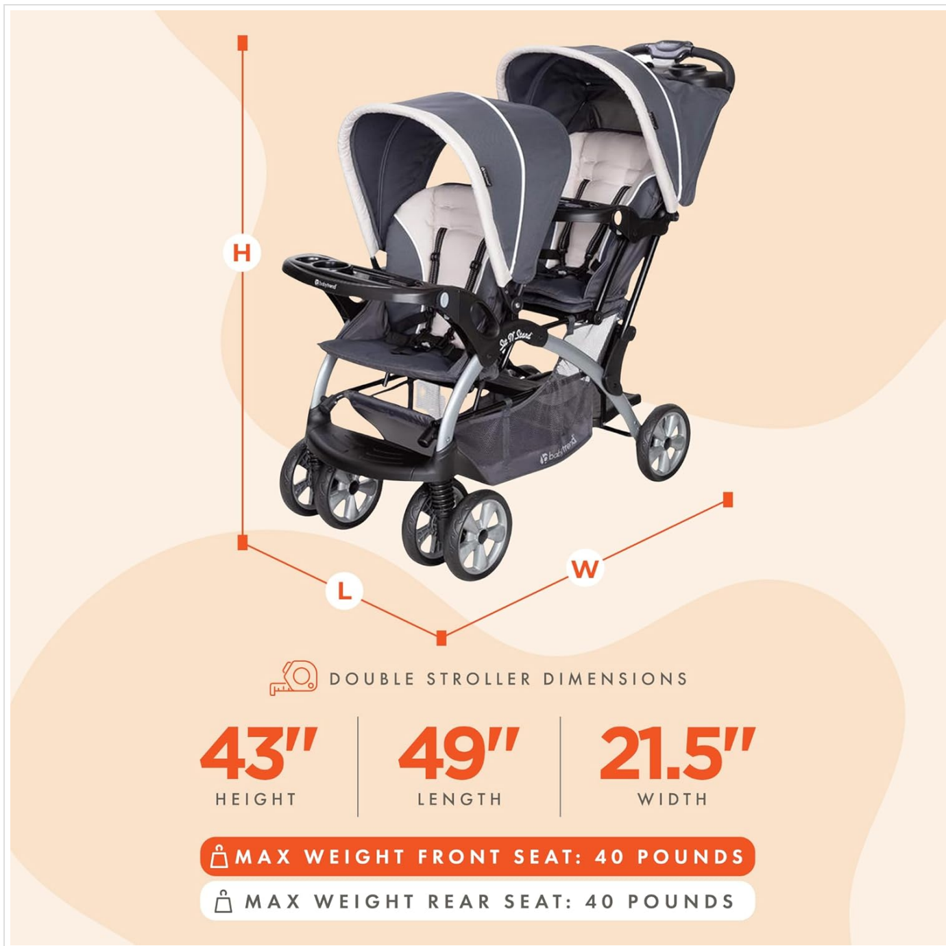
Image: A diagram illustrating the key dimensions of the Baby Trend Sit N' Stand Double Stroller, including its height, length, and width, along with the maximum weight capacity for each seat.