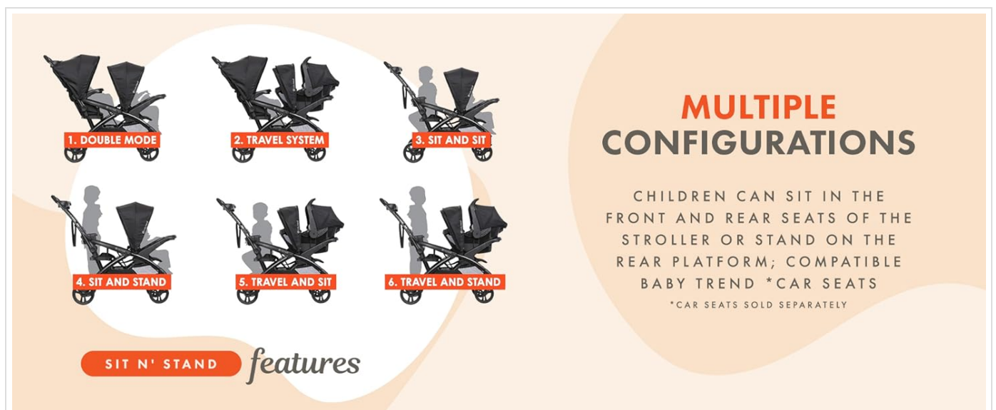
Image: A visual guide illustrating the six different configurations of the Sit N' Stand Double Stroller, including options for two seated children, one seated and one standing, and combinations with infant car seats.