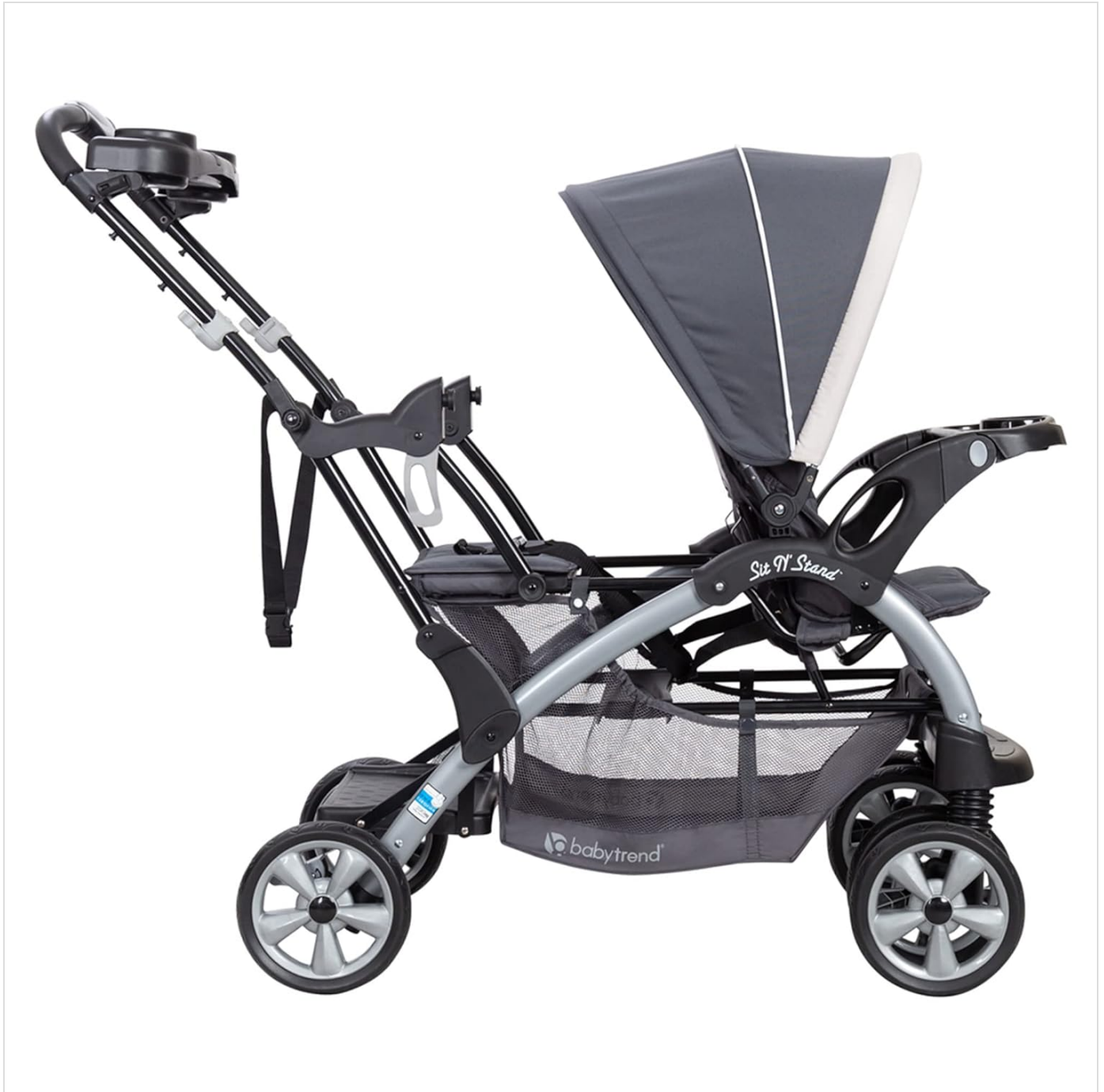
Image: A side view of the assembled Baby Trend Sit N' Stand Double Stroller, showing both the front and rear seats with their canopies and child trays in place. This view highlights the stroller's full configuration.