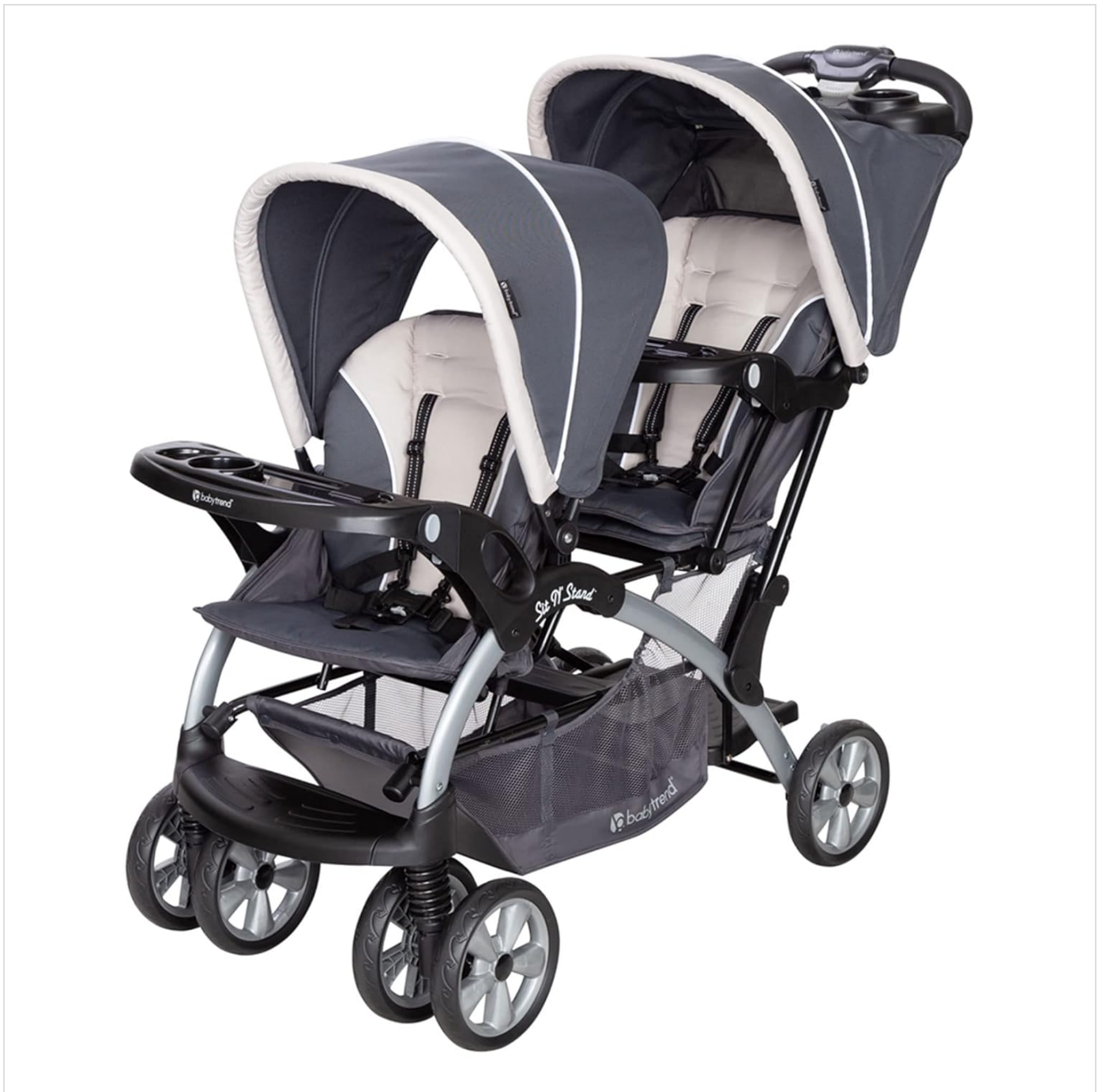
Image: The Baby Trend Sit N' Stand Double Stroller, showcasing its tandem design with two seats and canopies. This stroller is designed for two children, offering both seating and standing options.