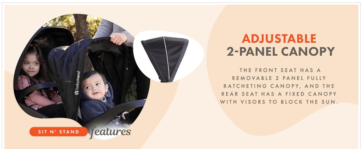
Image: This graphic illustrates the adjustable 2-panel canopy, demonstrating its ability to provide shade and protection for the child in the front seat, with a fixed canopy for the rear seat.

The front seat has a removable, fully ratcheting 2-panel canopy. The rear seat has a fixed canopy with visors. Adjust the canopies as needed to provide maximum sun protection for your children.