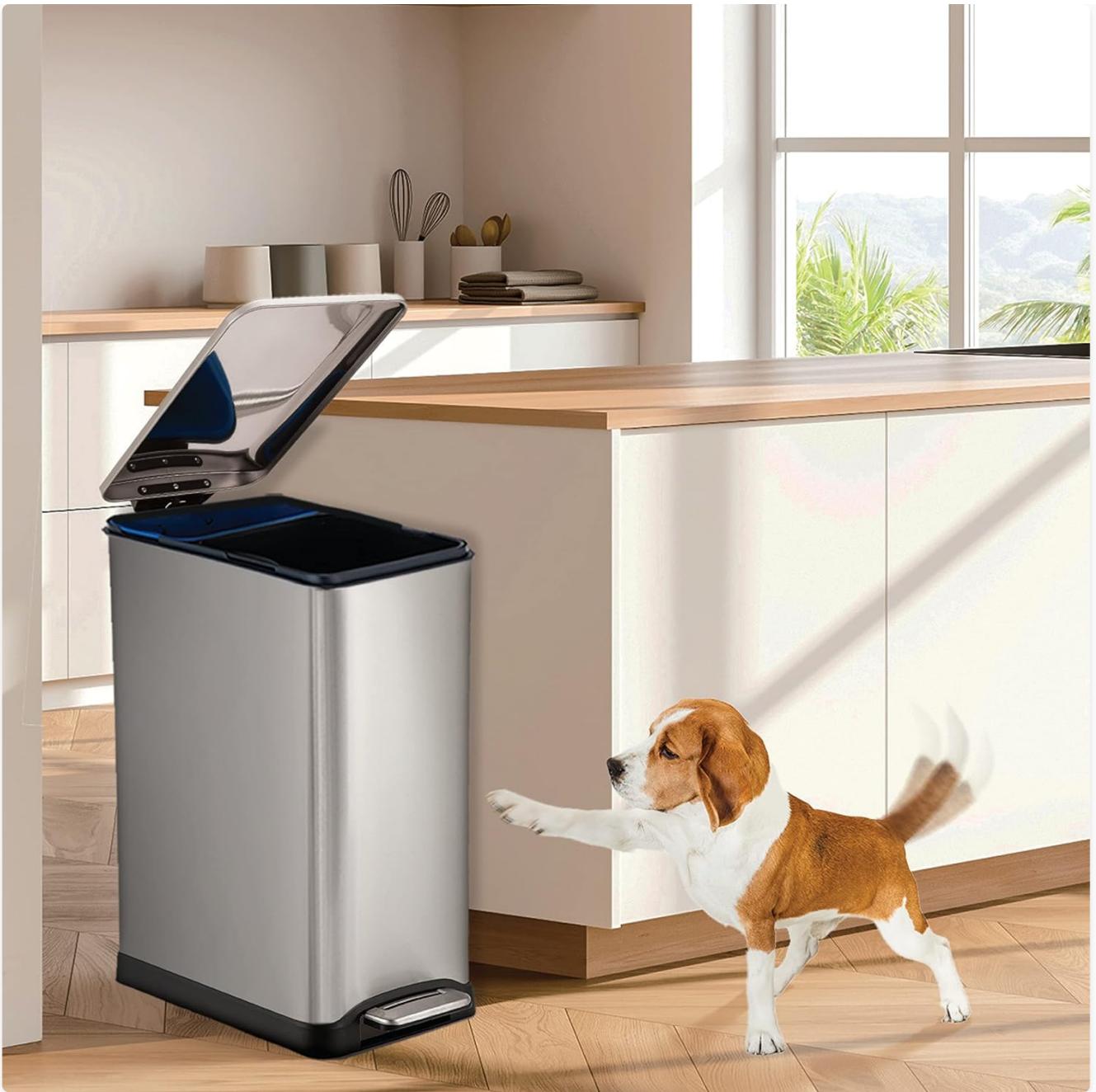
Image: The trash can positioned in a kitchen, demonstrating its slim profile and aesthetic integration.