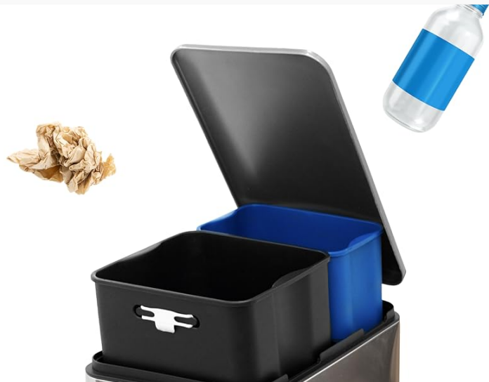
Image: The lid in various stages of closing, highlighting the soft-close function.

Make securing your bags in place easier simply by tucking the excess slack underneath the rubber band included on each bin. No more tying down bags,