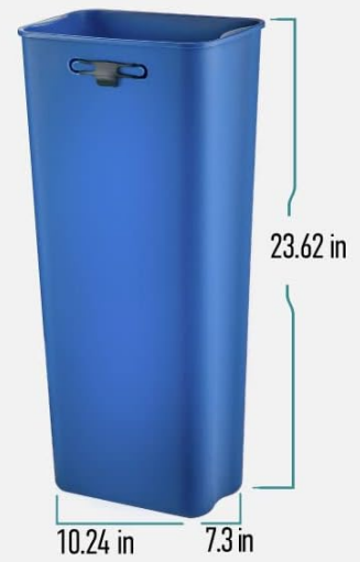
Image: Technical drawing with precise measurements of the trash can and its internal bins.