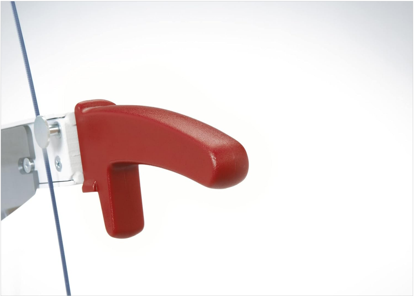
Figure 3.3: Detail of the transparent safety guard and its handle, designed to protect the user from the blade.