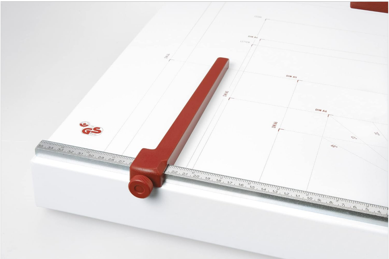
Figure 3.1: Overview of the IDEAL 1158 Guillotine Paper Trimmer. Shows the full trimmer with the cutting board, blade, and handles.