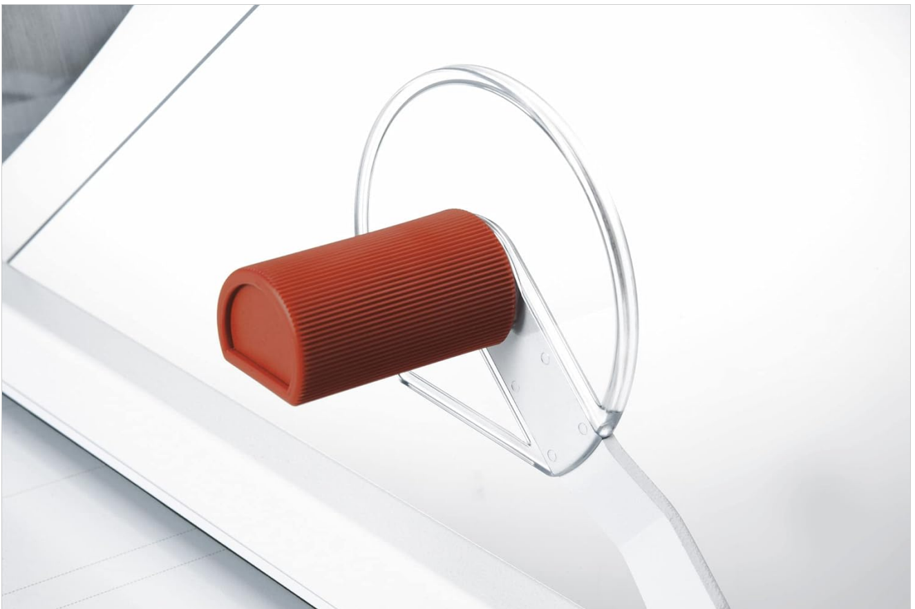
Figure 3.4: The manual hand clamping device, used to secure paper firmly in place before cutting.