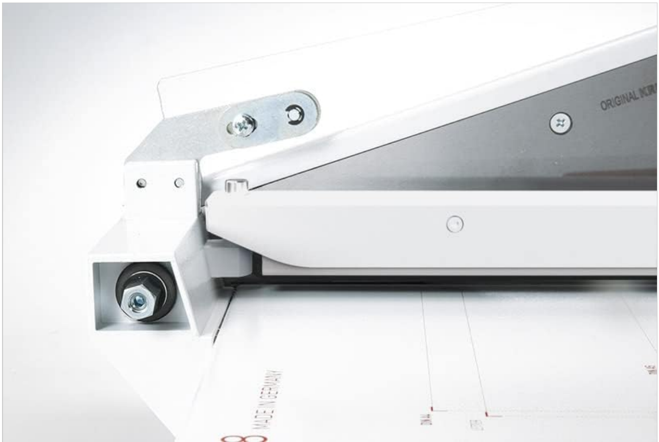
Figure 3.5: Close-up view of the blade mechanism, showing the pivot point and the robust construction.