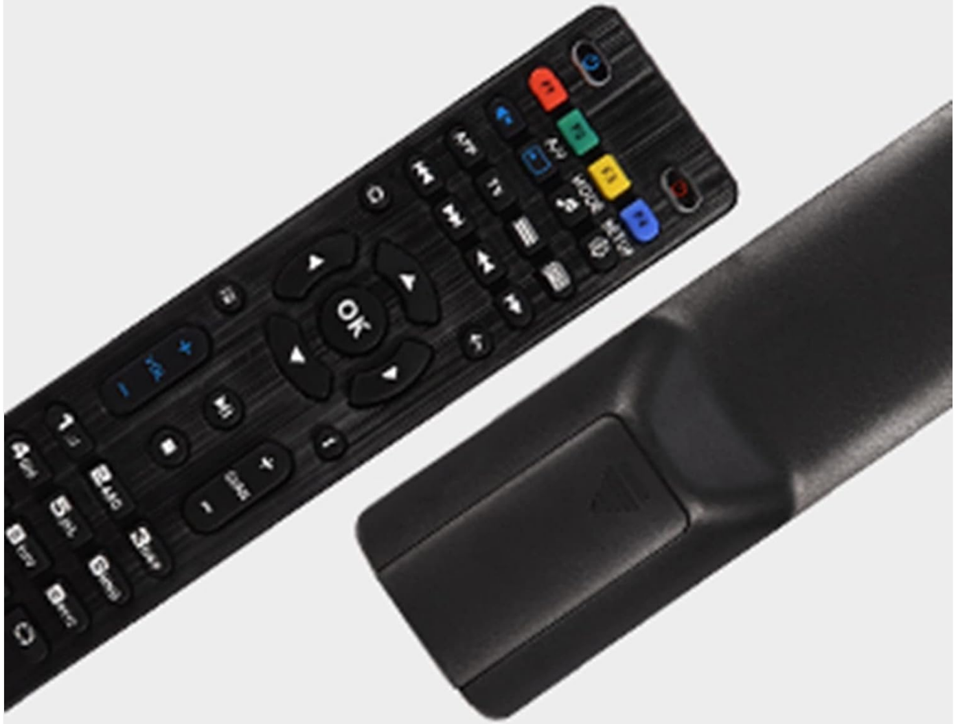
Figure 5: The remote control's durable ABS material, designed for longevity and resistance to minor impacts.

ABS environmentally friendly raw materials are durable and fall resistant