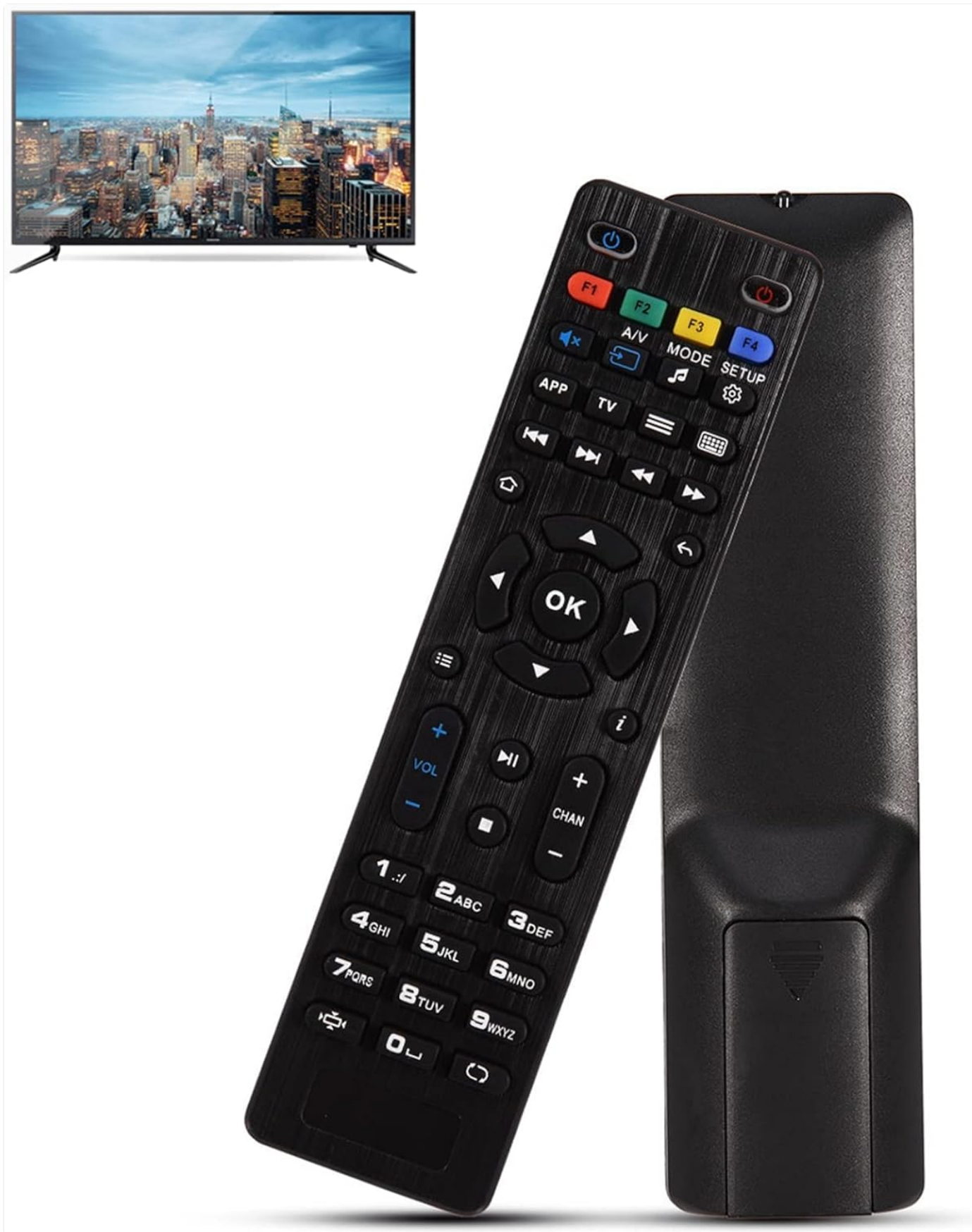
Figure 1: The Tihebeyan Replacement Remote Control, shown with a compatible TV and TV box.