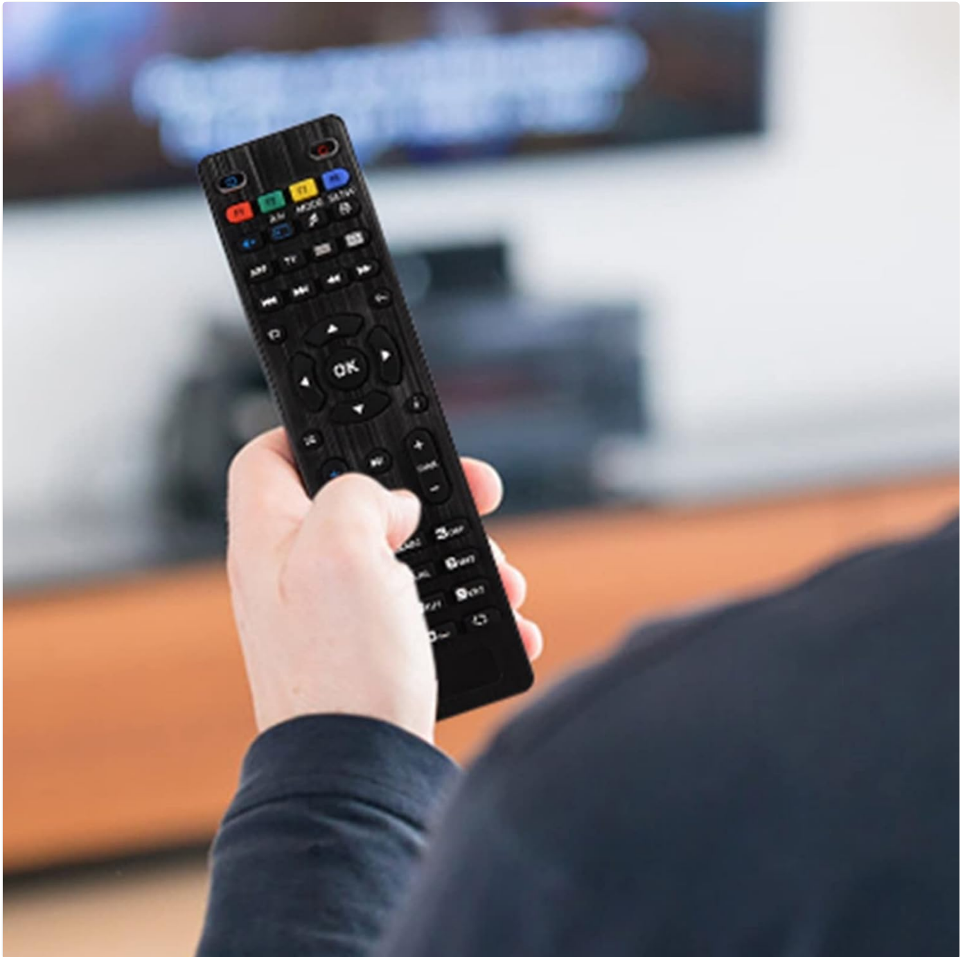
Figure 3: A user operating the remote control while viewing a television screen.