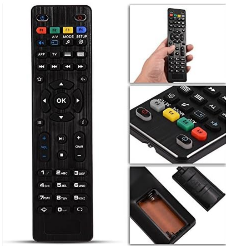
Figure 2: Close-up view showing the battery compartment and various buttons on the remote control.

The remote control is ready for use immediately after battery installation. No programming is required for compatible MAG IPTV TV Box models.