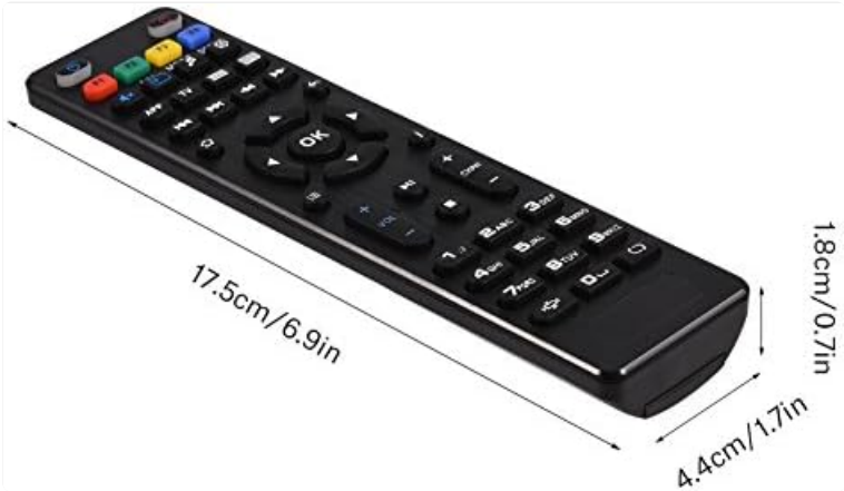
Figure 6: Dimensions of the Tihebeyan Replacement Remote Control.

Information regarding specific warranty terms and customer support for this product is not available in the provided documentation. For any issues or inquiries, please refer to the retailer or point of purchase for assistance.