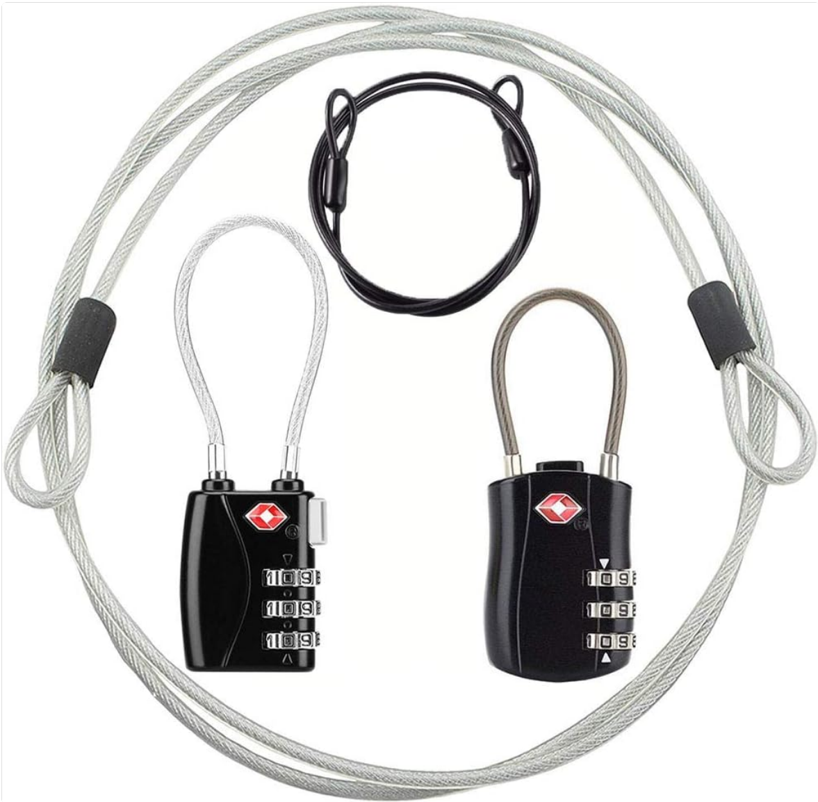
Image: Two YSSHUI TSA combination locks, one with a short shackle and one with a longer flexible cable shackle, along with two separate steel security cables. The locks are black with a red TSA logo and three-digit combination dials. This image displays the complete product package.