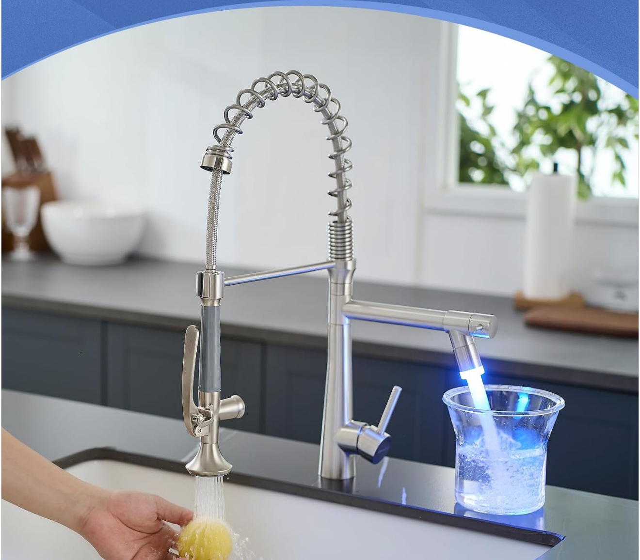
Figure 6.2: This image shows the AIMADI kitchen faucet in operation, demonstrating the simultaneous use of both the main LED-lit spout and the pull-down sprayer. One hand is shown using the pull-down sprayer to clean an item in the sink, while the main spout fills a glass with blue LED-indicated cold water.

Using both spray heads simultaneously makes kitchen life more convenient.