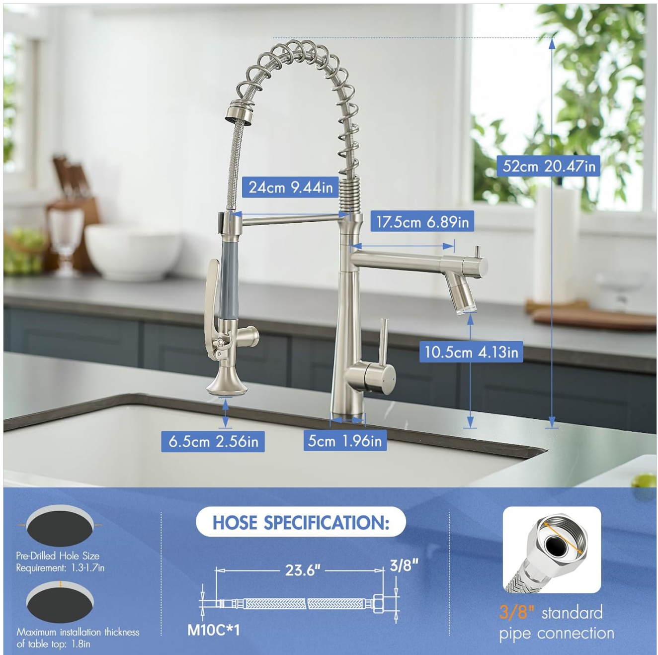
Figure 4.1: Detailed dimensions and hose specifications for the AIMADI kitchen faucet. This image shows the overall height (20.47 inches), spout height (4.13 inches), spout reach (6.89 inches), and the 23.6-inch 3/8" standard pipe connection hose. It also indicates a pre-drilled hole size requirement of 1.3-1.7 inches and a maximum installation thickness of 1.8 inches.