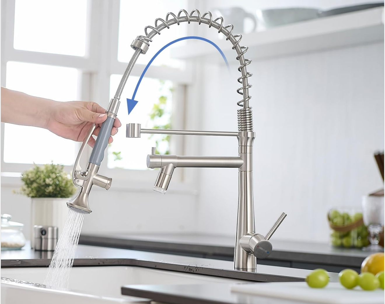
Figure 6.4: This image shows a hand pulling down the sprayer head from the AIMADI kitchen faucet, demonstrating its flexible and extendable design for reaching all areas of the sink.