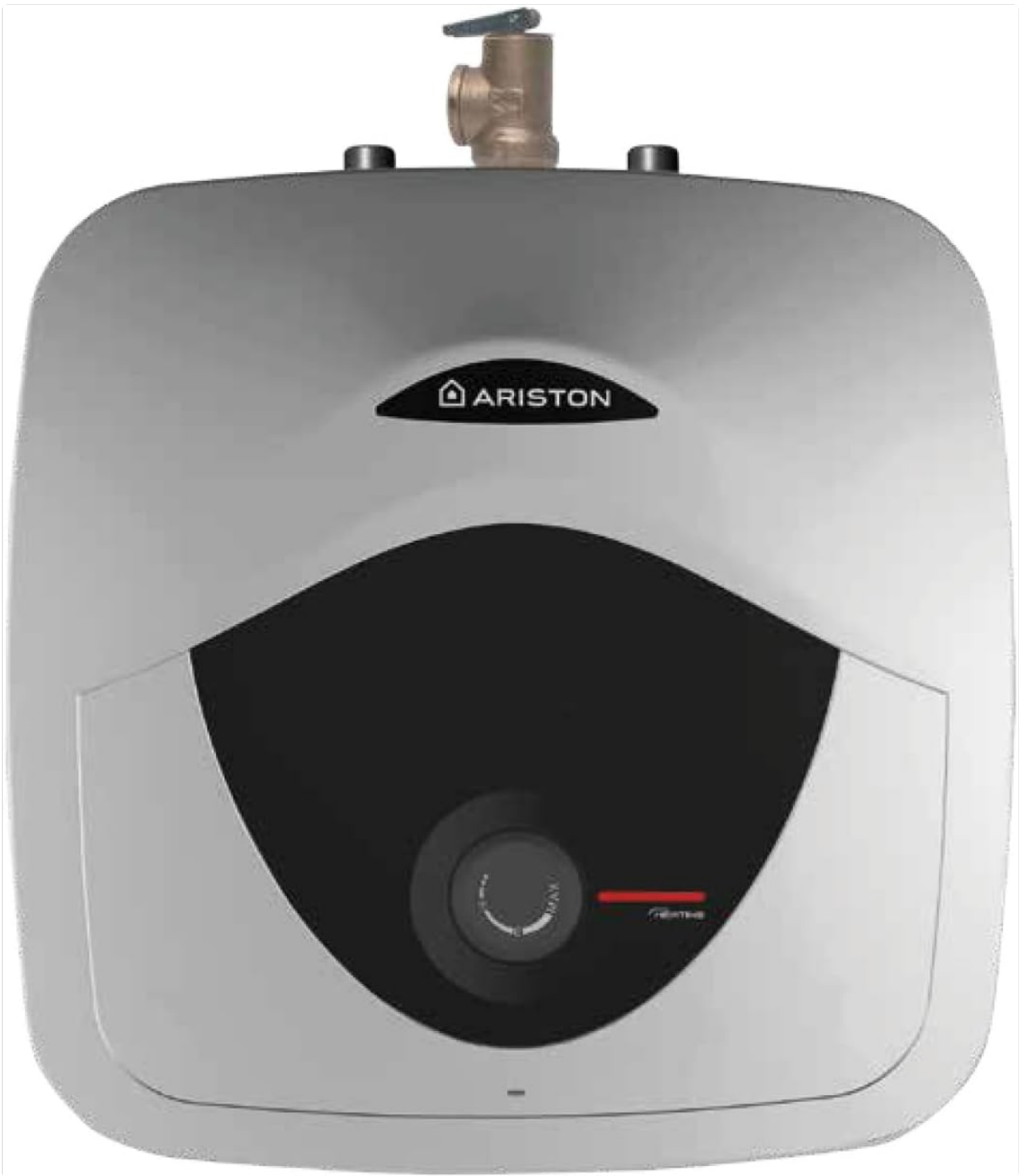
Front view of the Ariston Andris Mini Tank Electric Water Heater.