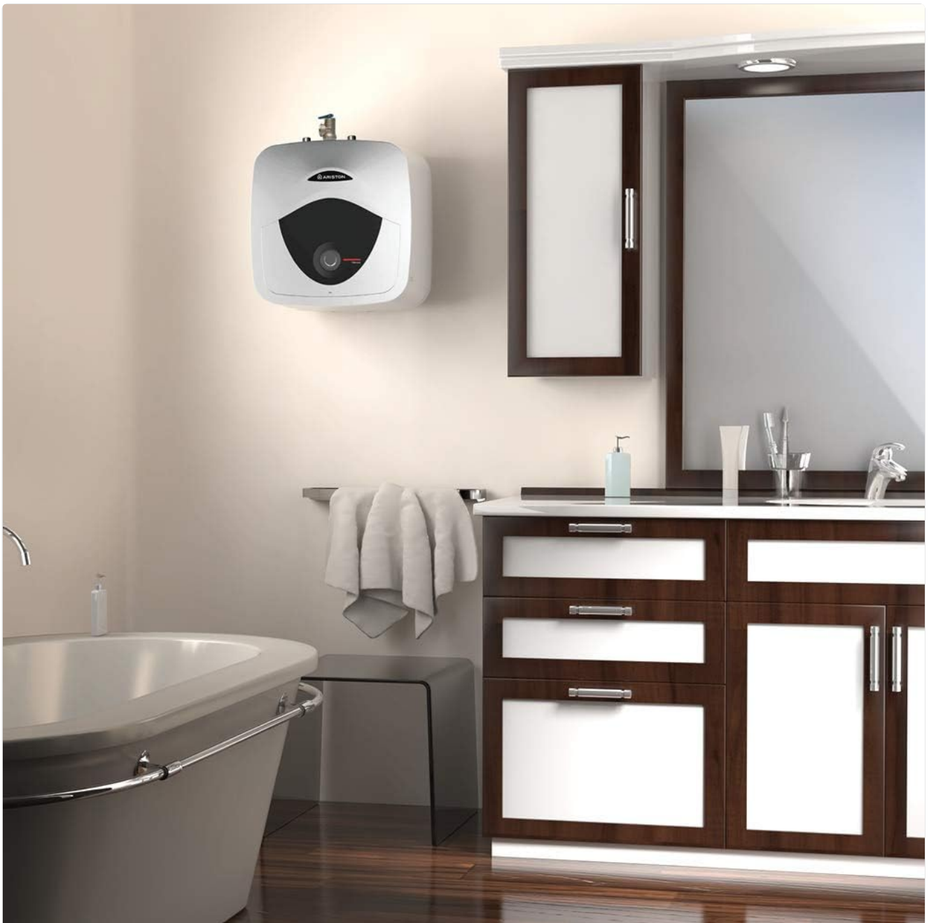
Example of the water heater installed in a bathroom, demonstrating its compact and aesthetic integration.

For detailed plumbing and electrical connections, refer to the official user manual PDF linked in the Support section. Ensure proper water supply connections (cold water inlet, hot water outlet) and install a pressure relief valve as required.