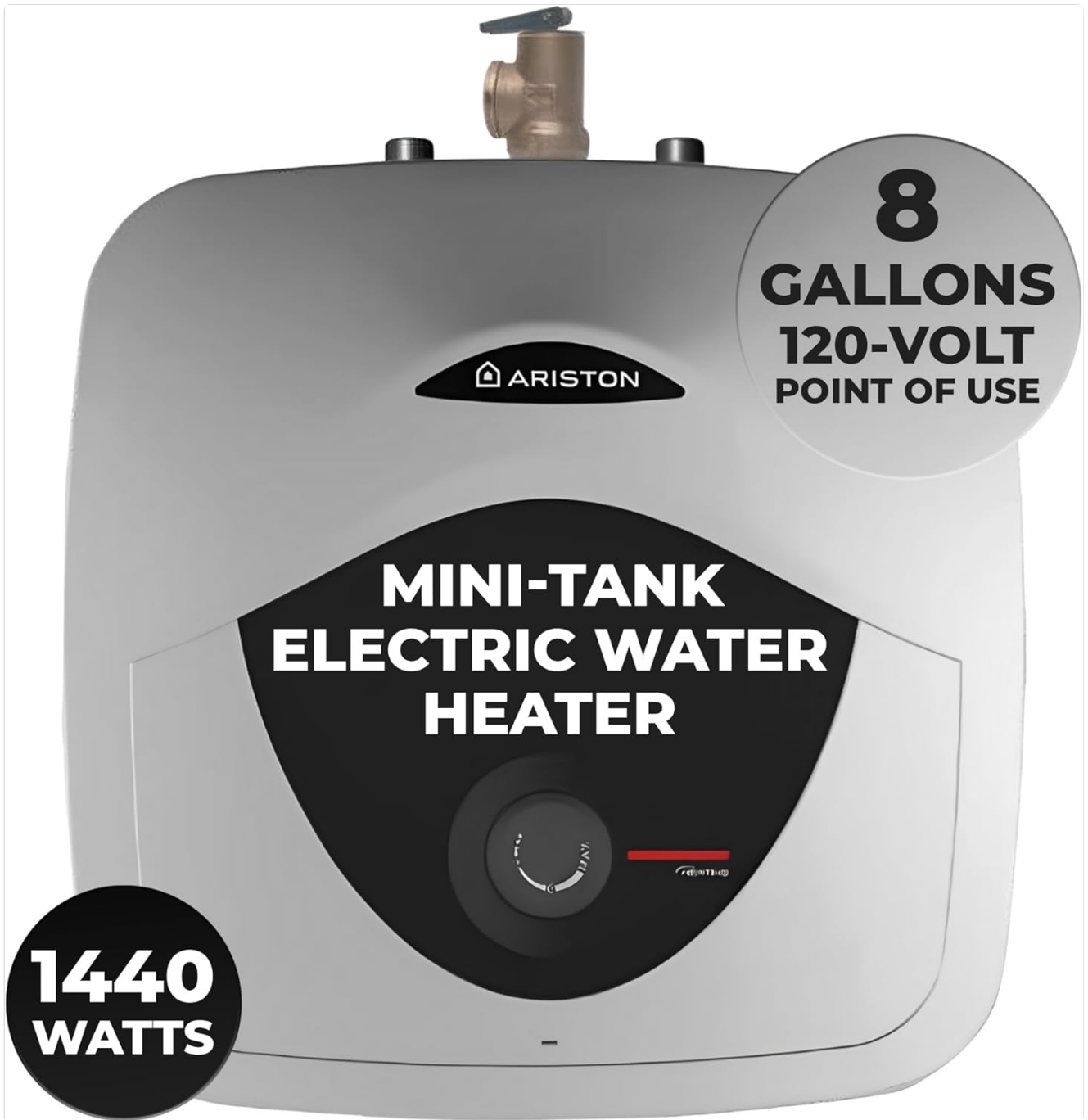
The 8-gallon capacity Ariston Mini Tank, operating at 120-volts and 1440 watts.