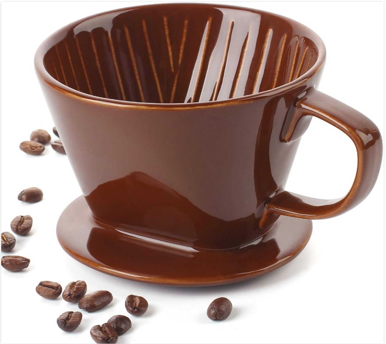
Image 1.1: The DOWAN Pour Over Coffee Dripper, showcasing its ceramic construction and design.