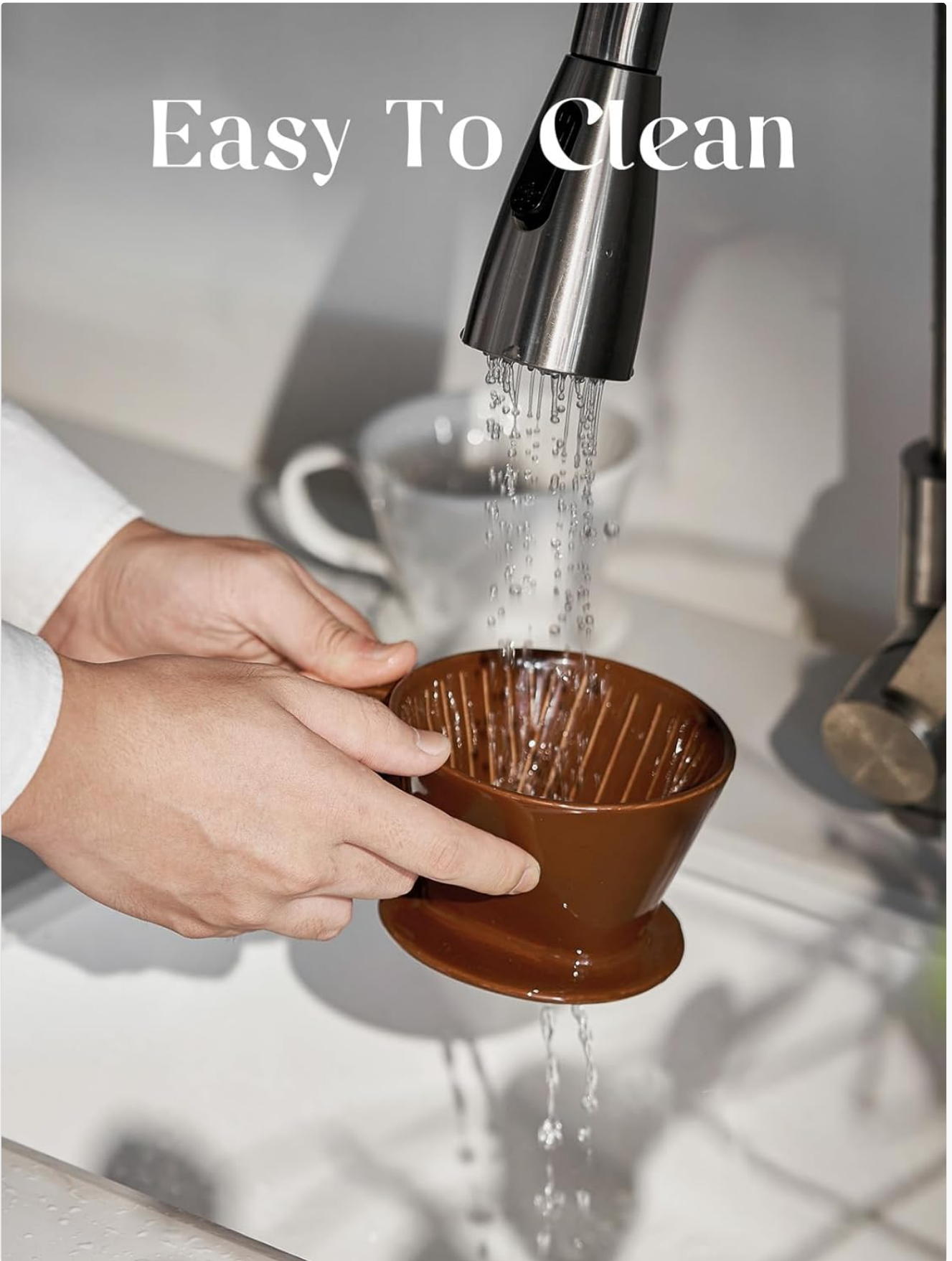
Image 4.1: The dripper is designed for easy cleaning under running water.