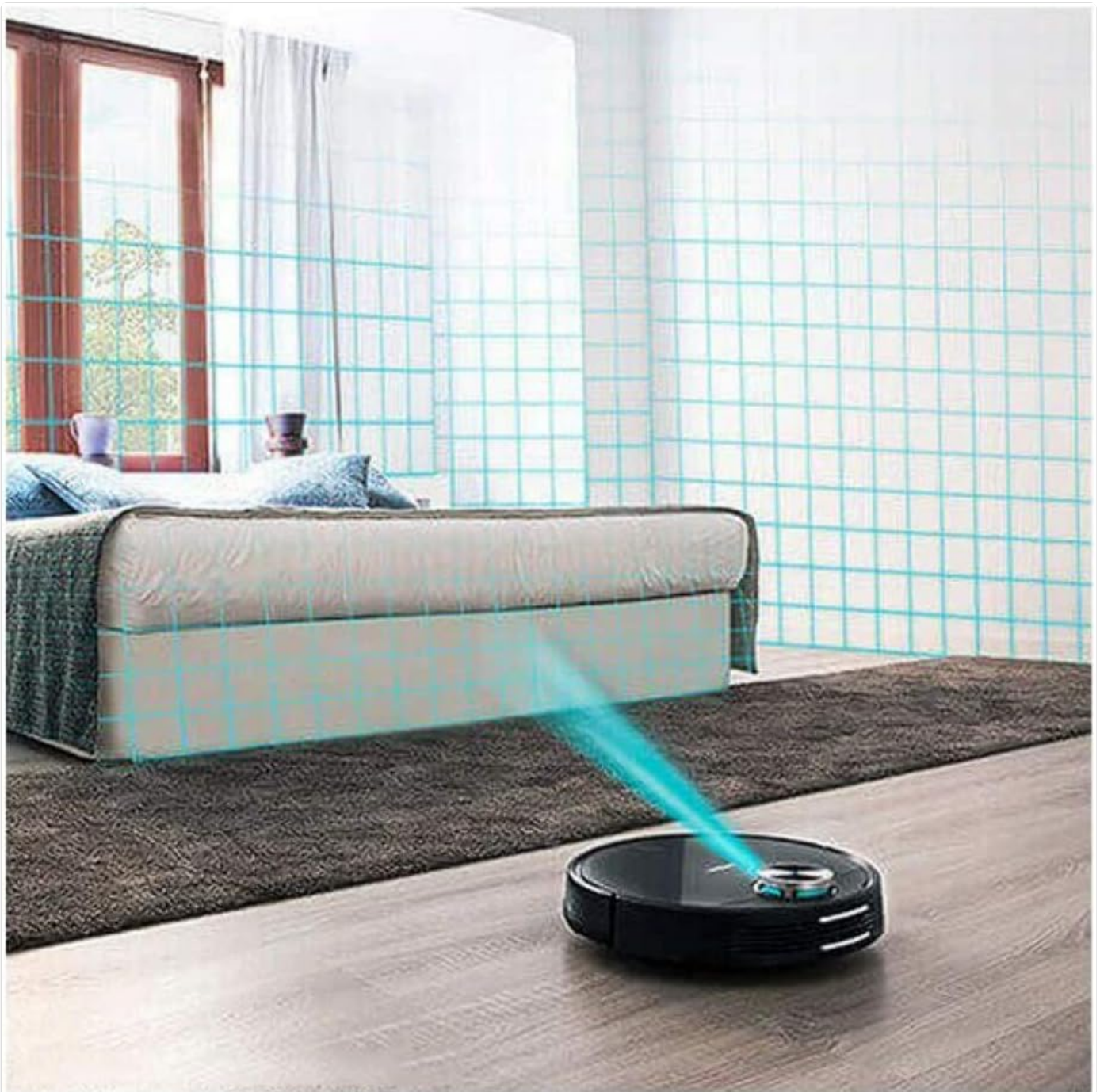
Image: The robot vacuum cleaner actively scanning its surroundings with its laser navigation system during a cleaning cycle.