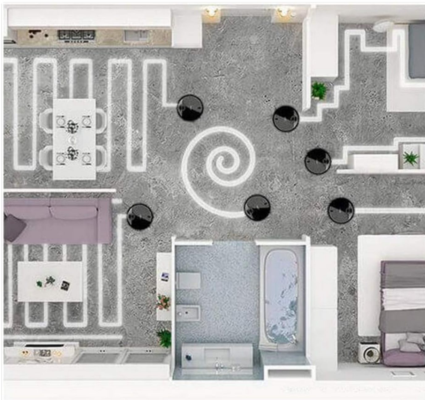
Image: An aerial representation of the robot vacuum cleaner's laser navigation system creating a detailed map of a room.