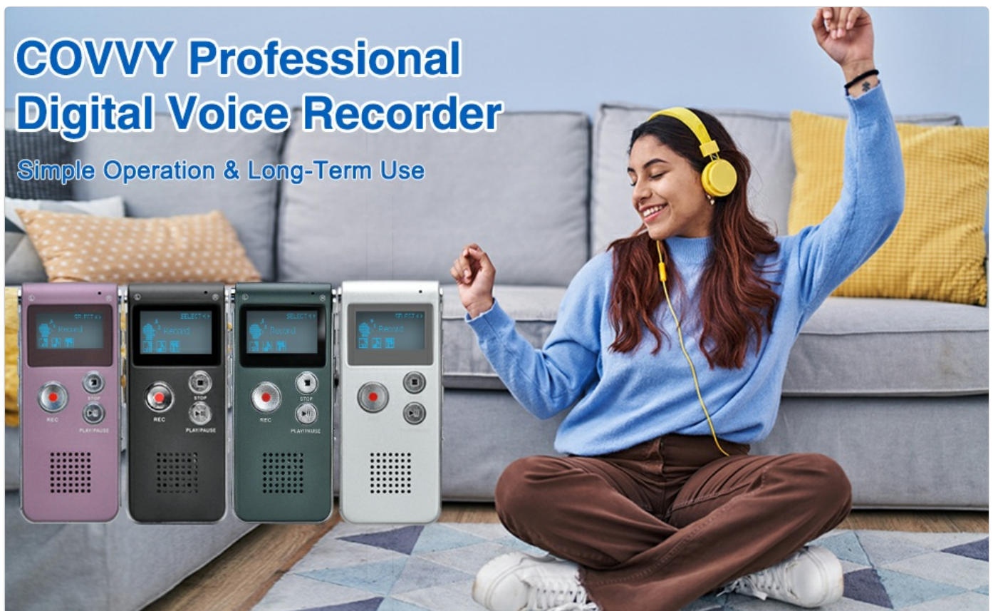
Image 4.1: Overview of multi-function voice recorder capabilities.

Tip: For optimal recording quality, ensure the device is placed on a stable surface and away from excessive background noise.