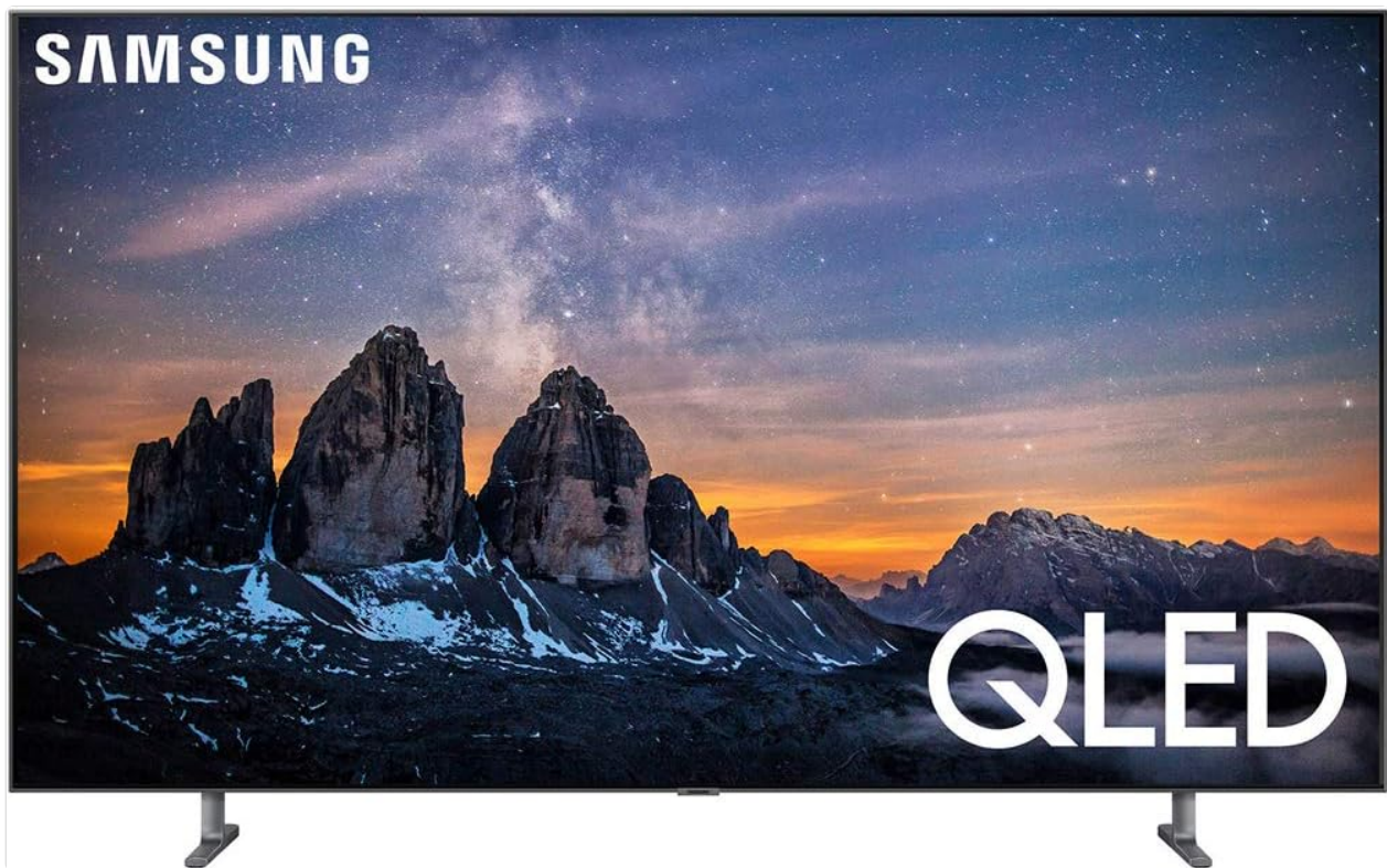
Figure 1.1: Front view of the Samsung QN82Q80RAFXZA 82-Inch QLED 4K Smart TV.