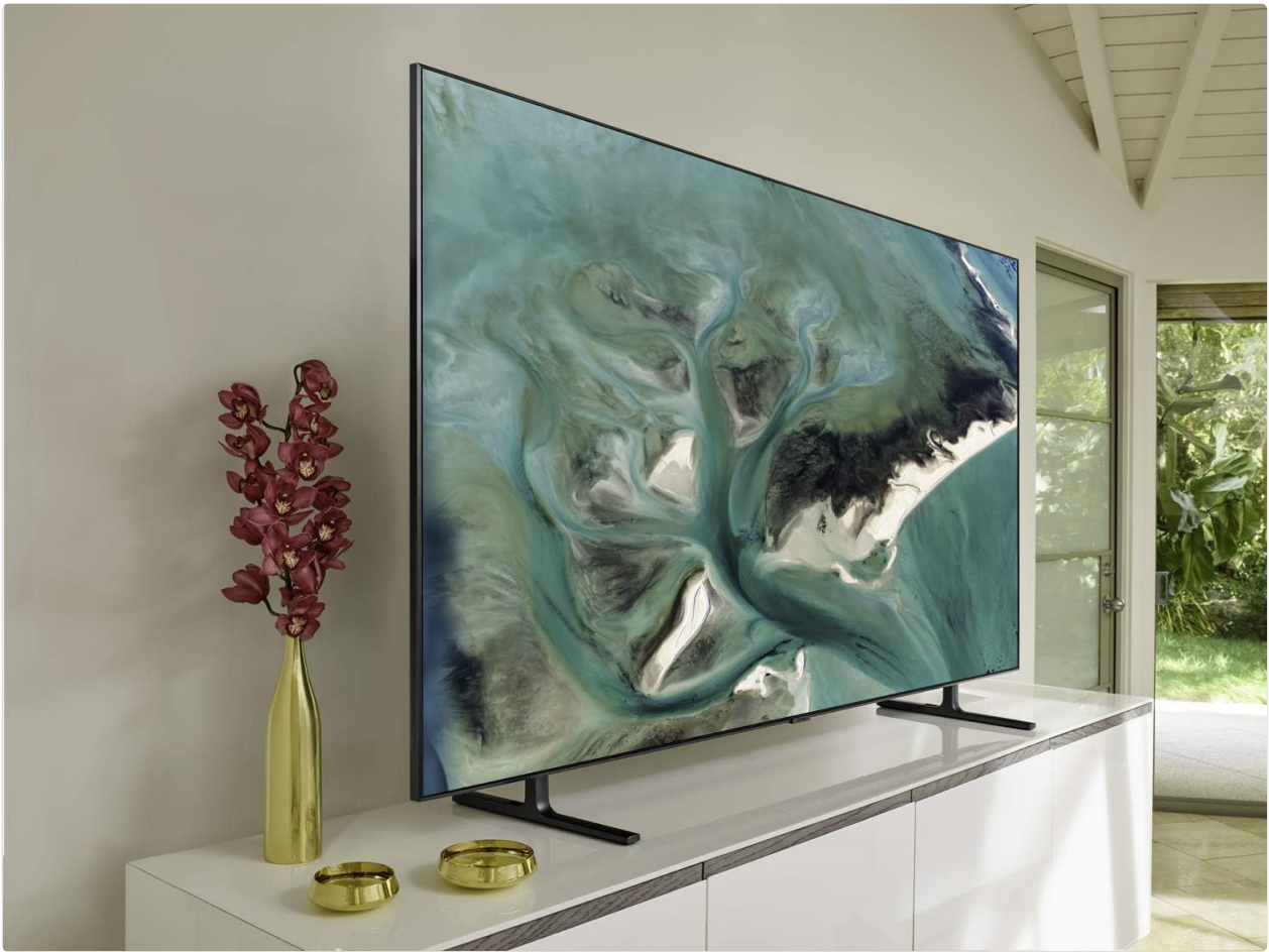
Figure 3.1: Example of TV placement on a media console.