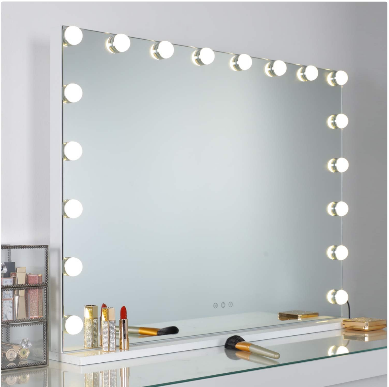
Image: The WAYKING Vanity Mirror with Lights, showcasing its elegant design and bright LED bulbs, suitable for any vanity setup.