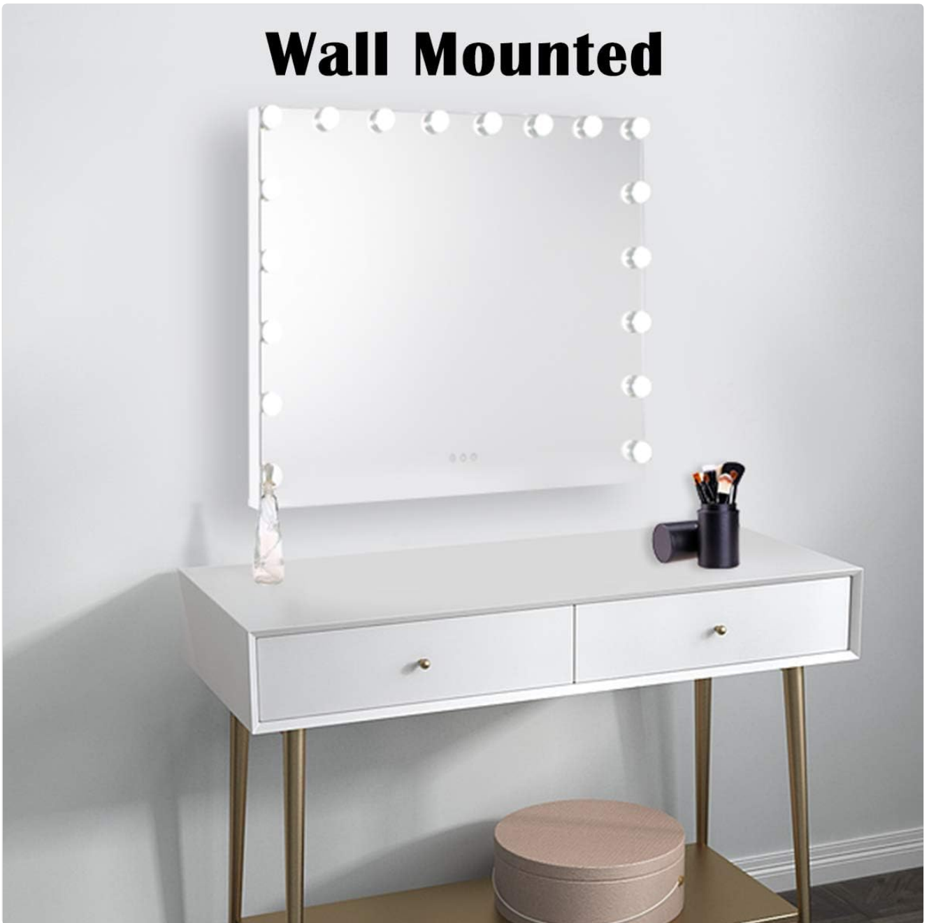
Image: The WAYKING Vanity Mirror shown in a wall-mounted configuration, demonstrating its versatility.