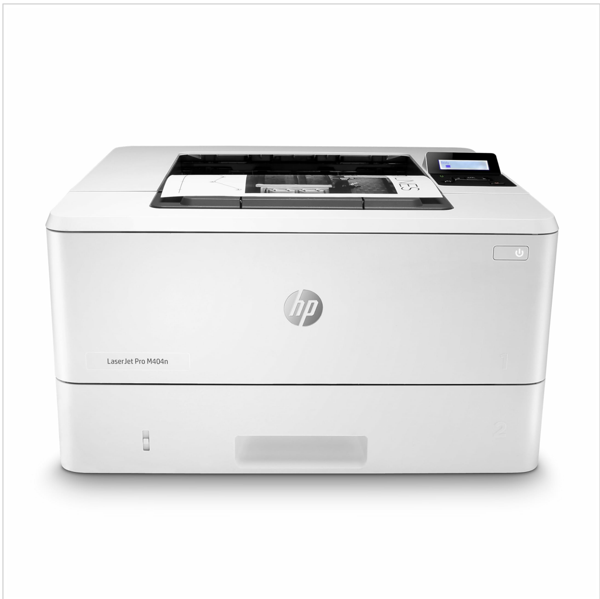
Image: Front view of the HP LaserJet Pro M404n Monochrome Printer.