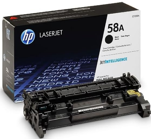
Preinstalled Introductory HP 58A Black LaserJet Toner Cartridge