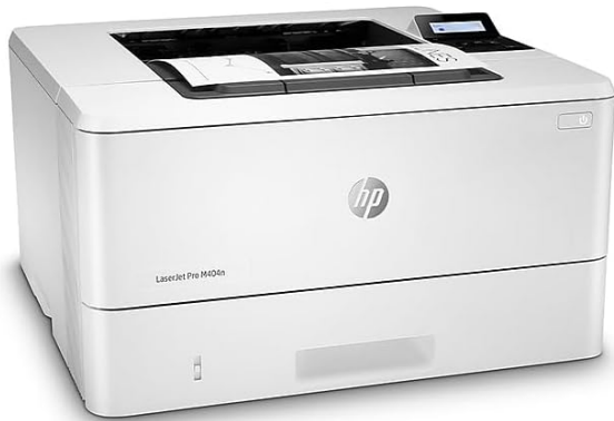
HP LaserJet Pro M404n