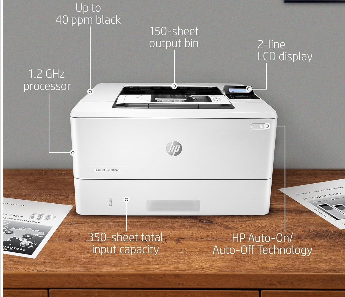
Image: Top-down view of the HP LaserJet Pro M404n, highlighting features like up to 40 ppm black print speed, 150-sheet output bin, 2-line LCD display, 1.2 GHz processor, 350-sheet total input capacity, and HP Auto-On/Auto-Off Technology.