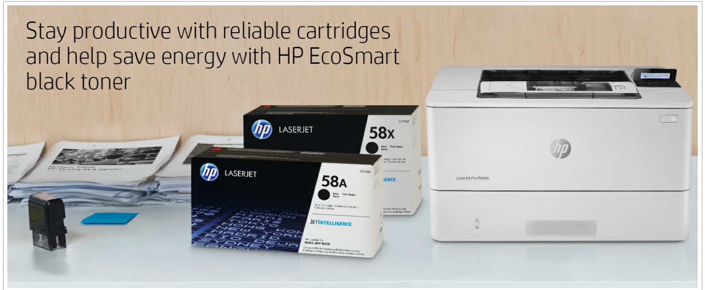
Image: The HP LaserJet Pro M404n highlighting the use of reliable cartridges and HP EcoSmart black toner for energy saving.