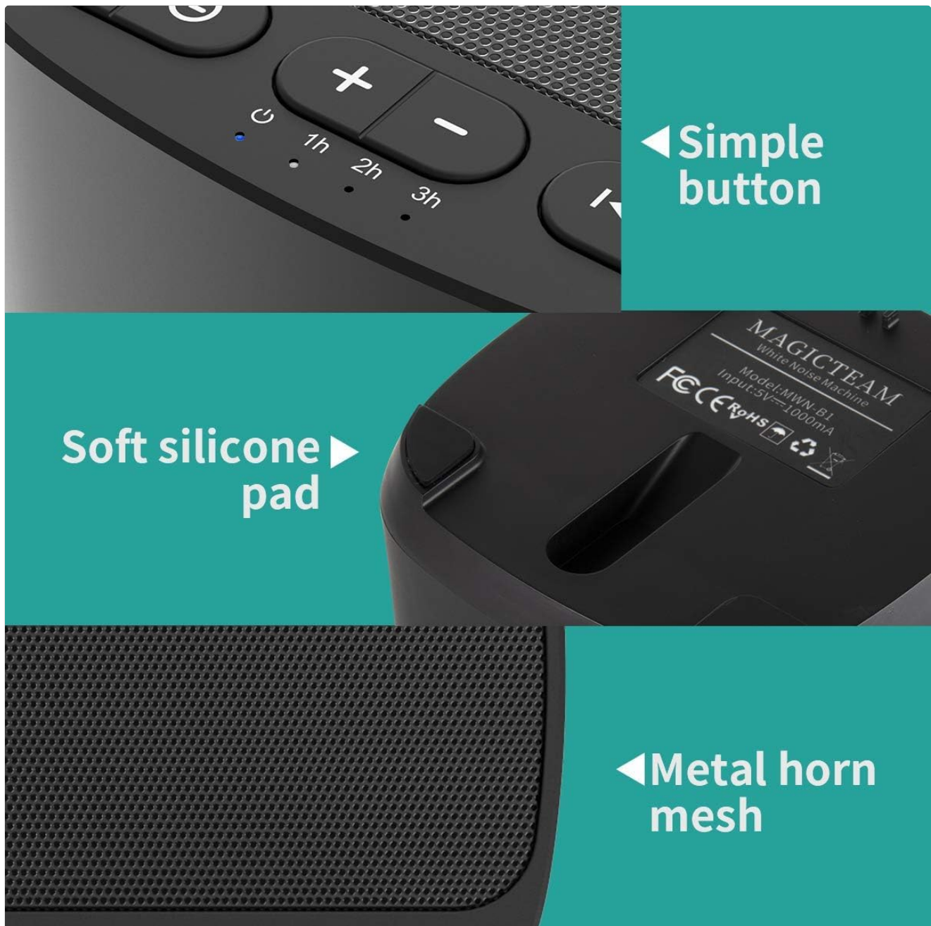
Image: Detailed view of the control buttons on the top of the Magicteam White Noise Machine.