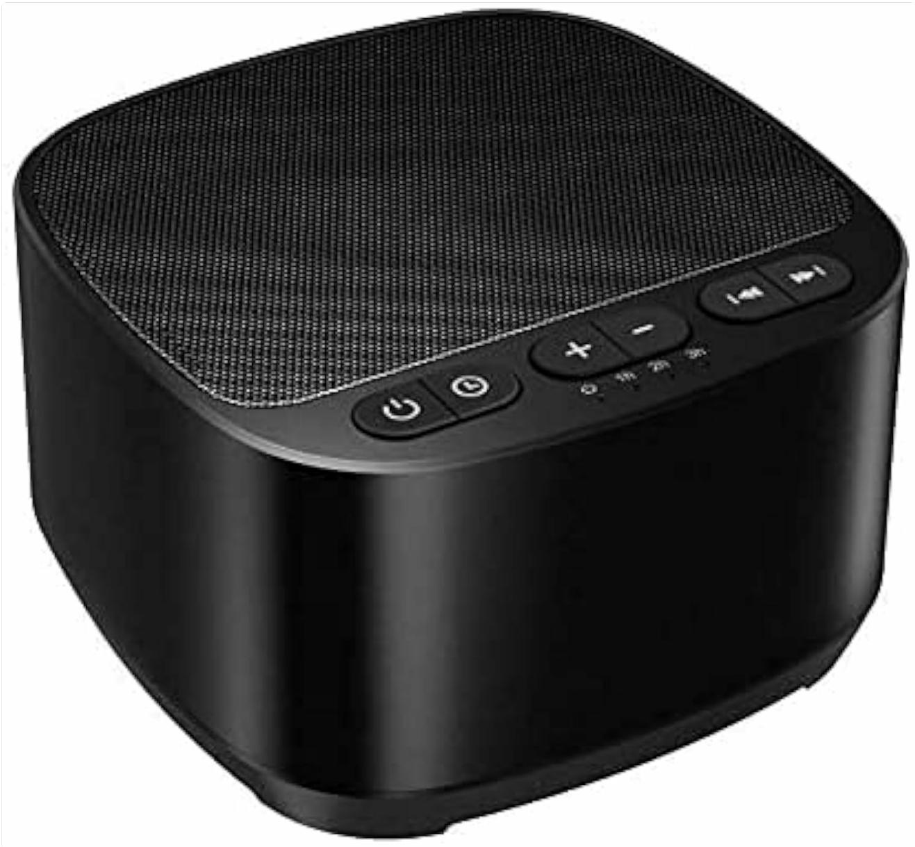
Image: Front view of the Magicteam White Noise Machine, highlighting its compact design and top-mounted control buttons.