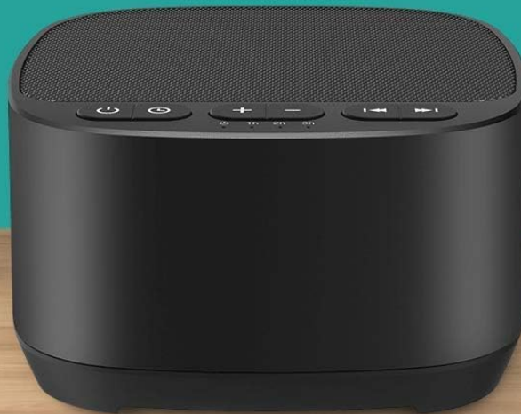
Image: Visual representation of the 40 soothing sounds offered by the device.