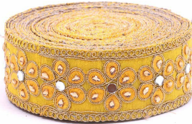
Figure 1.1: A coiled roll of HR Fabric Saree Lace, showcasing its yellow fabric, intricate embroidery, and reflective embellishments. The lace is neatly rolled, indicating its packaging form.