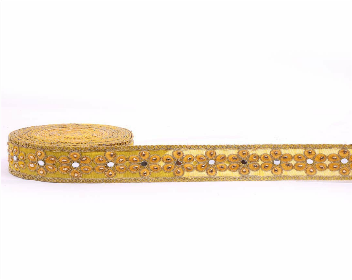
Figure 3.1: The HR Fabric Saree Lace unrolled, displaying its full length and the consistent design of floral embroidery with reflective accents along its side. This view highlights the texture and width of the lace.

Depending on the craft project, the lace can be glued, stitched, or otherwise affixed to materials such as paper, cardboard, wood, or other fabrics. For best results, use an adhesive suitable for fabric and the material you are working with.