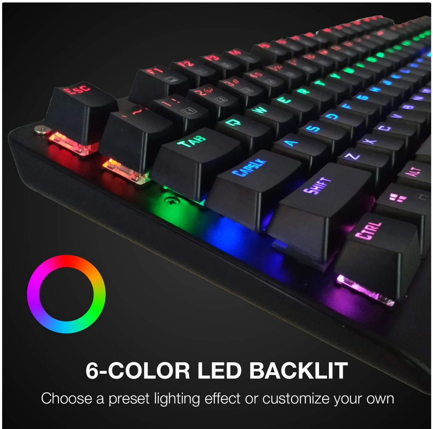
Image: E-YOOSO K600 keyboard showcasing its 6-color LED backlighting.

The keyboard features a 6-color LED backlight with multiple dynamic lighting effects and preset gaming modes.