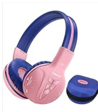
Image: Ergonomic design details showing soft earcups, adjustable and sturdy headband, and foldable functionality.