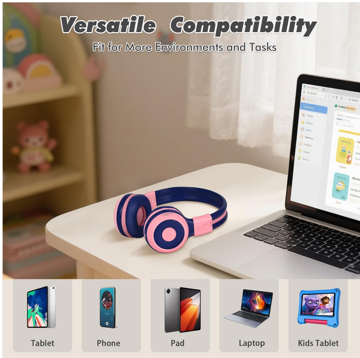
Image: Versatile compatibility with various devices including tablets, phones, iPads, laptops, and kids' tablets.

Image: Illustration of wireless mode with 15 hours play time and wired mode for continuous use.