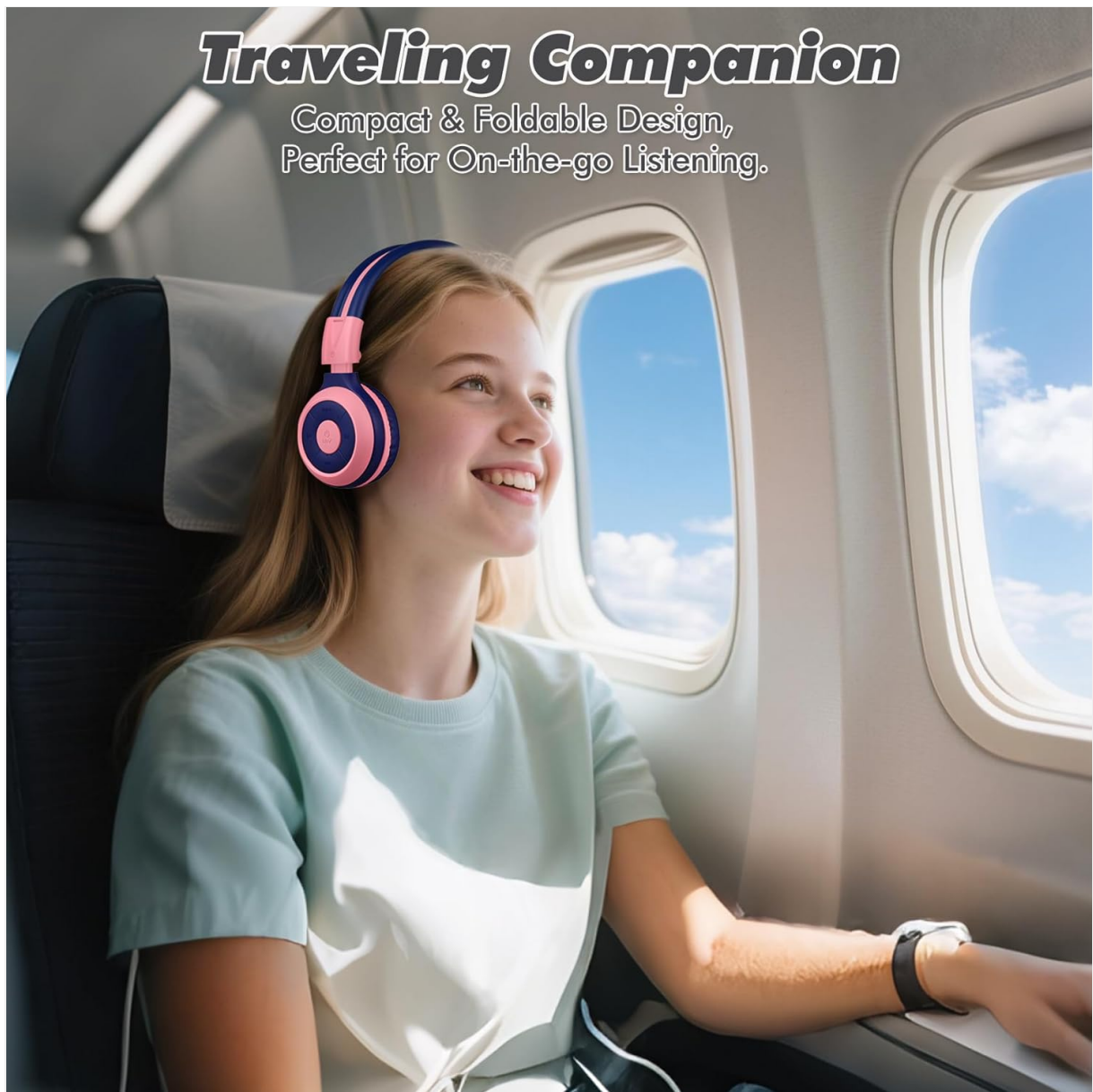
Image: The SIMOLIO JH-712 headphones are a perfect travel companion due to their compact and foldable design.

Compact & Foldable Design, Perfect for On-the-go Listening.