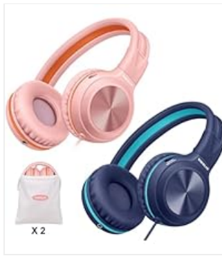
Image: Folding the headphones and storing them in the hard EVA case for space-saving and easy carrying.