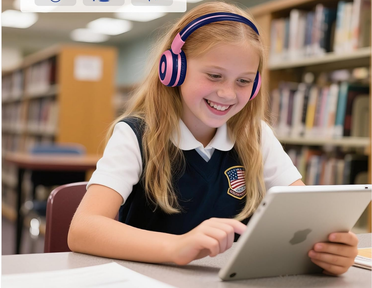
Image: Safe Volume Limited feature with three distinct modes for different age groups and environments.