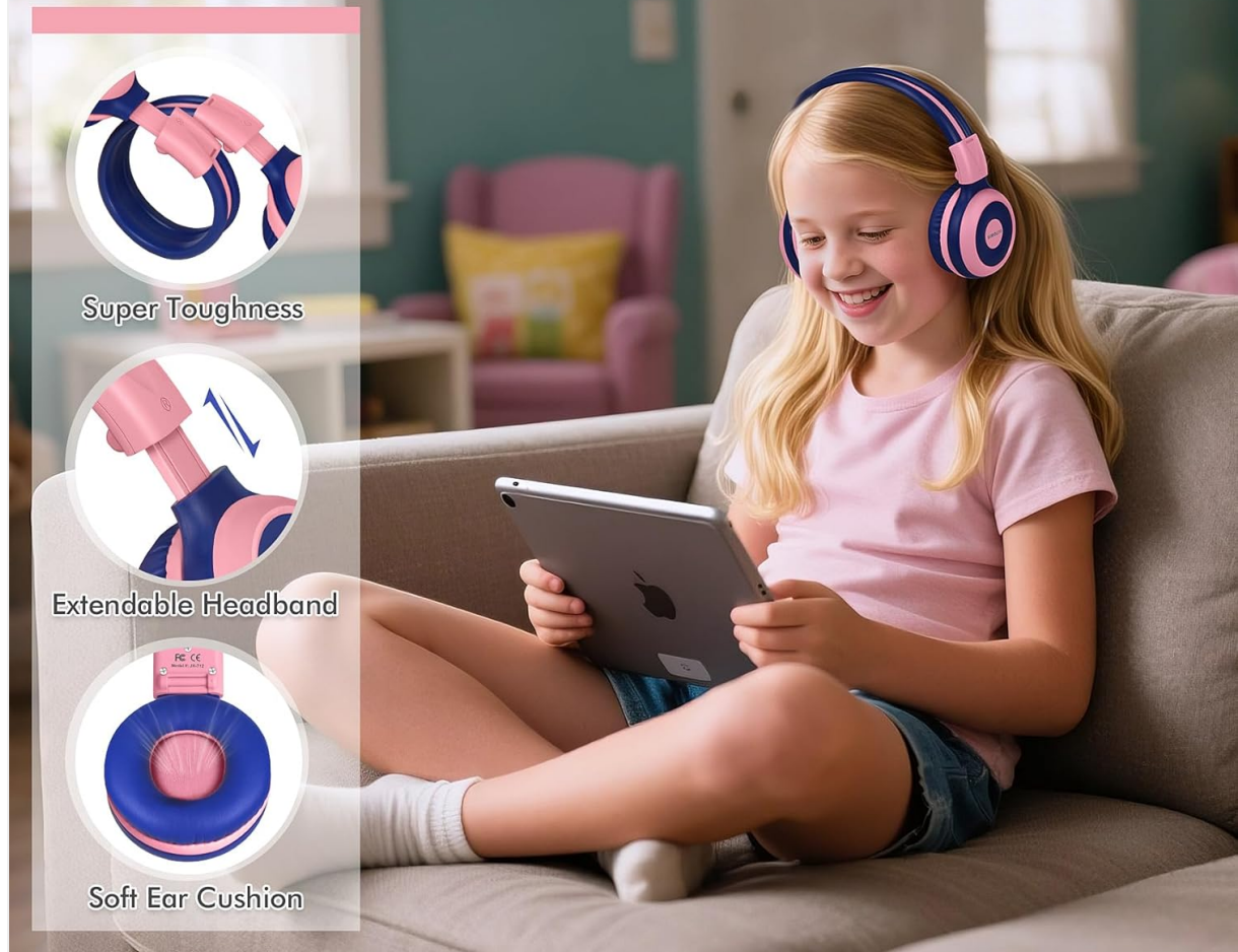
Image: Features highlighting the upgraded comfort, including super toughness, extendable headband, and soft ear cushions.