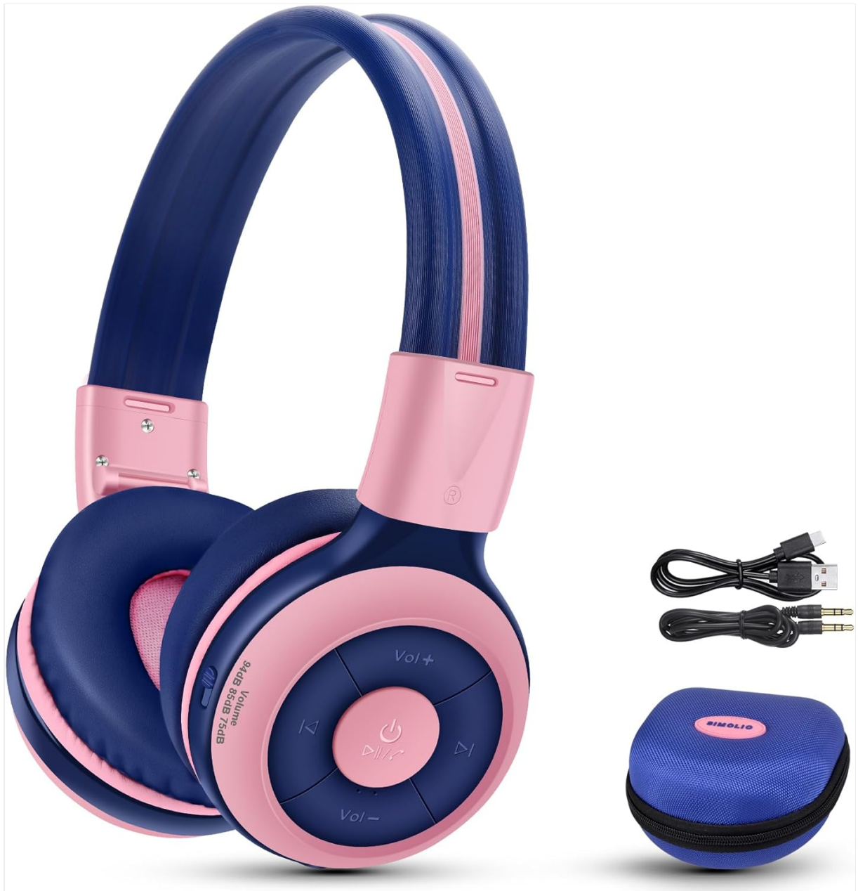
Image: Contents of the SIMOLIO JH-712 headphone package, including the headphones, cables, and EVA case.