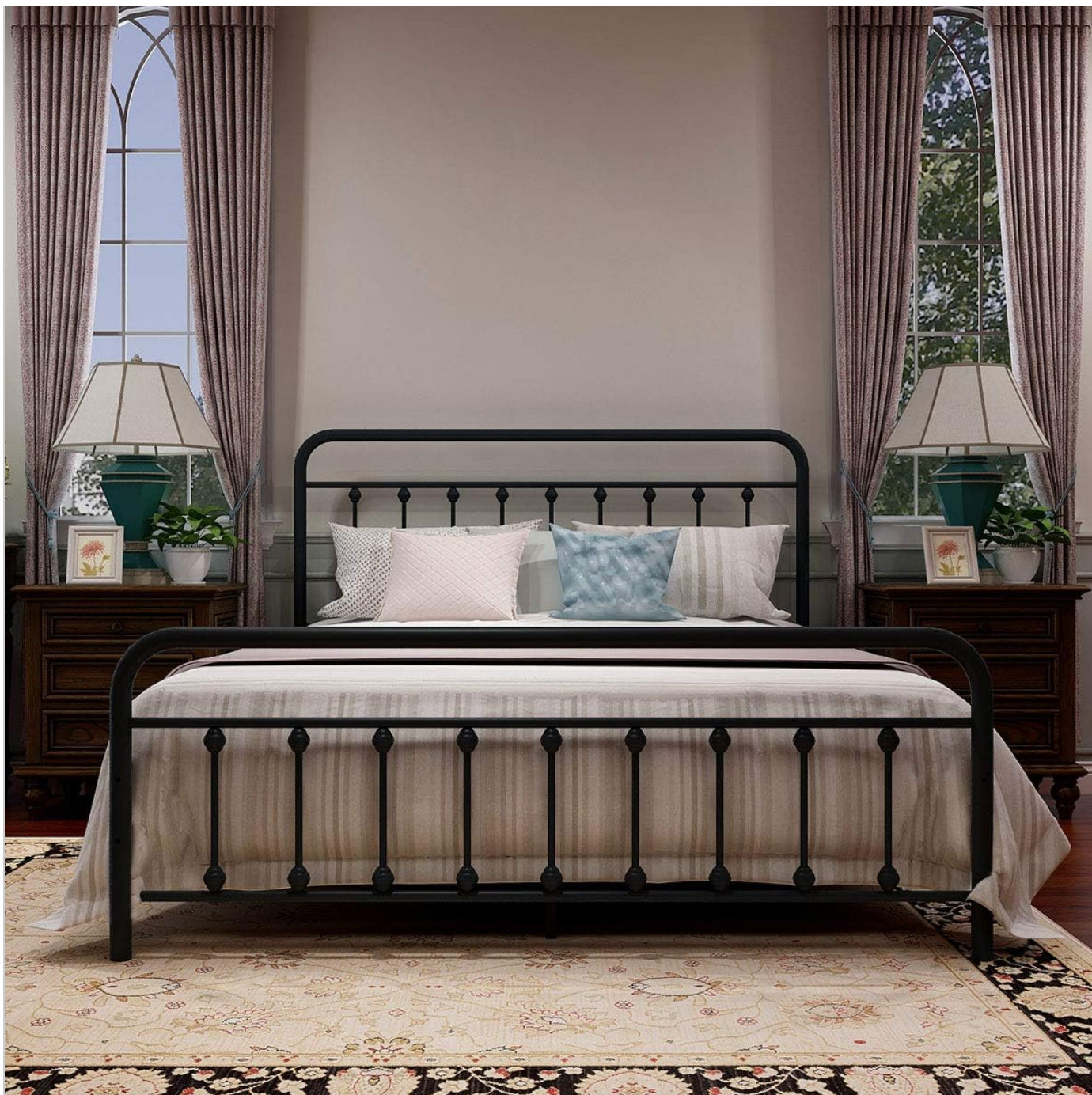
Figure 1: Assembled AUFANK Queen Size Victorian Metal Bed Frame. This image shows the fully assembled bed frame, showcasing its design and appearance within a bedroom.