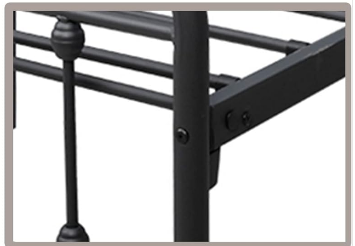
Figure 2: Bed Frame Construction Details. This composite image provides detailed views of the bed frame's construction, including the steel slats for mattress support, the six stable legs in contact with the floor, and the robust platform designed to prevent noise and scratches.

Robust bed platform and manufacturing experience to avoid noise, vibration and scratches.